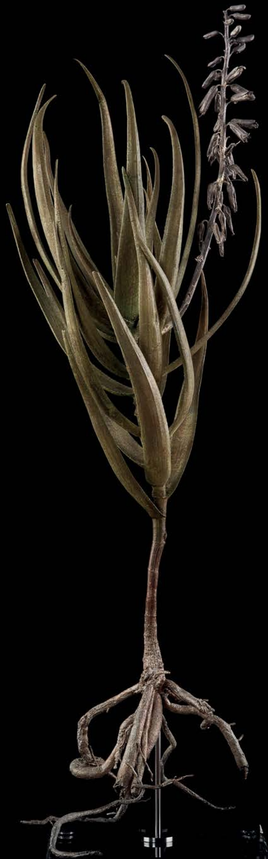
Aloe tenuior bronze and silver on crystal base 48 x 24 x 13 cm