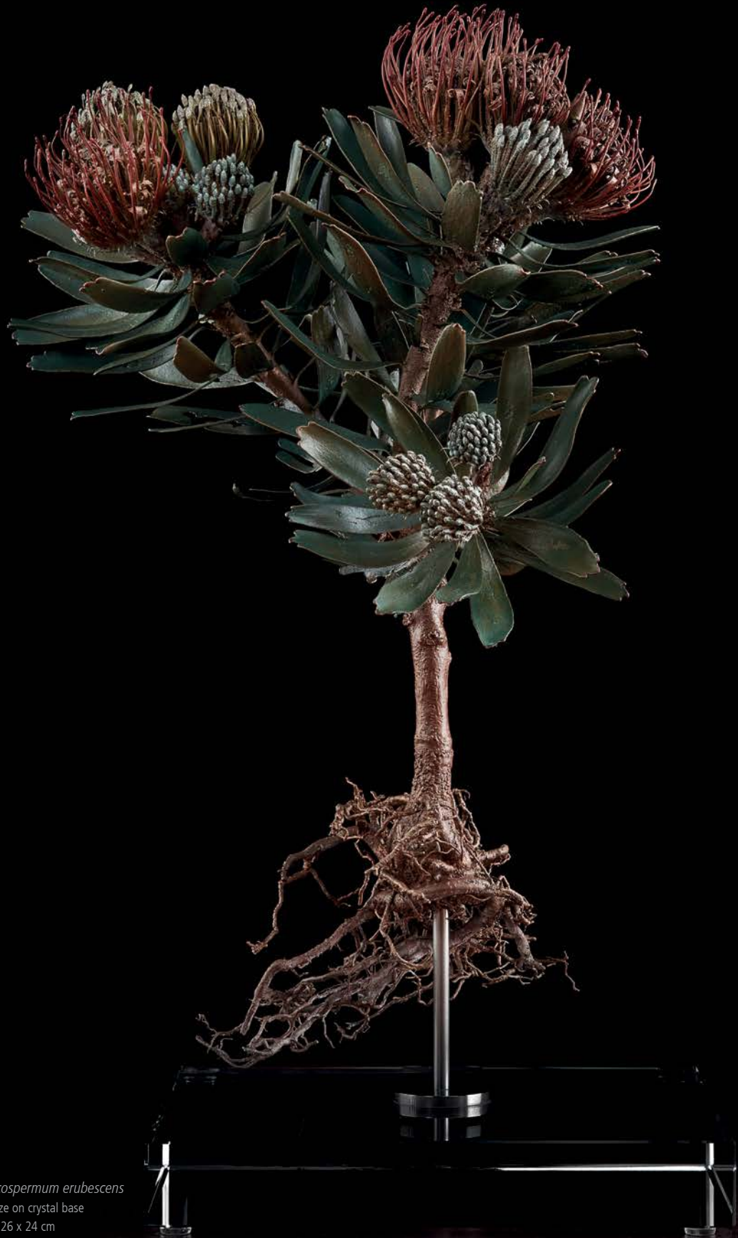
Leucospermum erubescens bronze on crystal base 42 x 26 x 24 cm