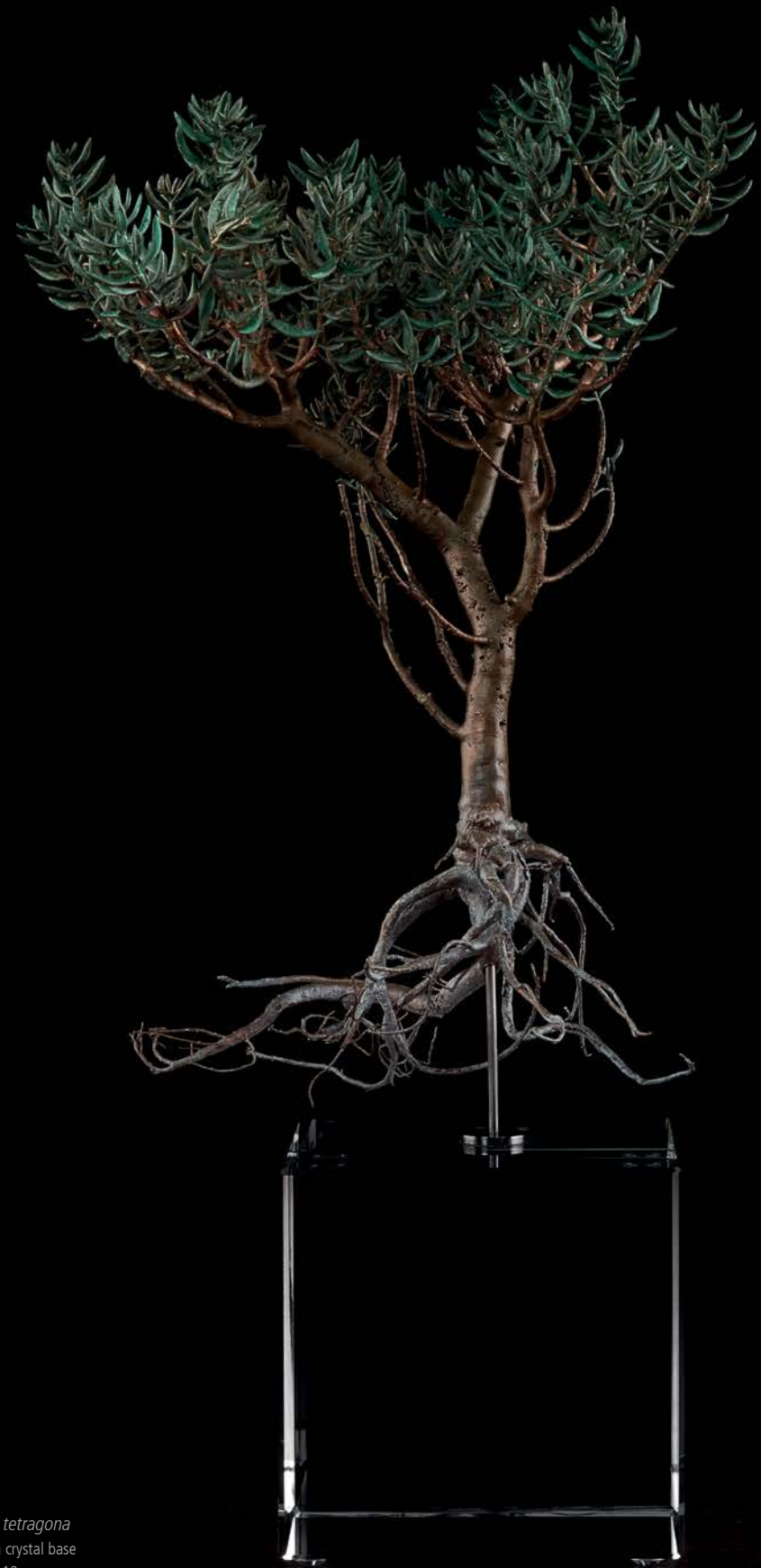
Crassula tetragona bronze on crystal base 31 x 15 x 12 cm