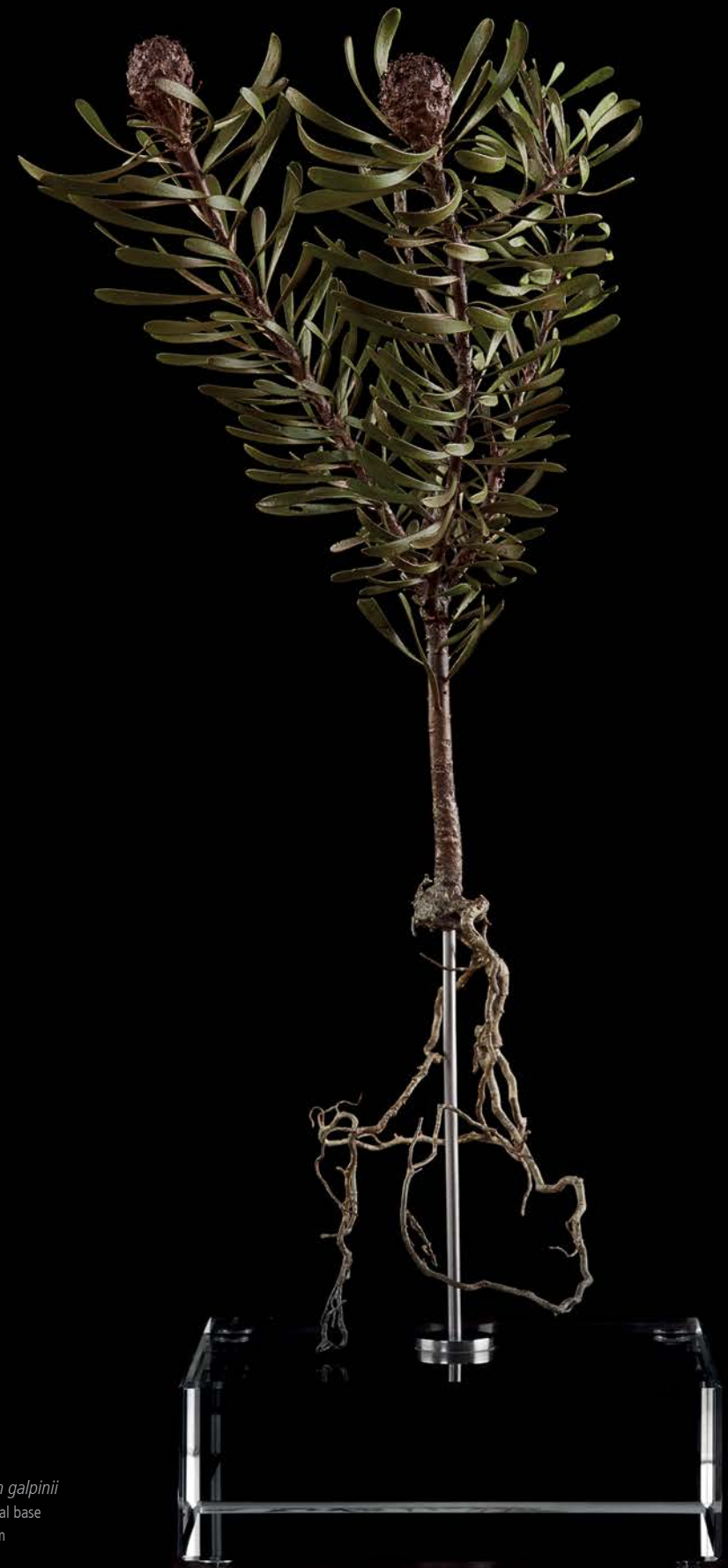
Leucadendron galpinii bronze on crystal base 33 x 15 x 15 cm