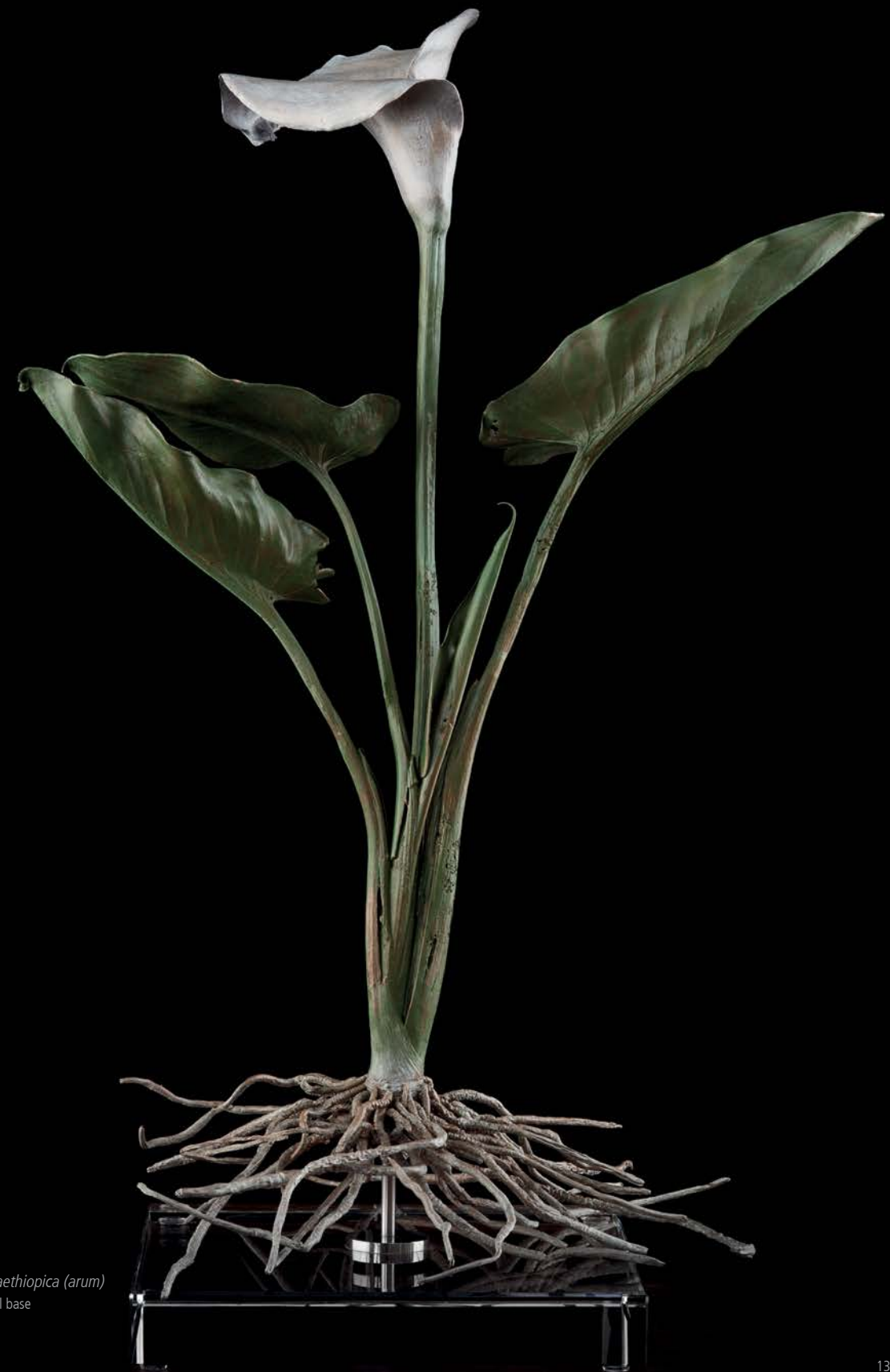
Zantedeschia aethiopica (arum) bronze on crystal base 55 x 37 x 27 cm