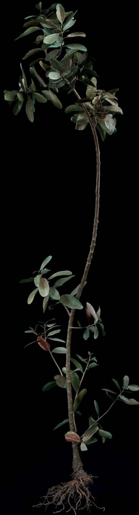
Sideroxylon inerme bronze on stainless steel base 178 x 46 x 44 cm