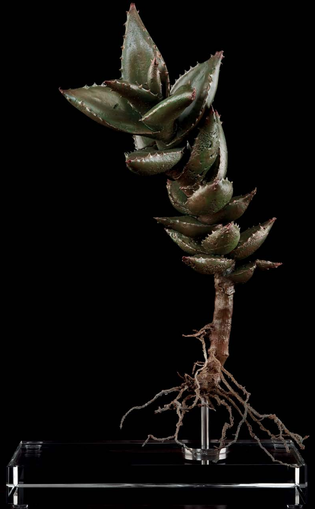
Aloe distans bronze on crystal base 35 x 20 x 17 cm