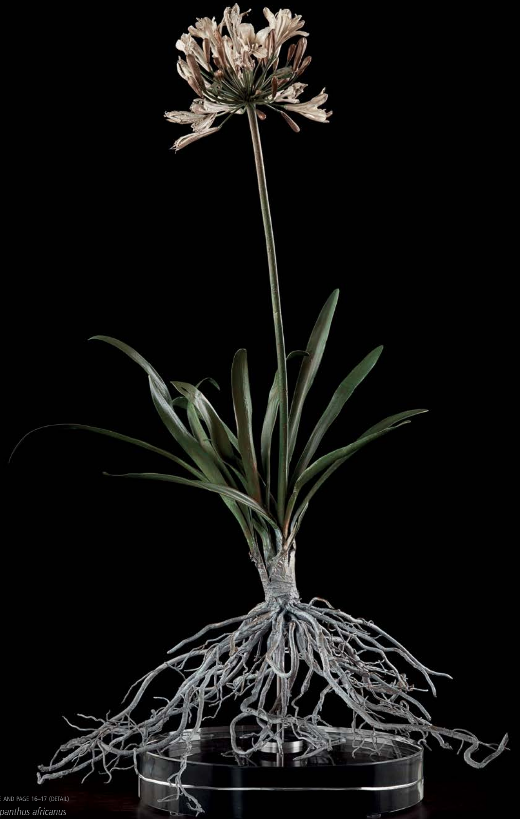
ABOVE AND PAGE 16-17 (DETAIL) Agapanthus africanus bronze and silver on crystal base 60 x 44 x 42 cm