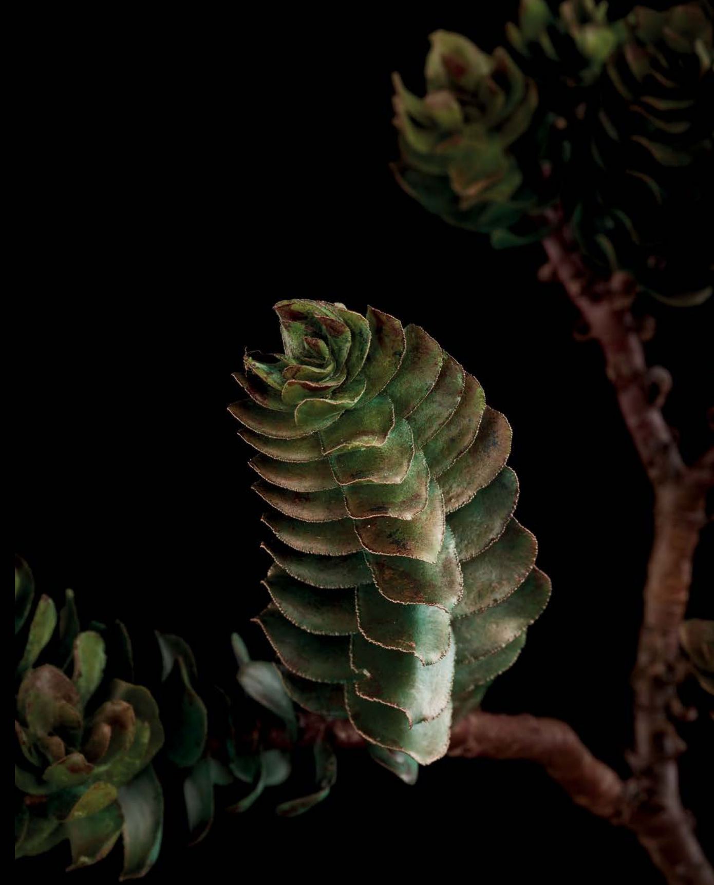
ABOVE AND RIGHT (DETAIL) Crassula dejecta bronze and silver on crystal base 43 x 32 x 21 cm