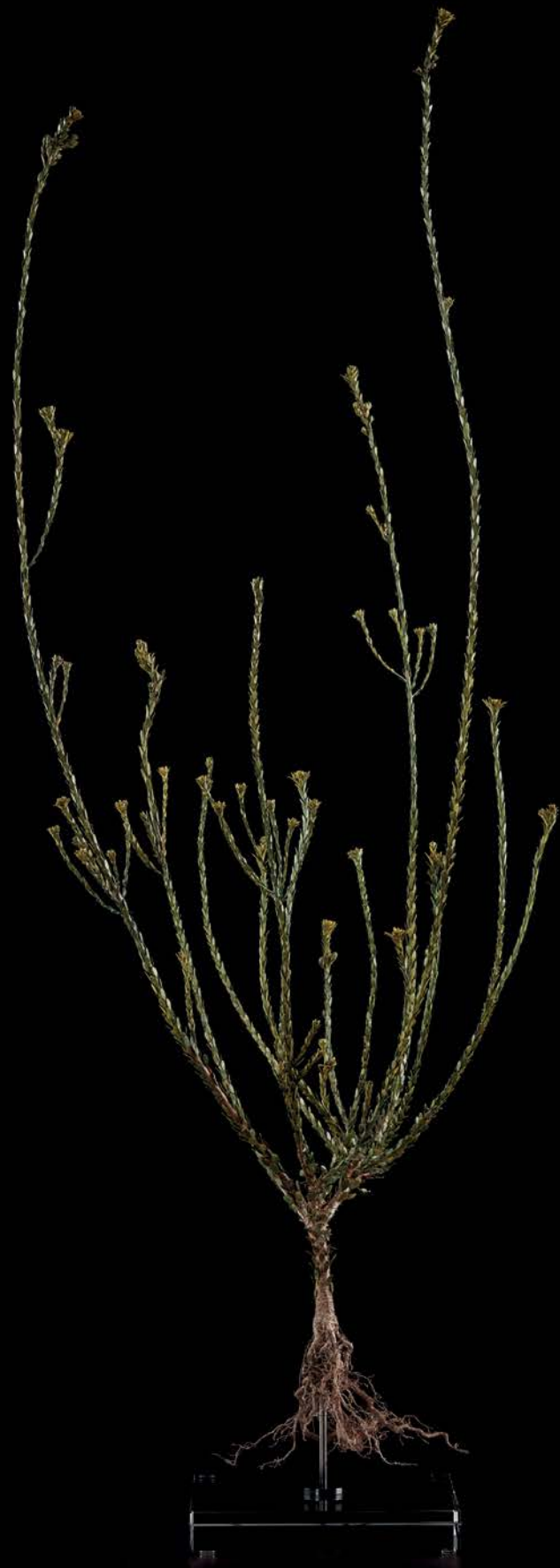
Leucadendron thymifolium bronze on crystal base 112 x 49 x 45 cm