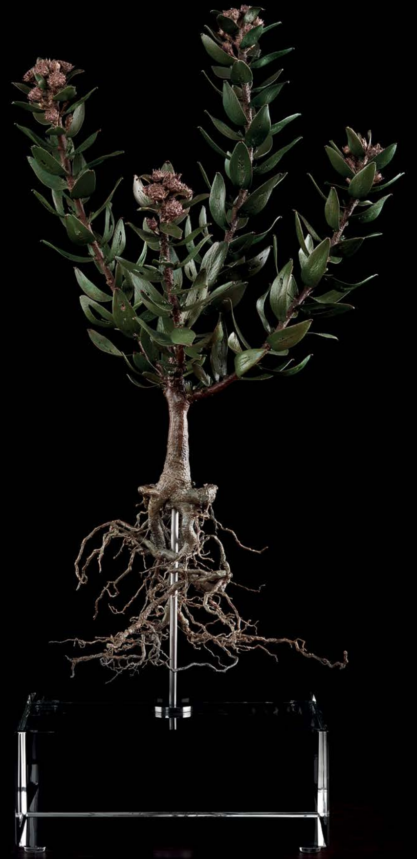
Leucospermum bolusii bronze on crystal base 42 x 22 x 17 cm