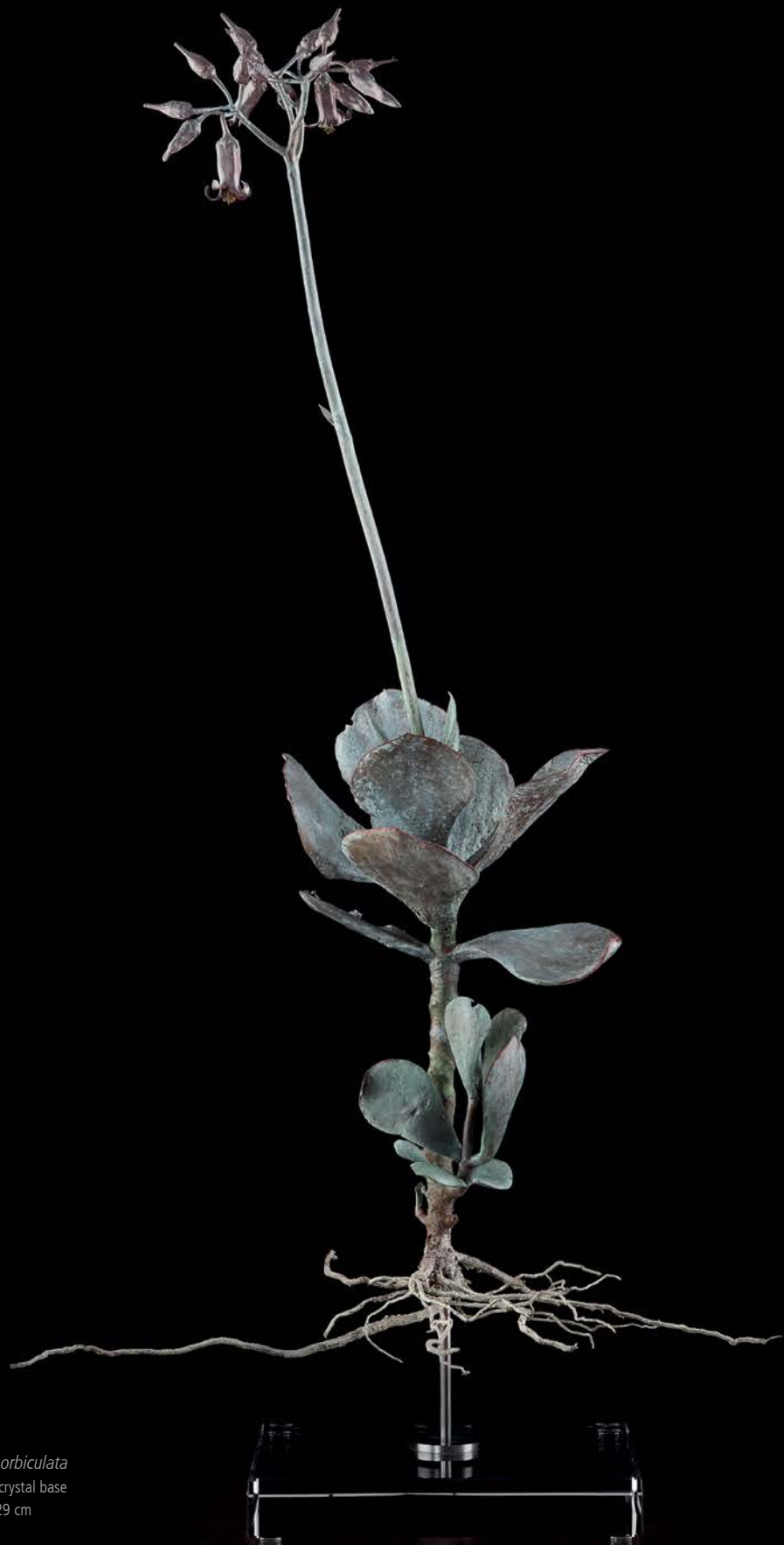
Cotyledon orbiculata bronze on crystal base 72 x 36 x 29 cm