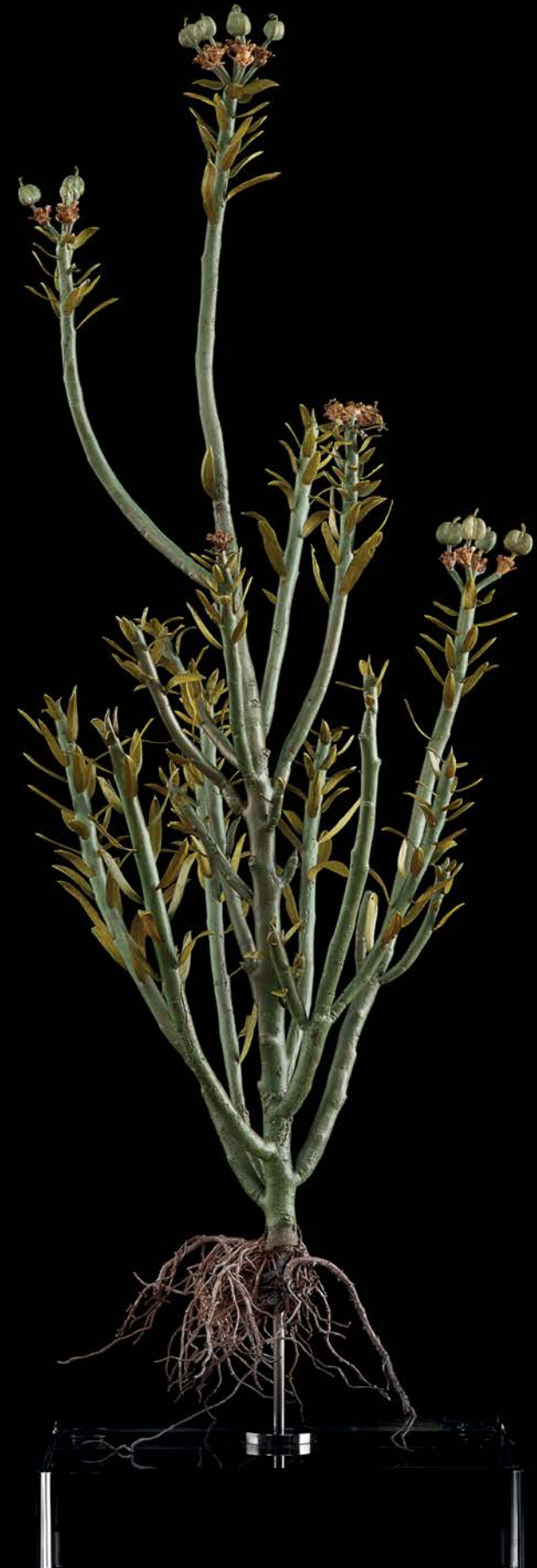
ABOVE AND LEFT (DETAIL) Euphorbia mauritanica bronze on crystal base 53 x 20 x 18 cm