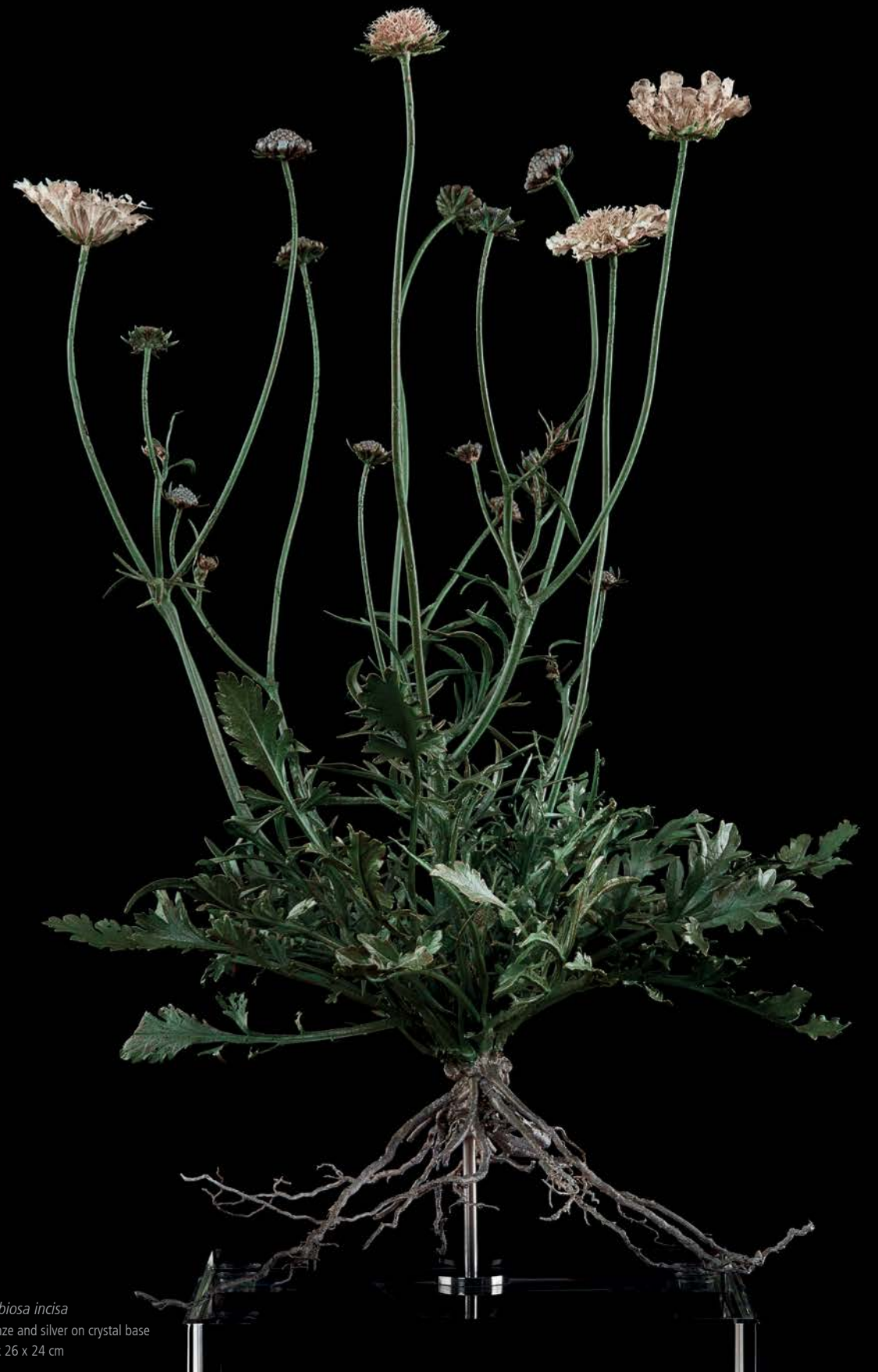
Scabiosa incisa bronze and silver on crystal base 41 x 26 x 24 cm