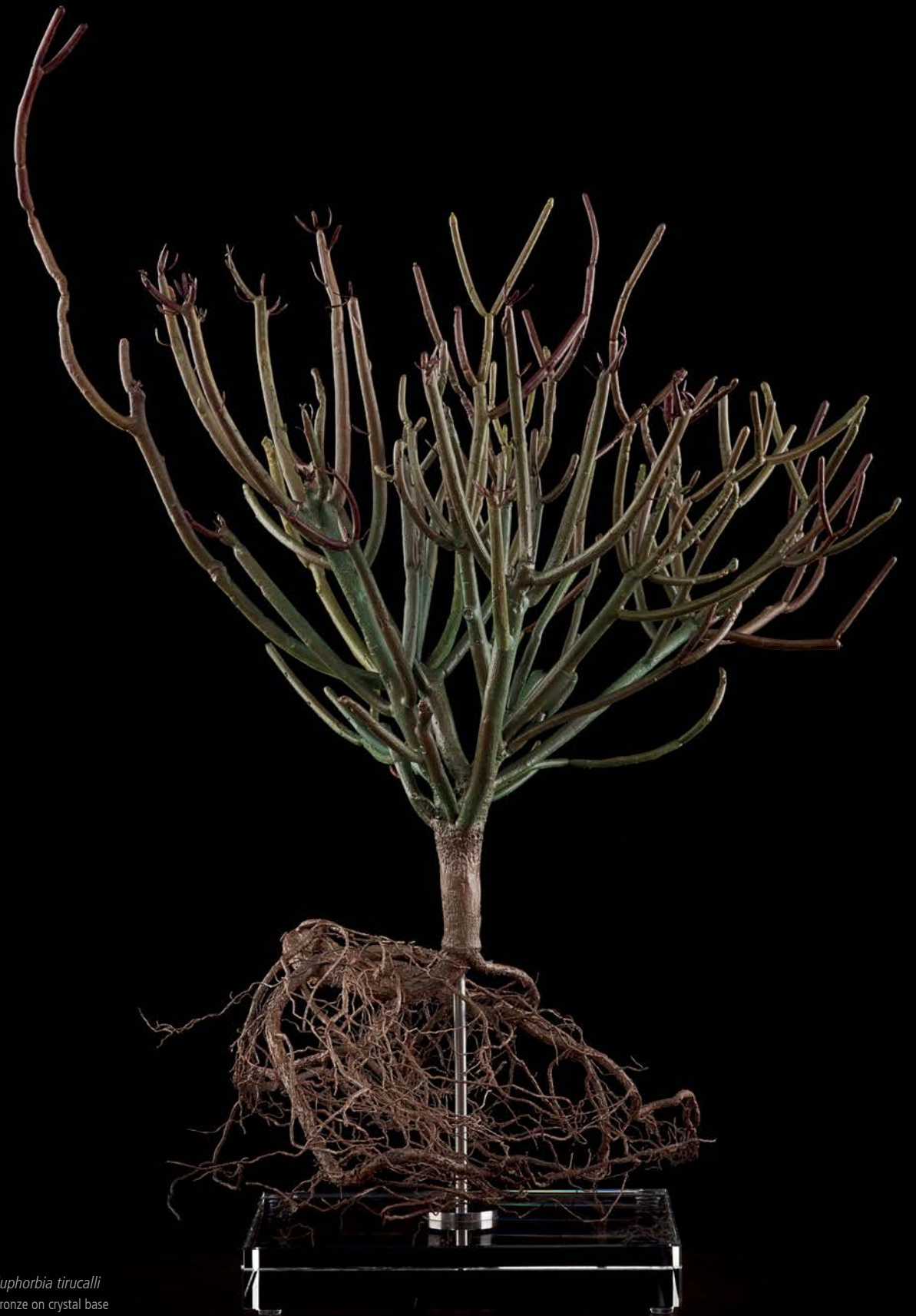
Euphorbia tirucalli bronze on crystal base 61 x 43 x 40 cm