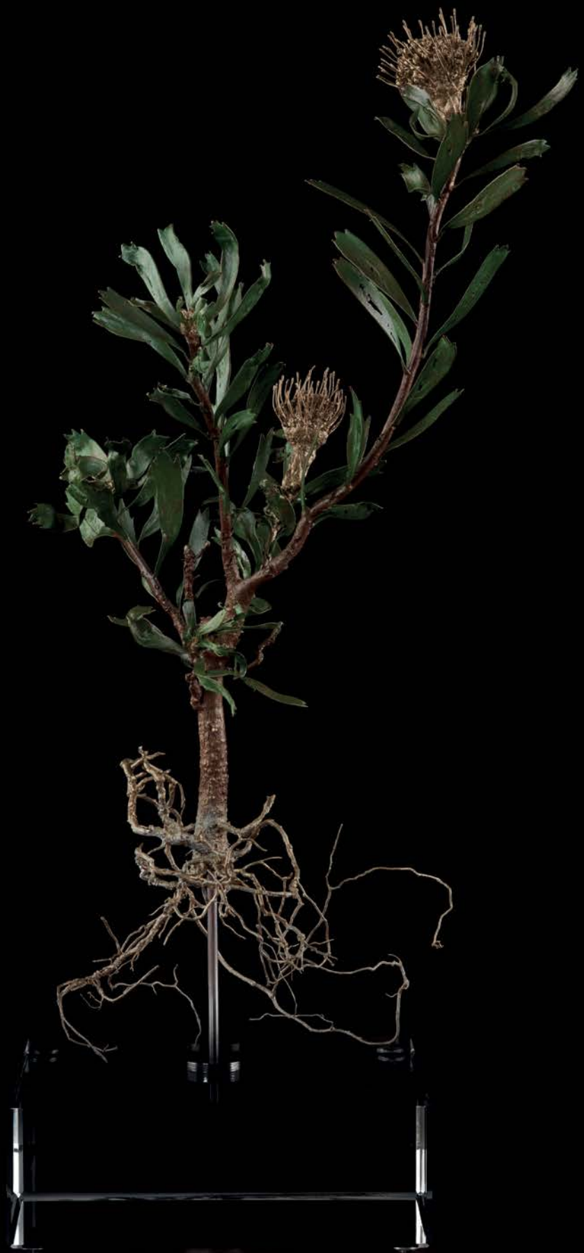
Leucospermum muiirii bronze on crystal base 34 x 16 x 12 cm