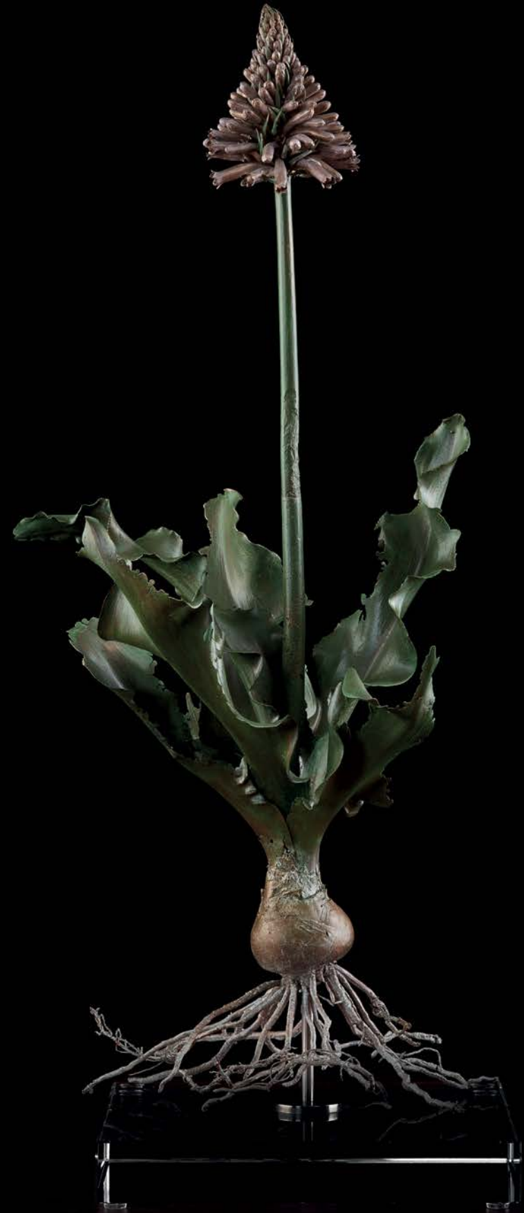
Veltheimia capensis bronze on crystal base 58 x 27 x 26 cm