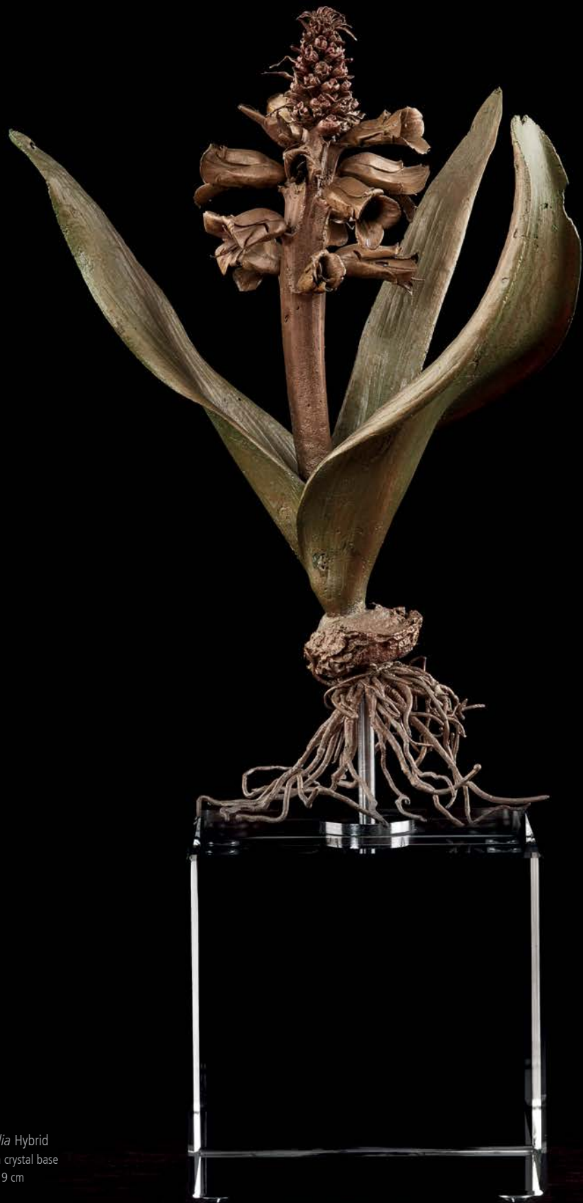
Lachenalia Hybrid bronze on crystal base 27 x 13 x 9 cm