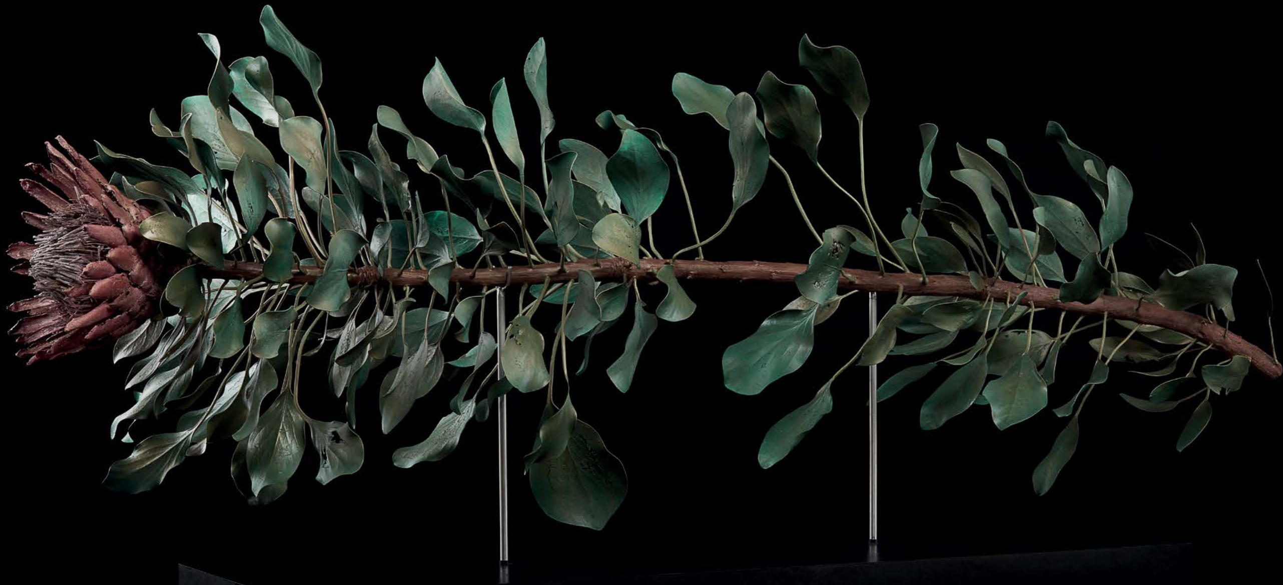
Protea cynaroides bronze on stainless steel base 67 x 55 x 145 cm