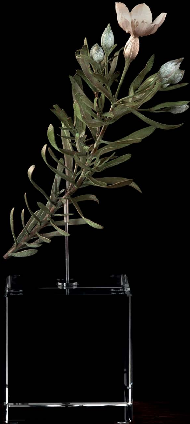
Orphium frutescens bronze and silver on crystal base 25 x 16 x 9 cm