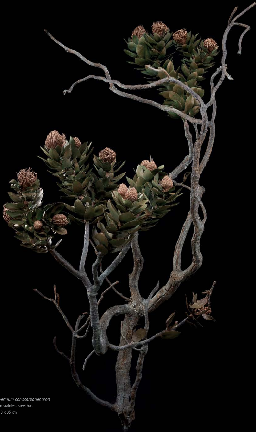
Leucospermum conocarpodendron bronze on stainless steel base 175 x 123 x 85 cm