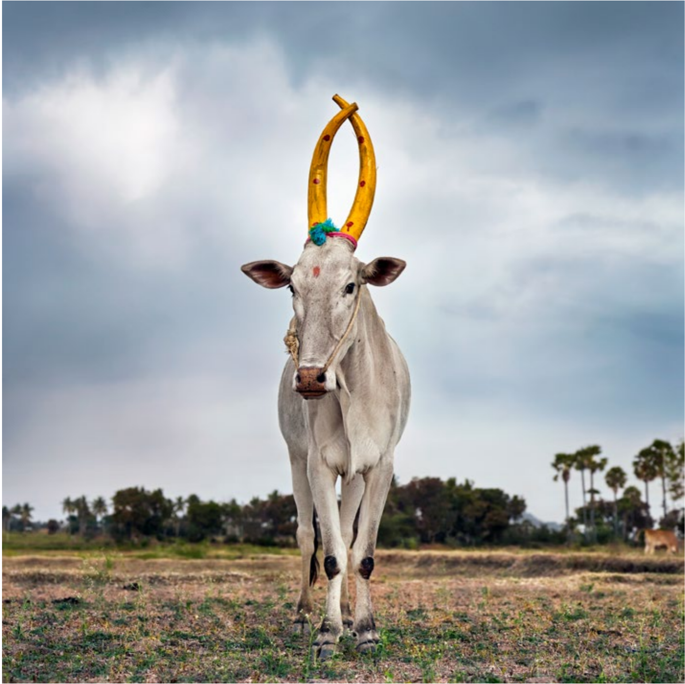
Mattu Pongal 28. Kanakkandal district, Tamil Nadu, India, 2014 (Sightings of the Sacred), 2014 Ed. 6/8 C-Print, Lightjet on Fujifilm professional, Dibonded on aluminium 70 x 70 cm