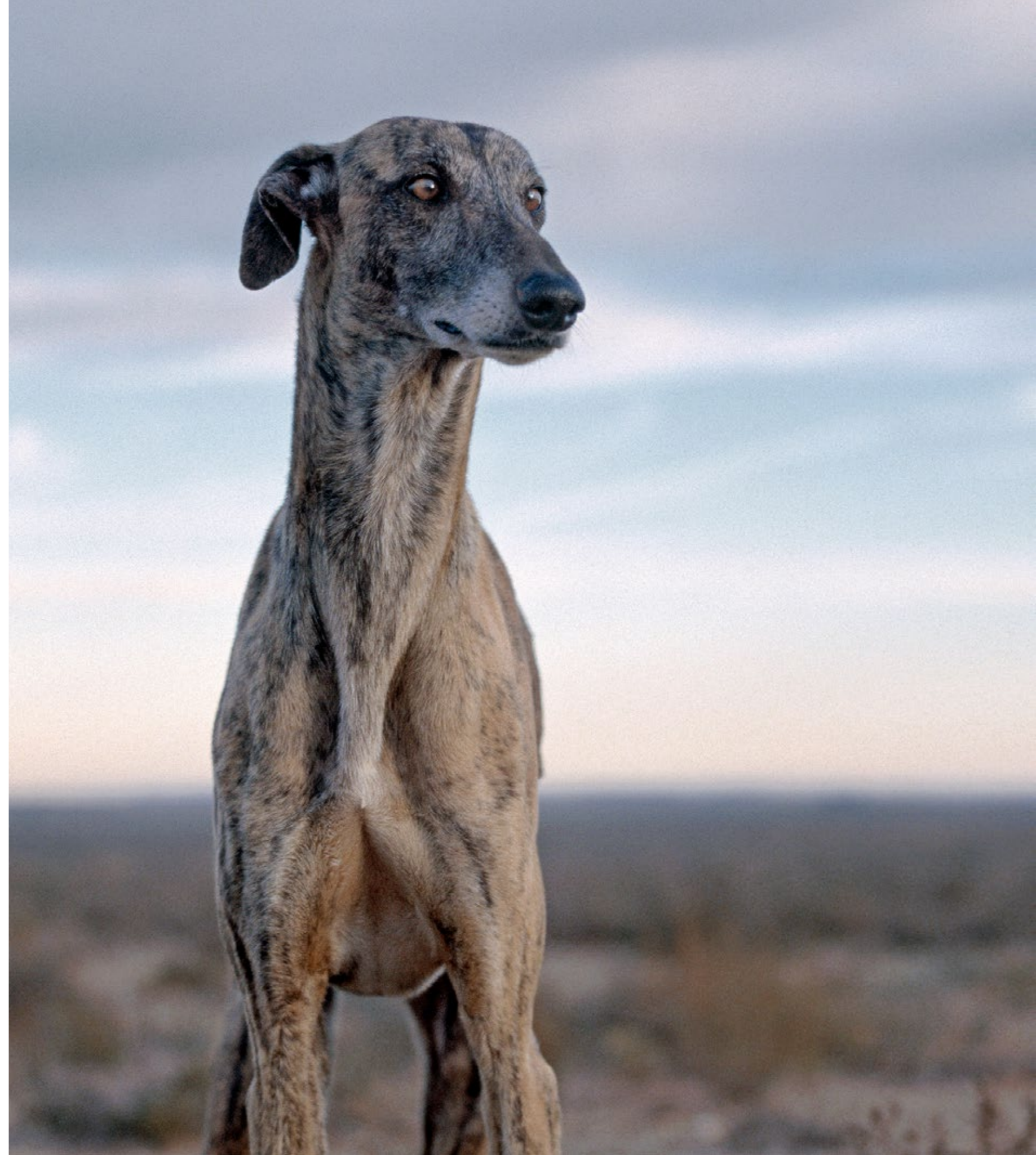
Africanis 3. Strydenburg, 1 April 2008 (Africanis)

Ed. 8/8 C-Print, Lightjet on Fujifilm professional, Dibonded on aluminium 74 x 74 cm