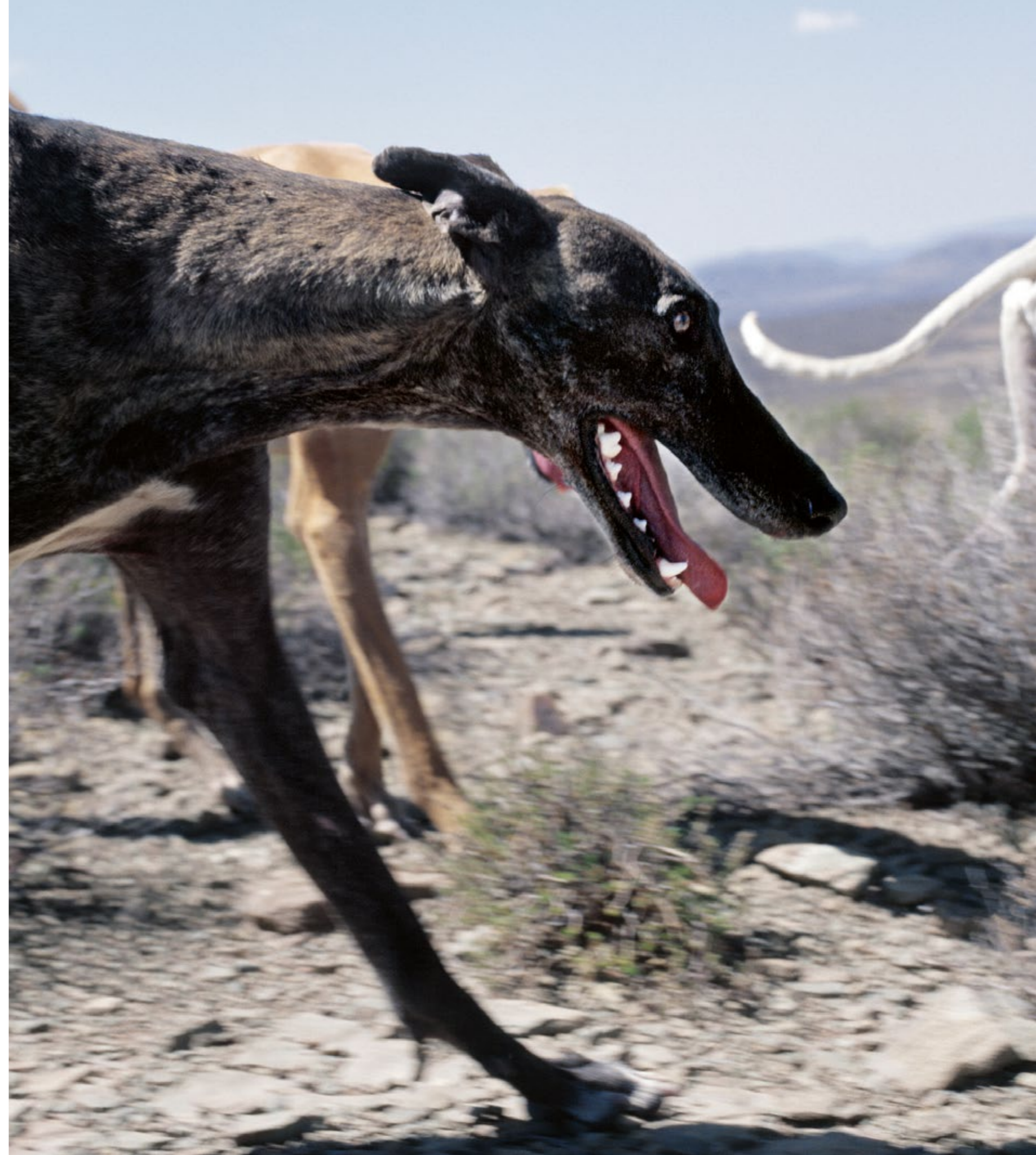
Pack of dogs hunting. Richmond, Northern Cape, 25 January 2009 (Animal Farm), 2007–2012 Ed. 7/8 C-Print, Lightjet on Fujifilm professional, Dibonded on aluminium 74 x 74 cm