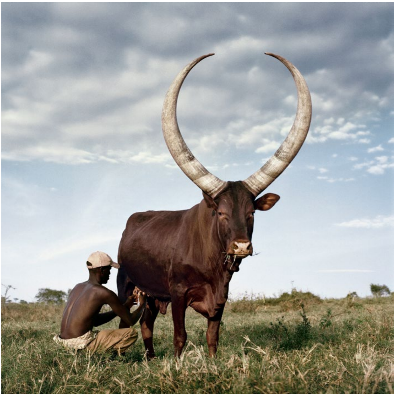
Ankole 3. Outside Mbarara, Kiruhura district, Western Region, Uganda, 2012 (Sightings of the Sacred), 2014 Ed. 2/8 C-Print, Lightjet on Fujifilm professional, Dibonded on aluminium 70 x 70 cm