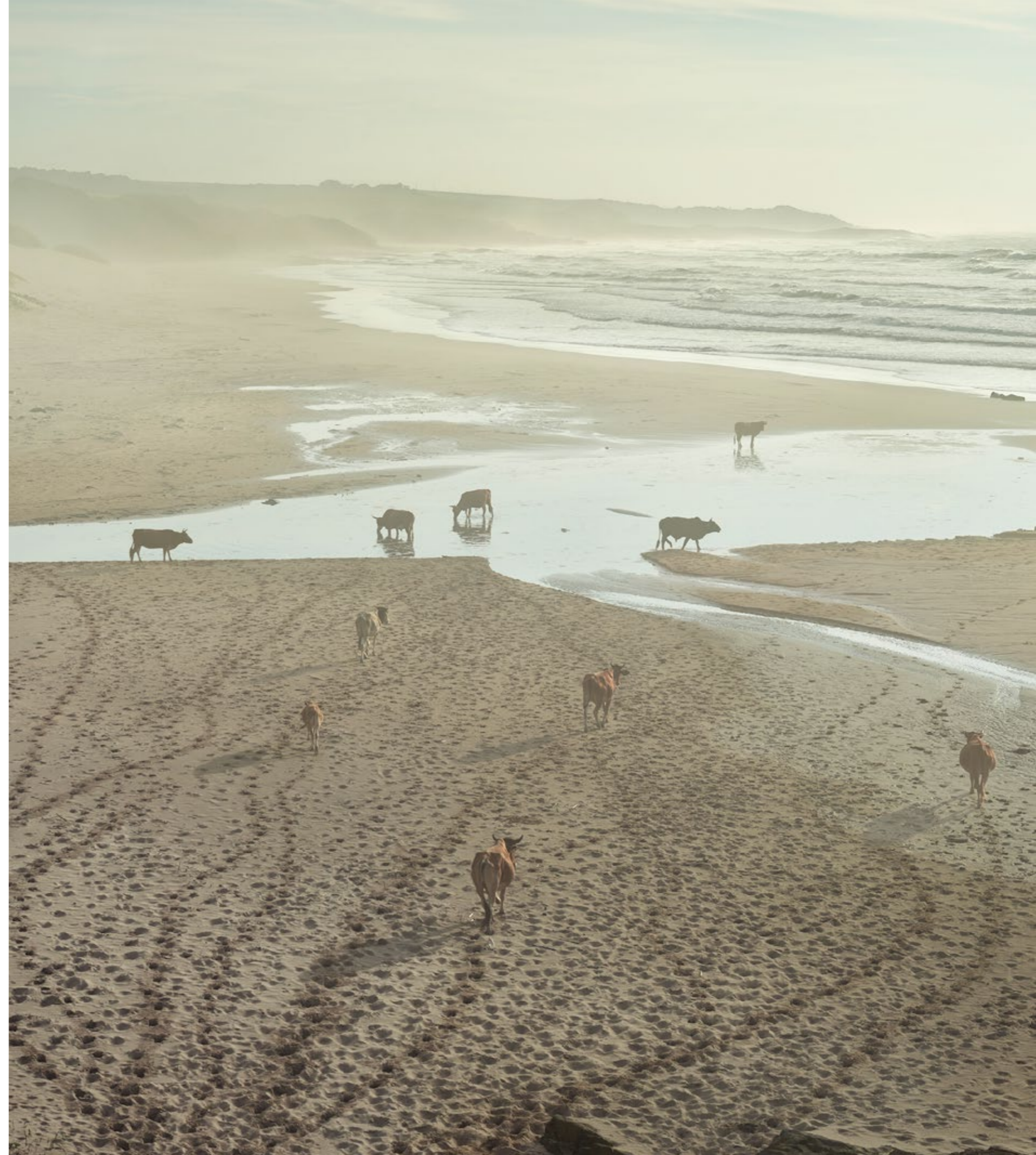
Xhosa cattle at Nebelele river mouth. Eastern Cape, South Africa, 2 April 2018 (Xhosa Cattle on the shore), 2018 Ed. 2/3 C-Print, Lightjet on Kodak professional Endura Premier, Dibonded on aluminium and Diasec 154 x 154 cm