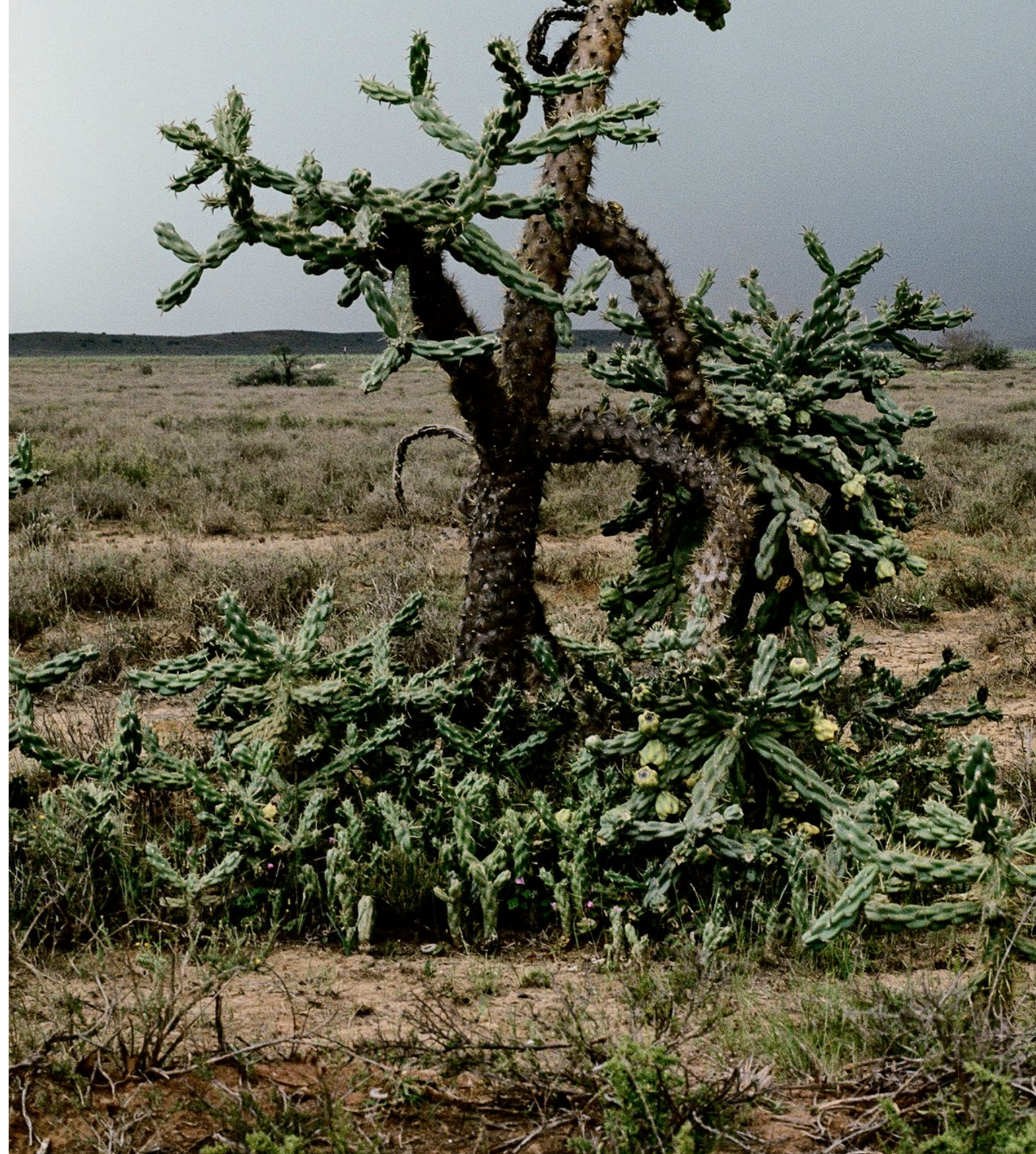
Storm Approaching Aberdeen. Eastern Cape, 3 March 2010 (Animal Farm), 2007–2012 Ed. 5/8 C-Print, Lightjet on Fujifilm professional, Dibonded on aluminium 74 x 74 cm