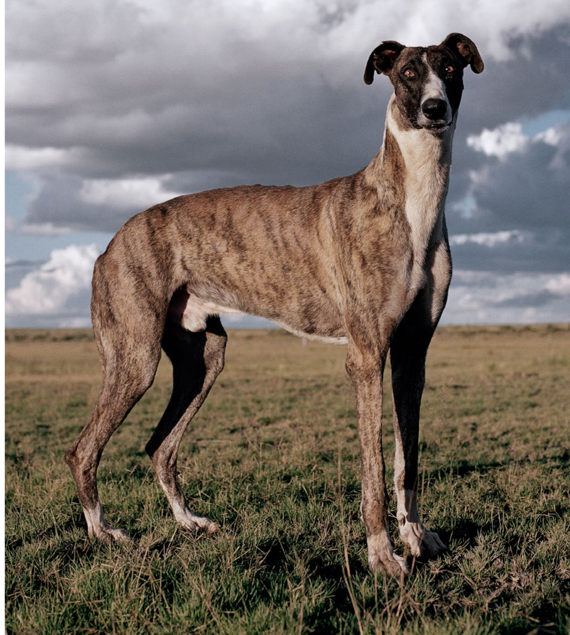
Africanis 17. Danielskuil, Northern Cape, 25 February 2010 (Africanis) Ed. 3/7 C-Print, Lightjet on Fujifilm professional, Dibonded on aluminium 124 x 124 cm