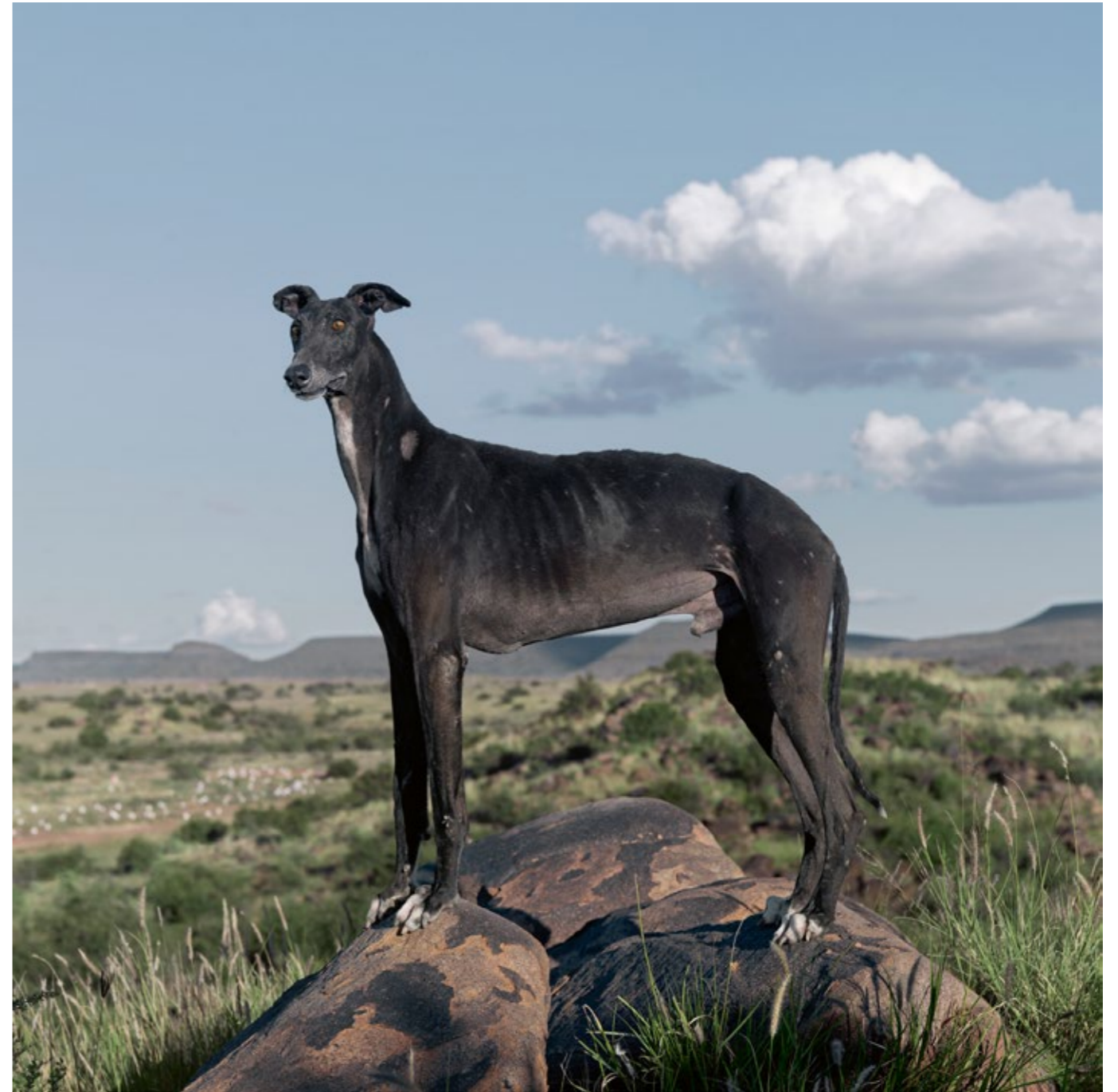
Africanis 20. Petrusville, Northern Cape, 19 April 2011 (Africanis) Ed. 8/8 C-Print, Lightjet on Fujifilm professional, Dibonded on aluminium 74 x 74 cm