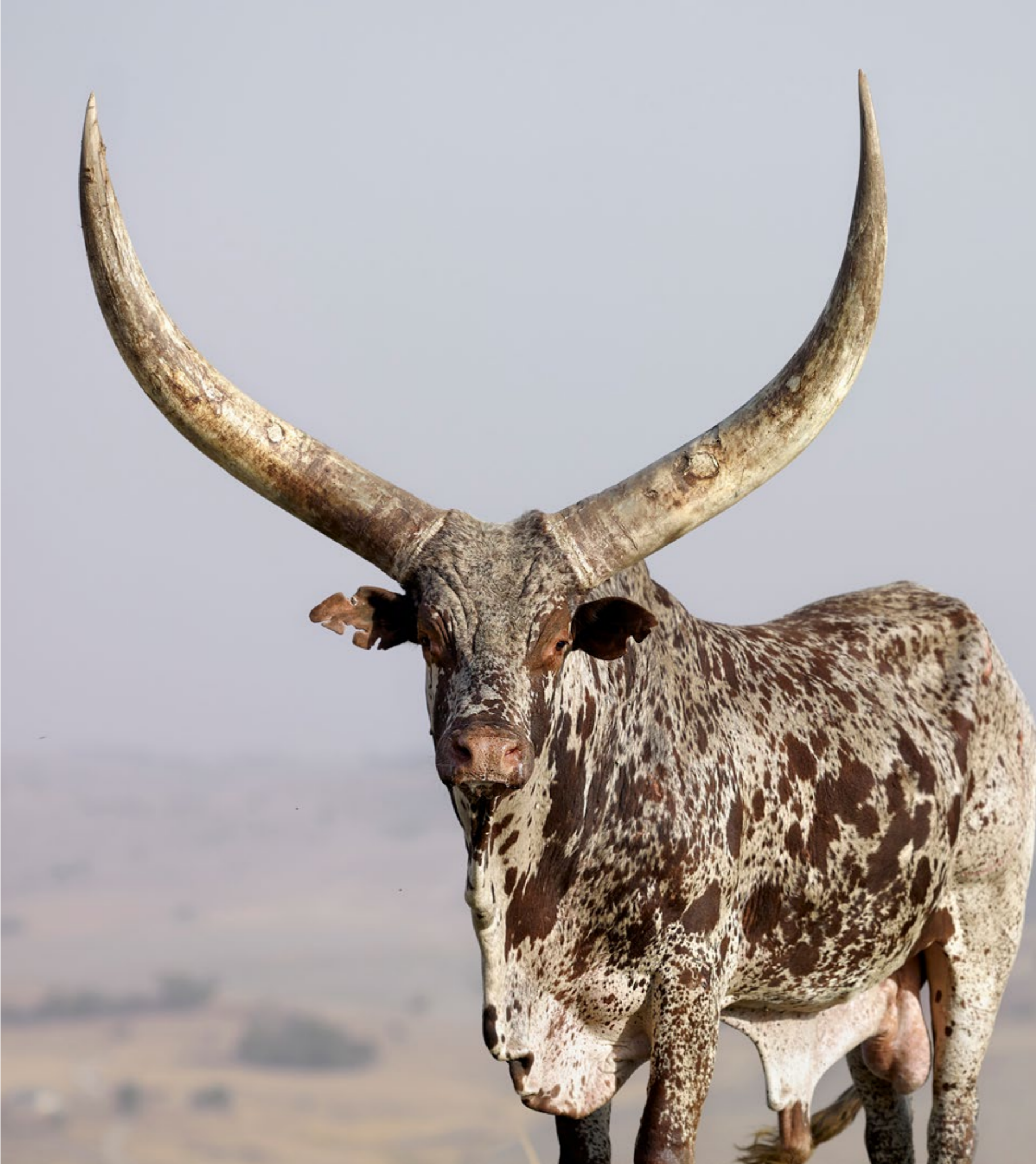
Tshinakaho. South Africa, August 2017 (Cattle of the Ages), 2017 Ed. 6/9 C-Print, Lightjet on Fujifilm professional, Dibonded on aluminium 74 x 89 cm