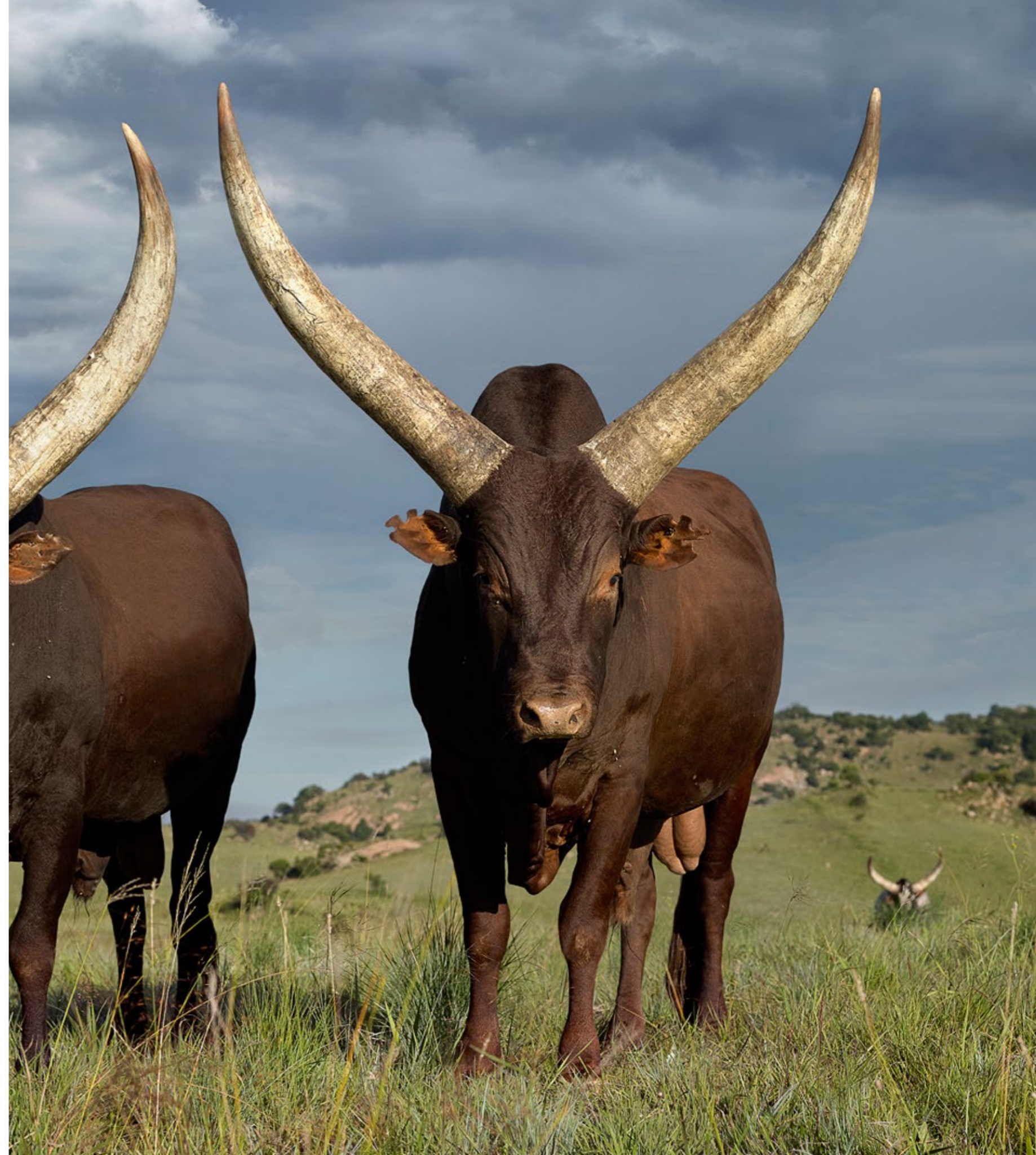
Khosi and Shumani. South Africa, March 2017 (Cattle of the Ages), 2017 Ed. 5/6 C-Print, Lightjet on Fujifilm professional, Dibonded on aluminium 124 x 151 cm