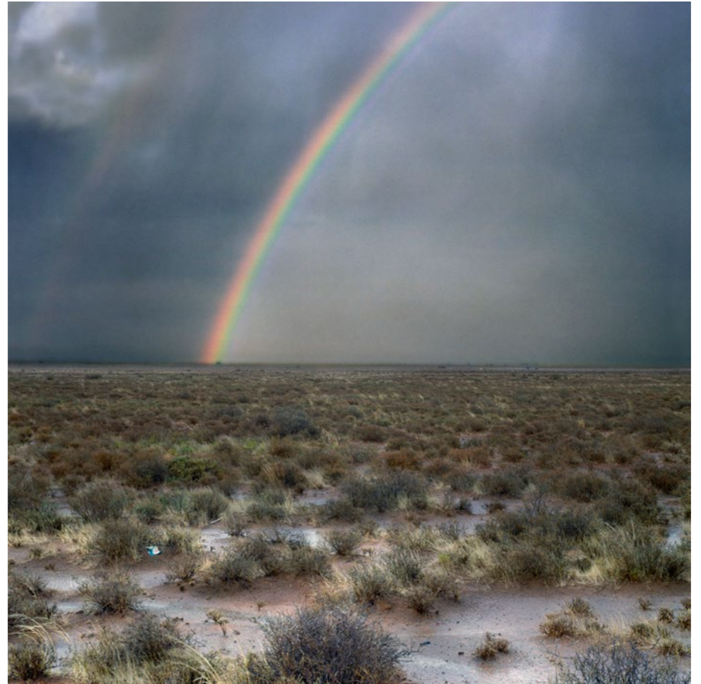
Rainbow. Hanover, Northern Cape, 2 November 2009 (African Scenery and Animals), 2009 Ed. 8/8 C-Print, Lightjet on Fujifilm professional, Dibonded on aluminium 74 x 74 cm