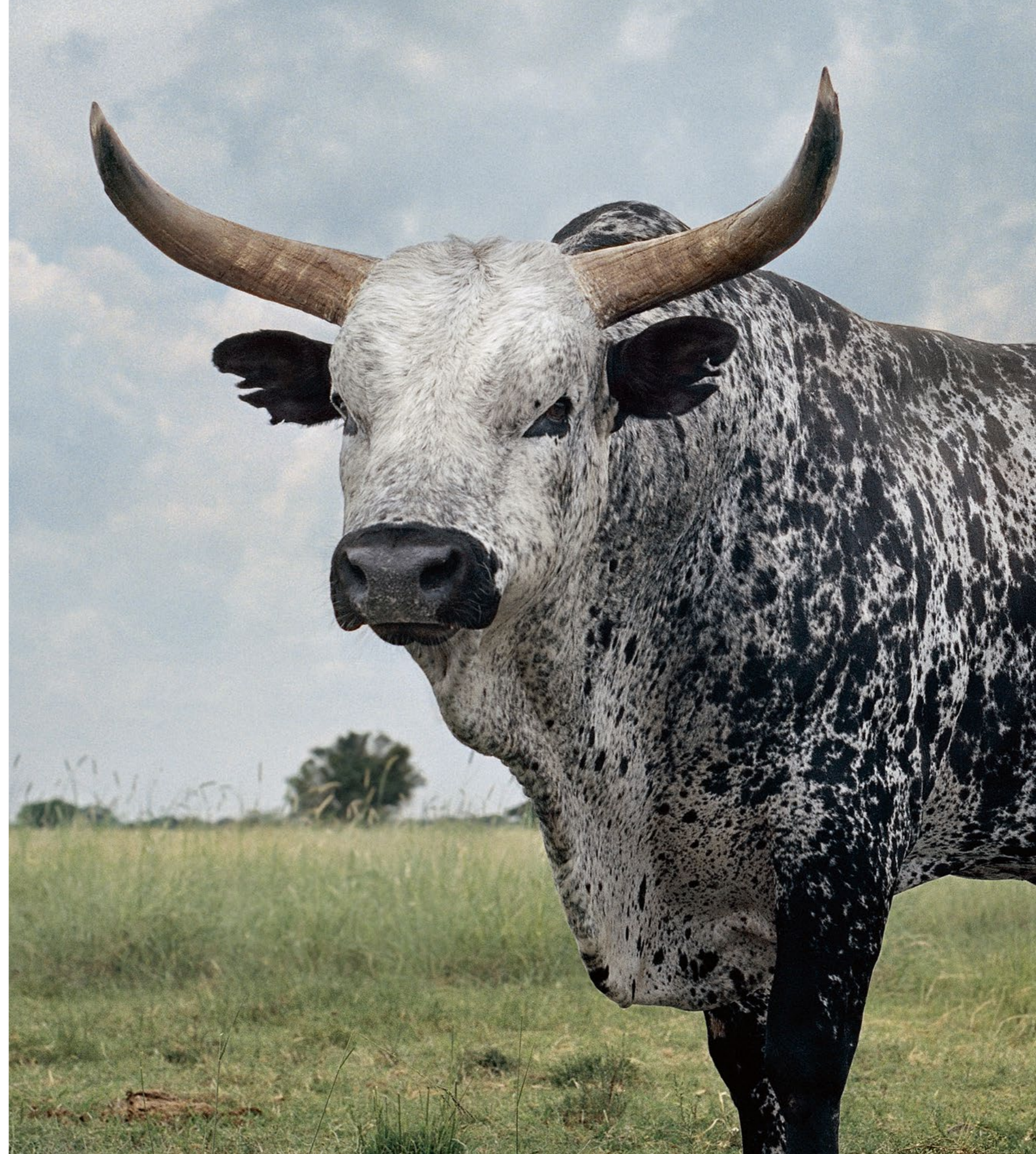
Black and white Nguni bull. Stella, North West Province, 1 March 2010 (Animal Farm), 2007–2012 Ed. 8/8 C-Print, Lightjet on Fujifilm professional, Dibonded on aluminium 74 x 74 cm