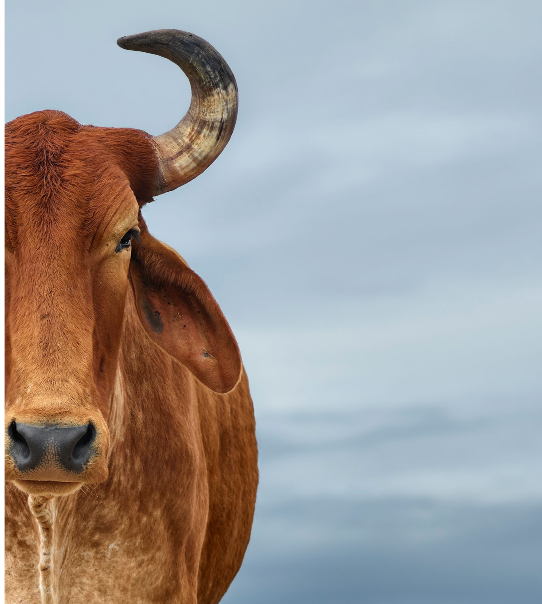
Xhosa bull on the shore, Eastern Cape, South Africa, 12 April 2018 (Xhosa Cattle on the shore), 2018 Ed. 2/3 C-Print, Lightjet on Kodak professional Endura Premier, Dibonded on aluminium and Diasec 154 x 154 cm