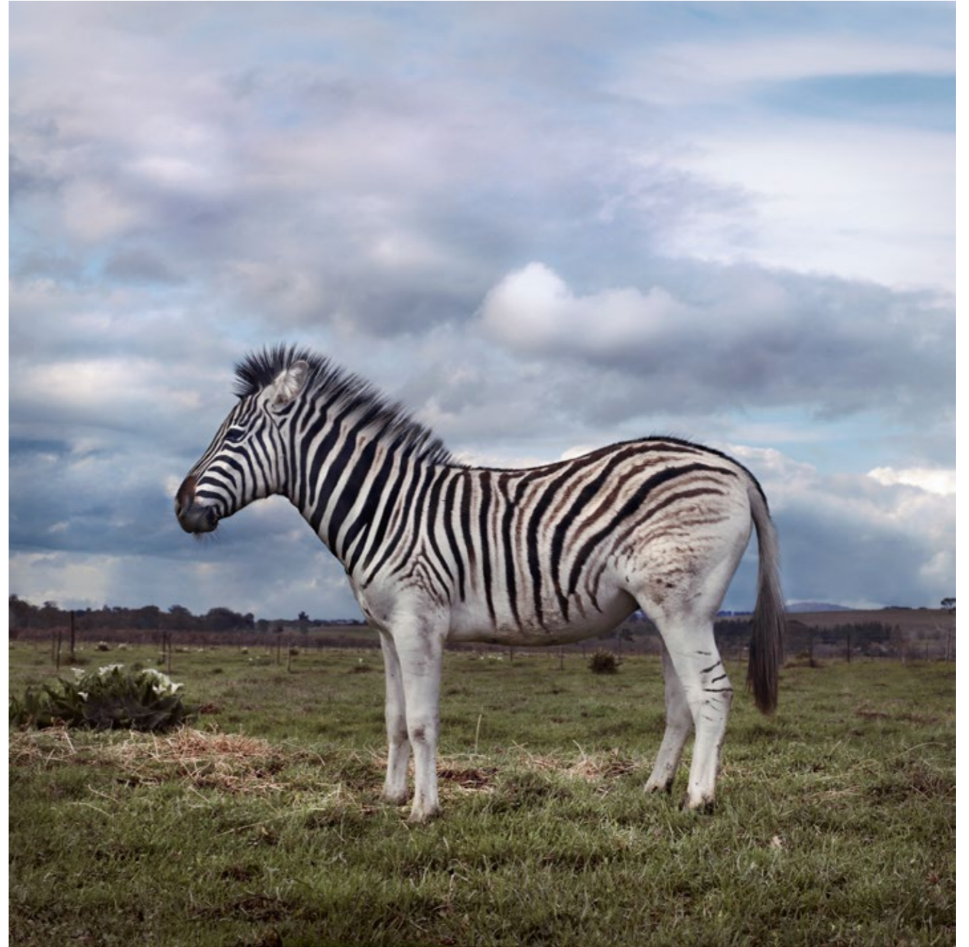
Quagga. Elsenburg, Stellenbosch, Western Cape, 30 August 2010 (Animal Farm), 2007–2012 Ed. 6/8 C-Print, Lightjet on Fujifilm professional, Dibonded on aluminium 74 x 74 cm