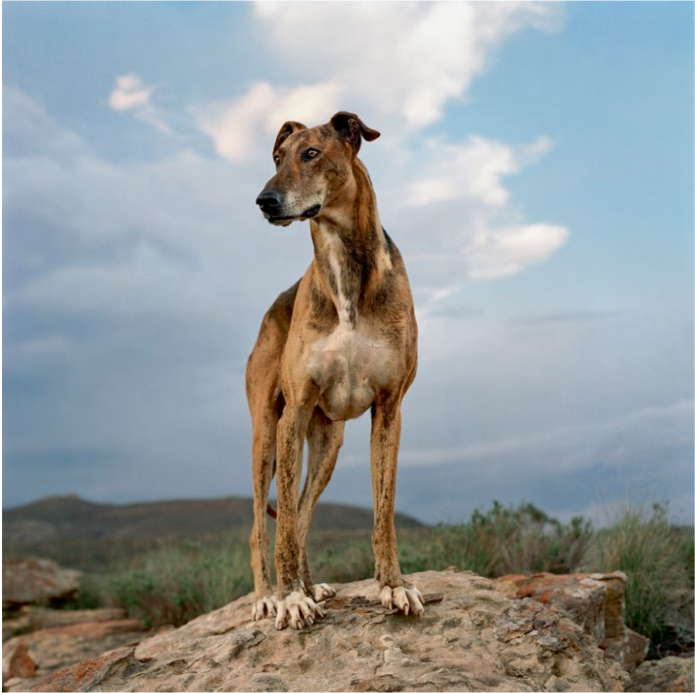
Africanis 23. Richmond, Northern Cape, 28 January 2009 (Africanis) Ed. 7/7 C-Print, Lightjet on Fujifilm professional, Dibonded on aluminium 124 x 124 cm