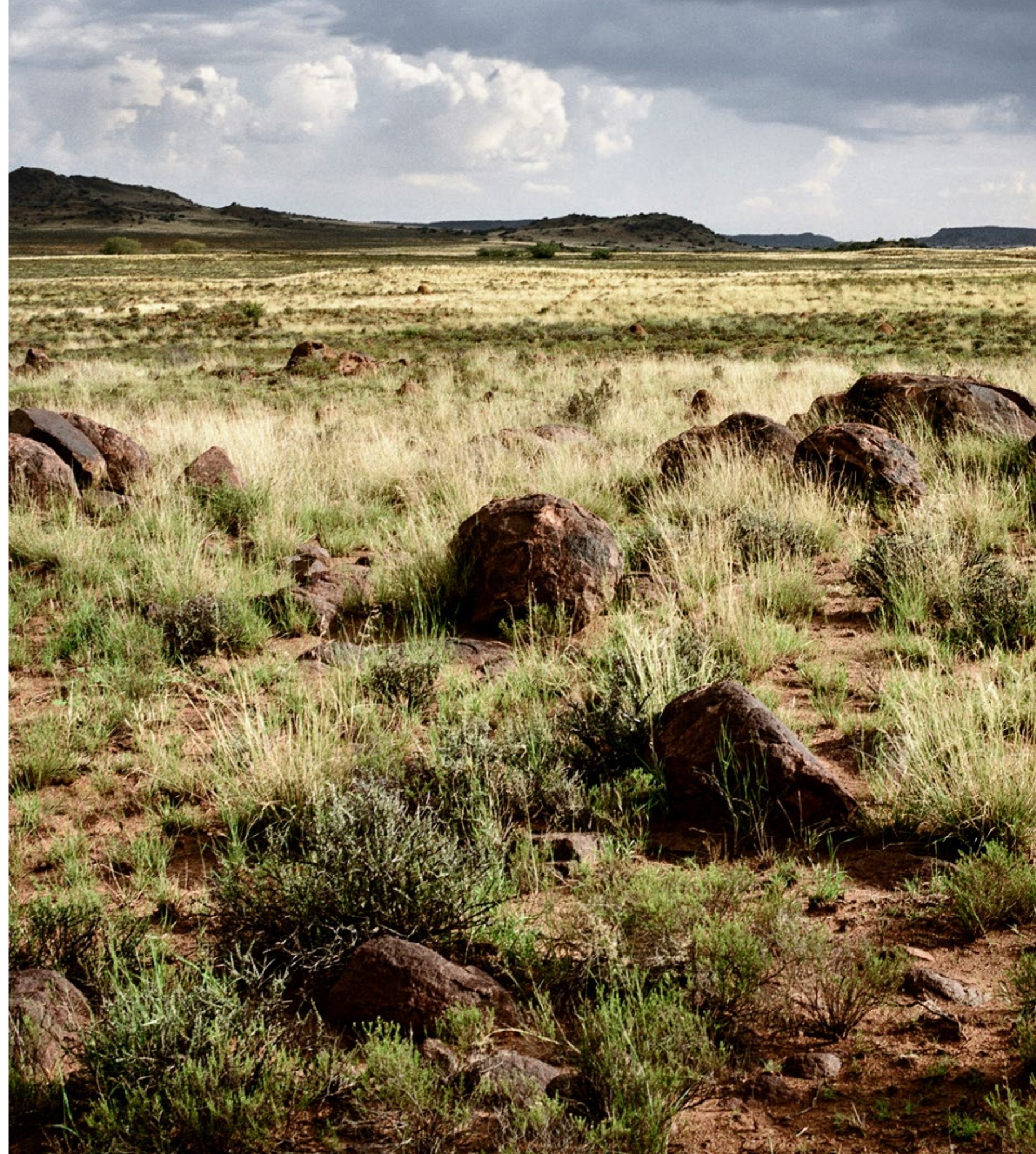
Farm between Aberdeen and Willowmore. Eastern Cape, 7 March 2010 (Animal Farm), 2007–2012 Ed. 6/8 C-Print, Lightjet on Fujifilm professional, Dibonded on aluminium 74 x 74 cm