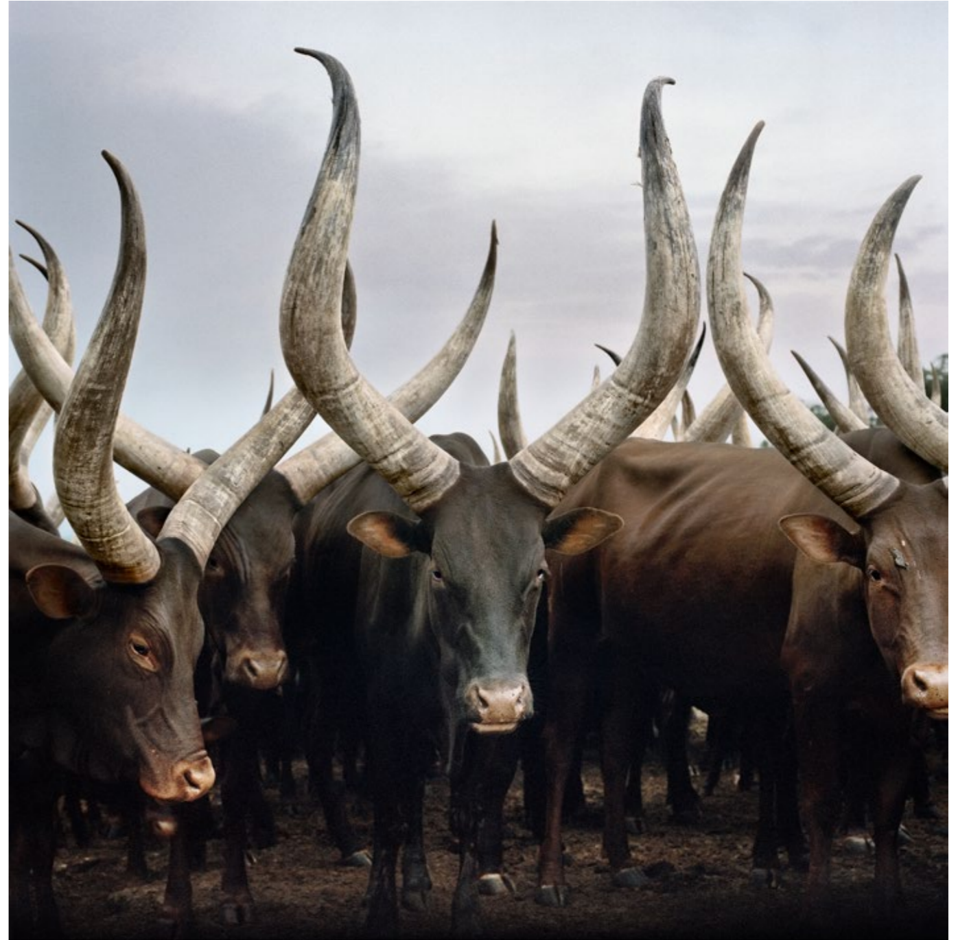
Group of Ankole cattle. Kiruhura district, Western Region, Uganda, 2012 (Sightings of the Sacred), 2014 Ed of 2 C-Print, Lightjet on Kodak professional Endura Premier Diasec dibonded 138 x 138 cm