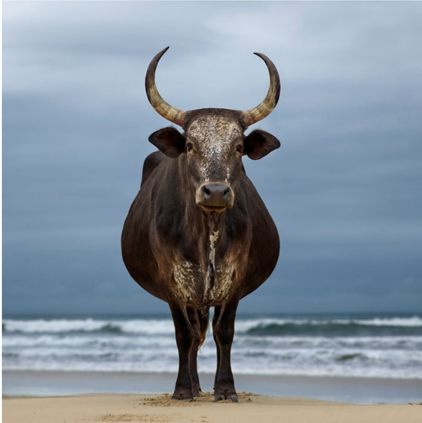
Xhosa black cow on the shore. Eastern Cape, South Africa, 6 April 2018 (Xhosa Cattle on the shore), 2018 Ed. 3/5 C-Print, Lightjet on Kodak professional Endura Premier, Dibonded on aluminium and Diassec 124 x 124 cm