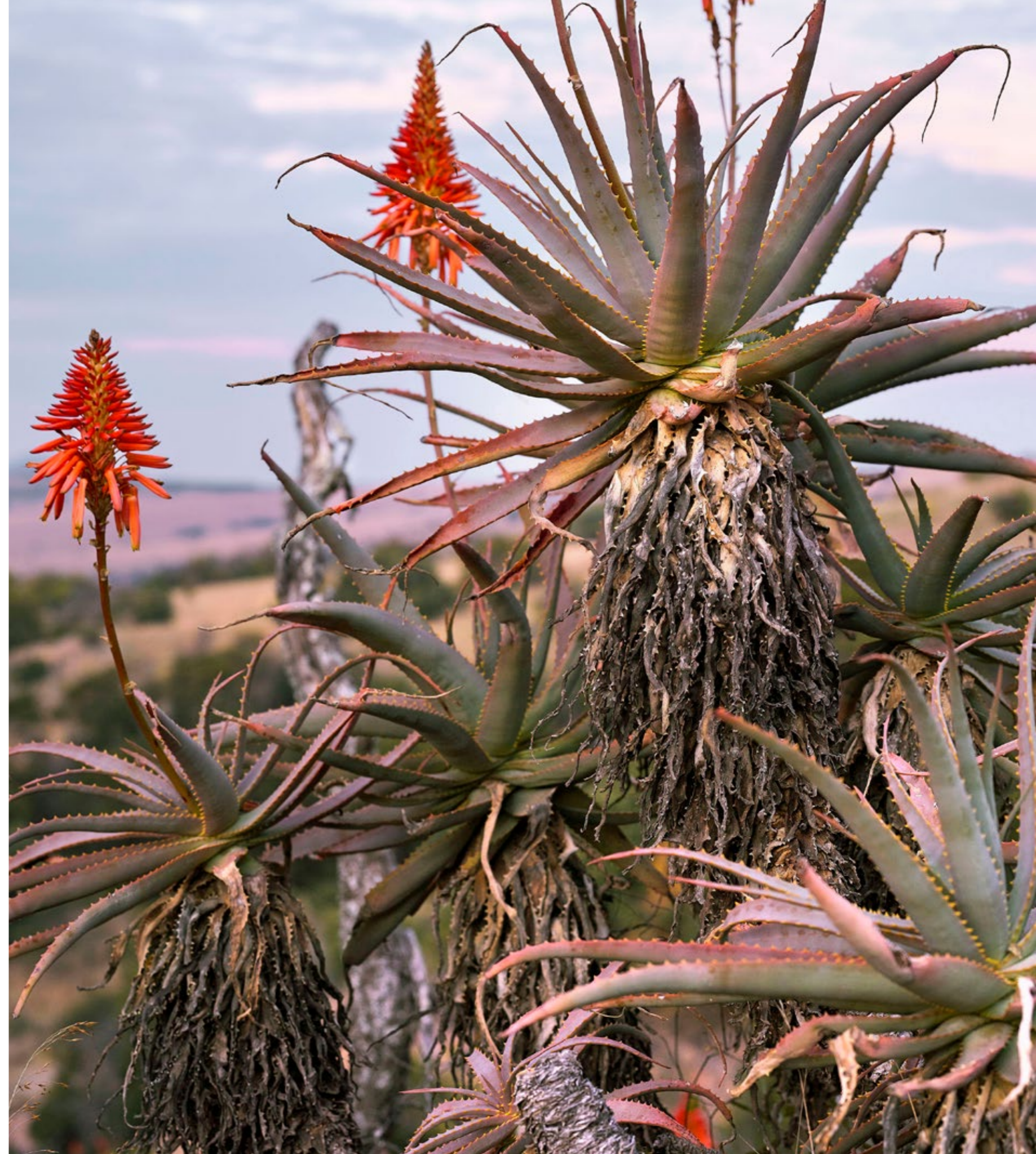
Flowering Krantz Aloe. South Africa, June 2017 (Cattle of the Ages), 2017 Ed. 4/6 C-Print, Lightjet on Fujifilm professional, Dibonded on aluminium 124 x 124 cm