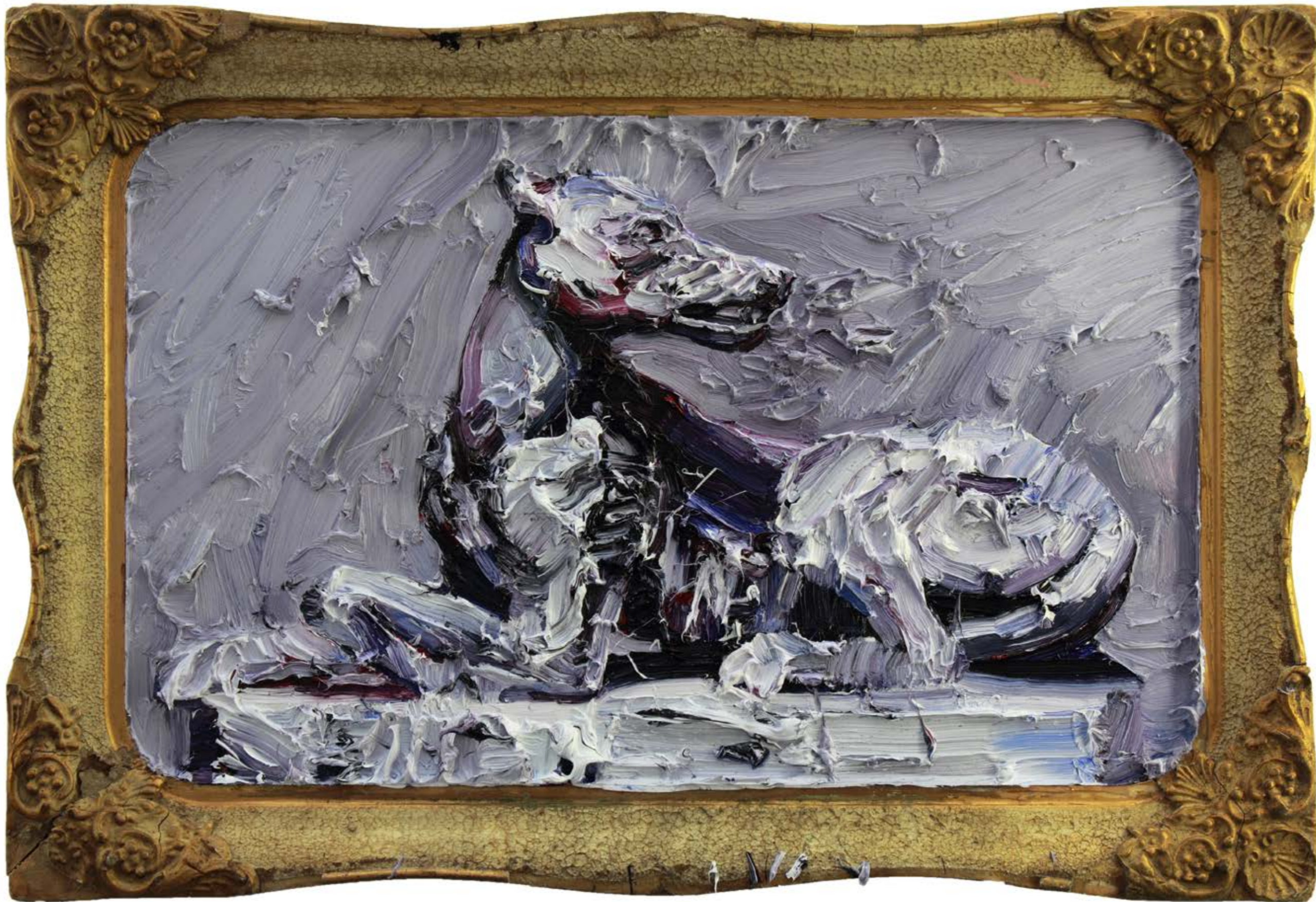
Dog from the Roman Empire, c 1st Century BC oil on supawood and frame 45 x 64 cm