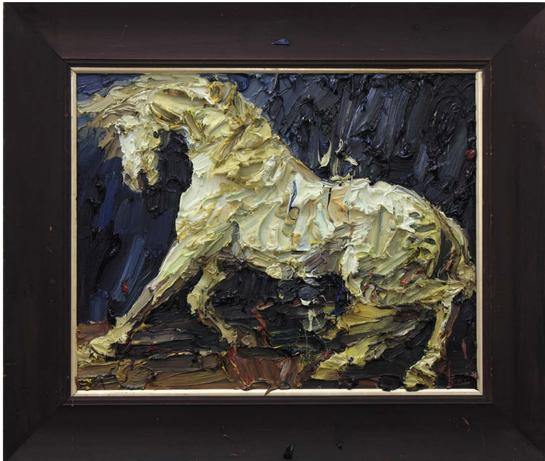
Horse Frightened by a Lion, after, George Stubbs, 1770 oil on supawood and frame 53 x 63 cm