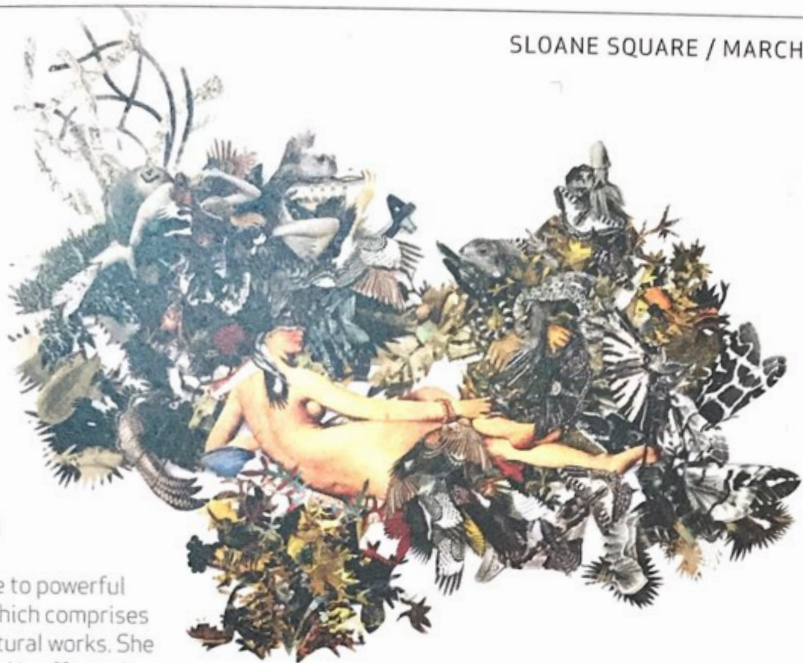
FLIGHTS OF FANCY BY BARBARA WILDENBOER