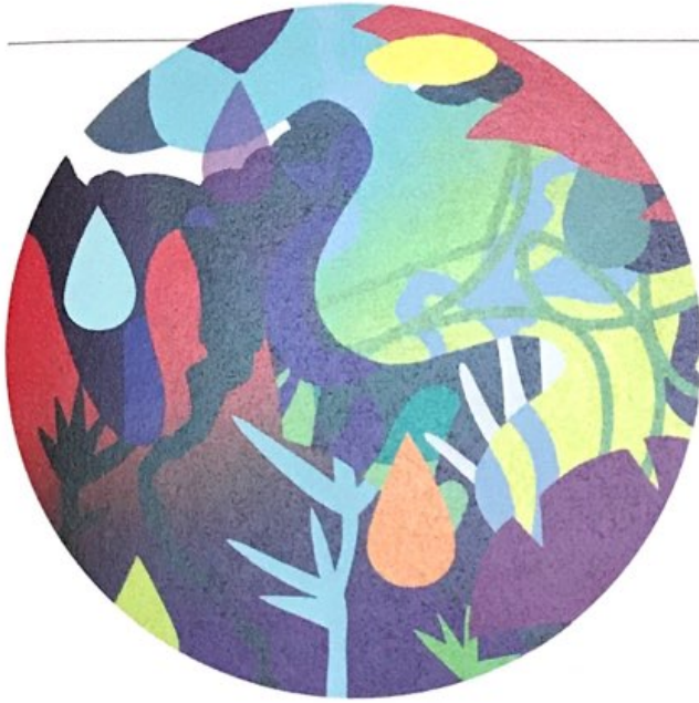
TOXIC PLUMES BY NEILL WRIGHT