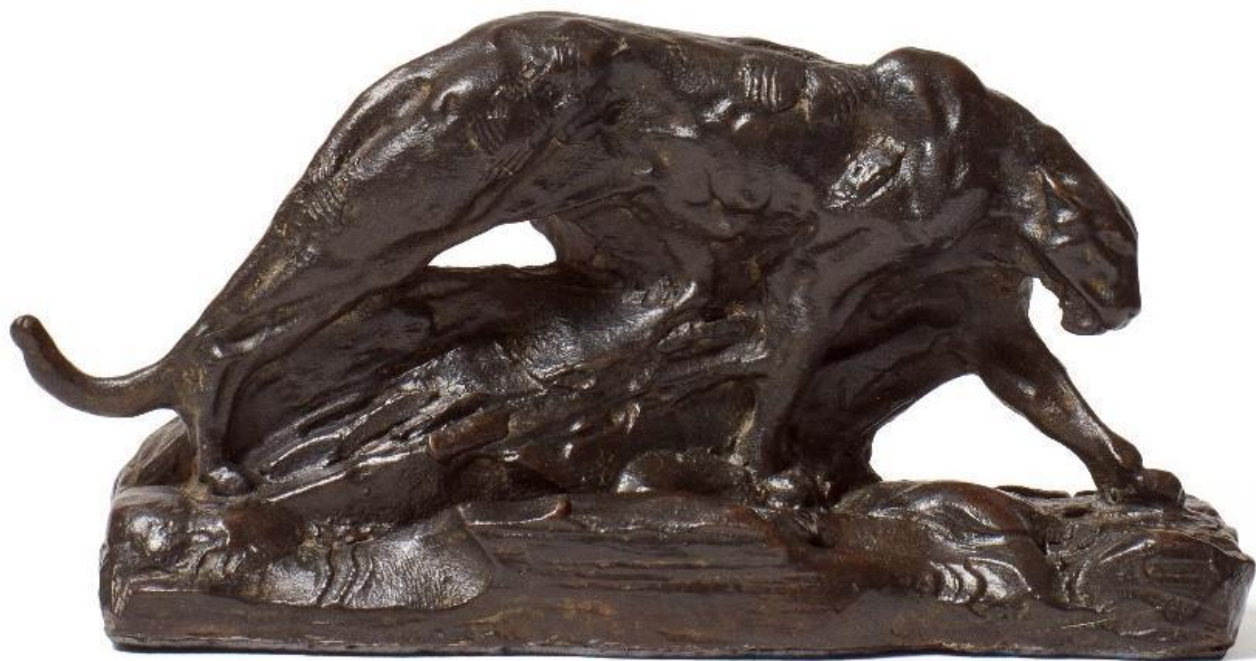
WALKING LEOPARD MINIATURE (S391) BRONZE, EDITION OF 100 9,5 x 6 x 19 cm