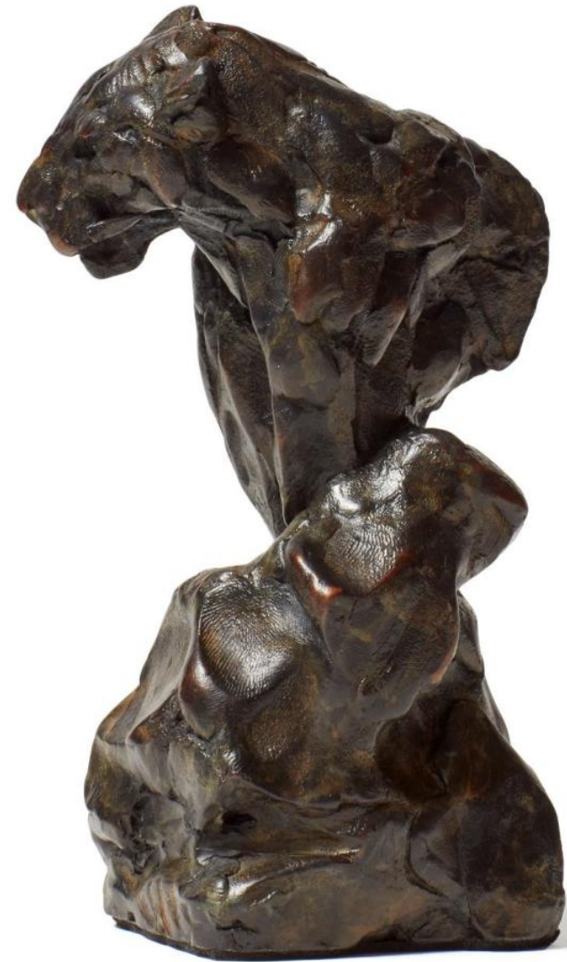
LEOPARD BUST MINIATURE (S403) BRONZE, EDITION OF 100 16 x 7 x 9 cm