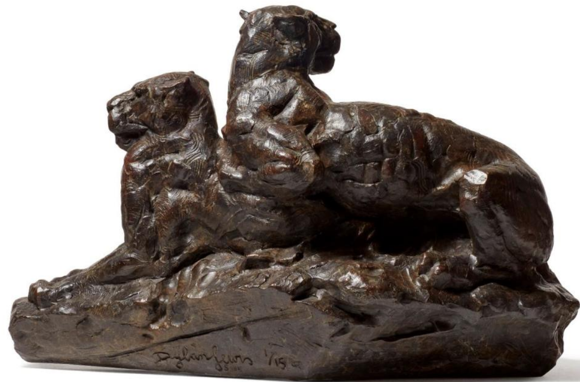
LEFT DETAIL AND ABOVE LYING LEOPARD PAIR II MAQUETTE (S383) BRONZE, EDITION OF 15 43 x 48 x 68 cm