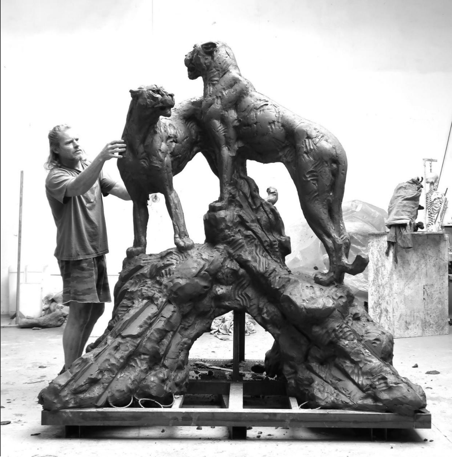
PREVIOUS PAGE DETAIL AND LEFT IMAGE OF SCULPTURE IN CLAY - STILL TO BE CAST LEOPARD PAIR III (S388) BRONZE, EDITION OF 12 215 x 200 x 140 cm