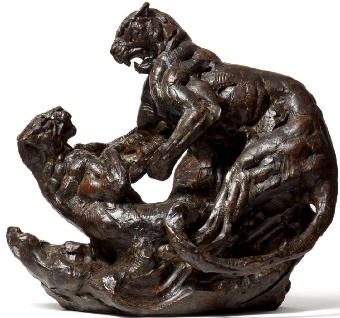
LEFT DETAIL AND BELOW FIGHTING LEOPARD PAIR III MAQUETTE (S382) BRONZE, EDITION OF 15 60 x 52 x 60,5 cm