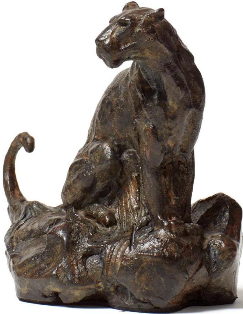
SITTING LEOPARD MINIATURE (S412) BRONZE, EDITION OF 100 12 x 10 x 13 cm