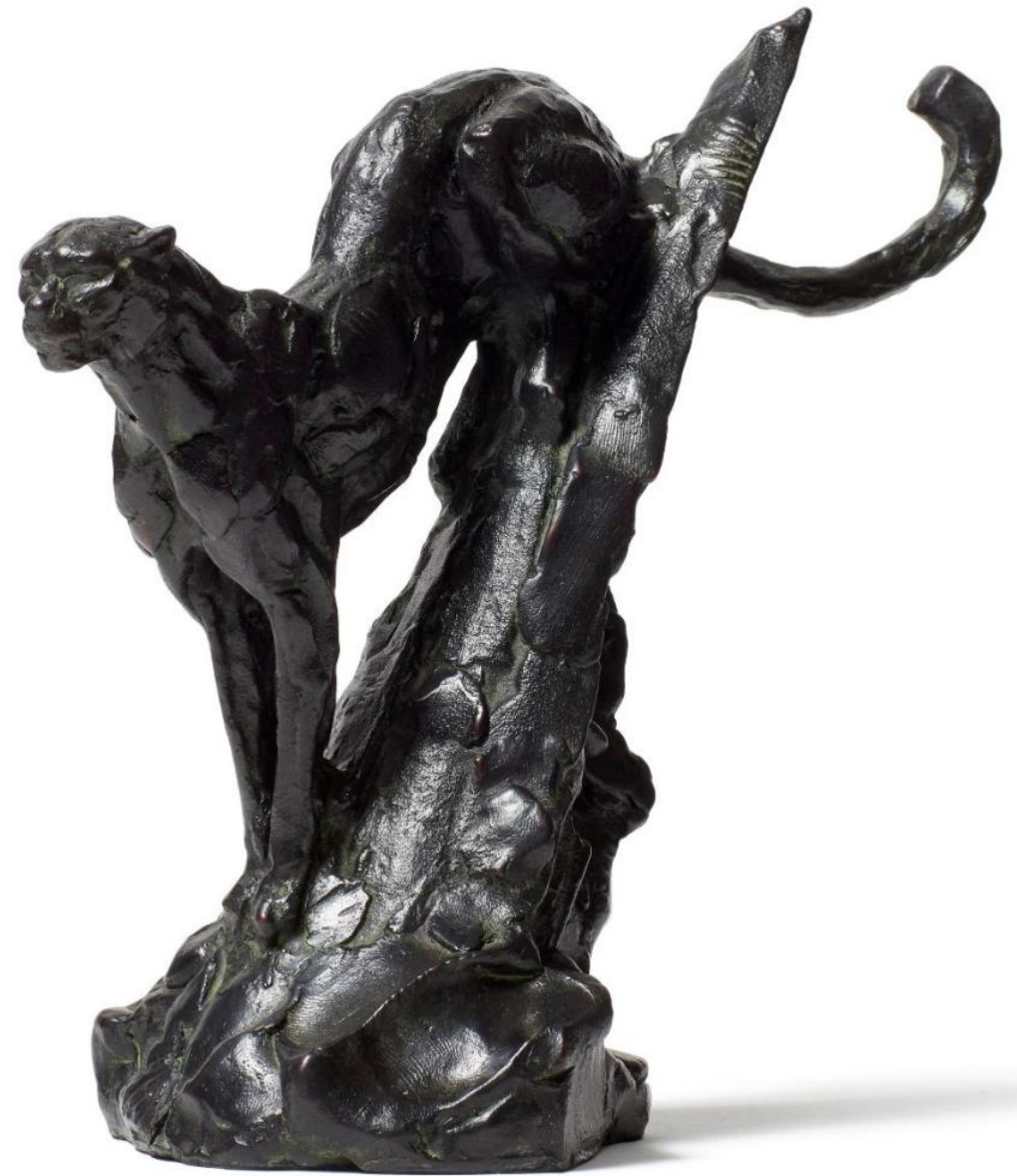
SURVEYING CHEETAH II MINIATURE (S399) BRONZE, EDITION OF 100 20 x 11 x 24 cm