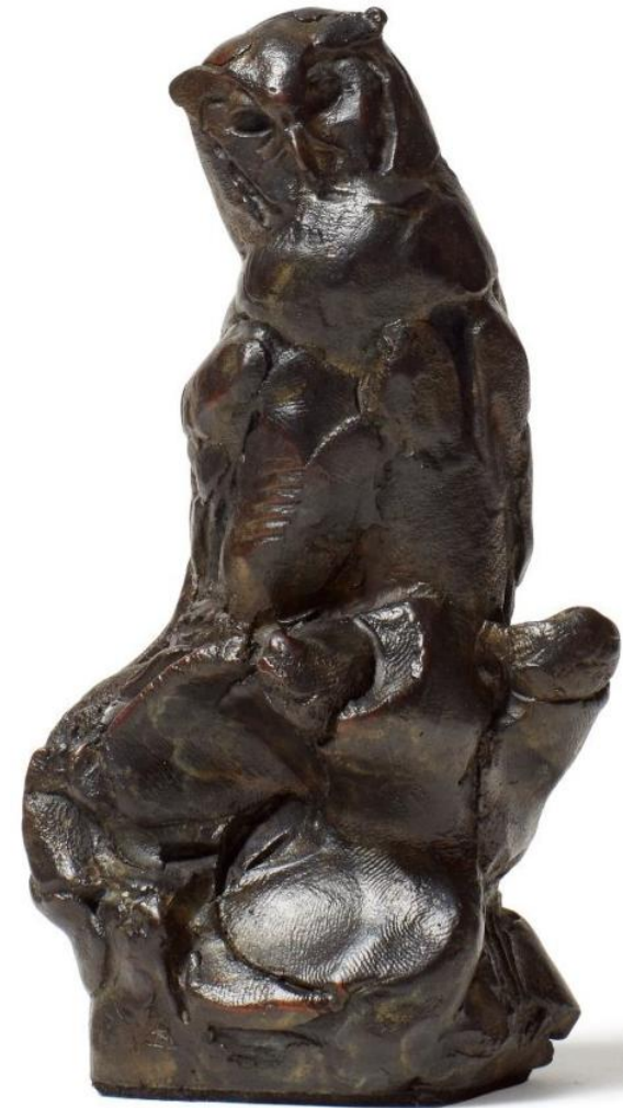
VERREAUX'S EAGLE OWL MINIATURE (S407) BRONZE, EDITION OF 100 15 x 8 x 8 cm