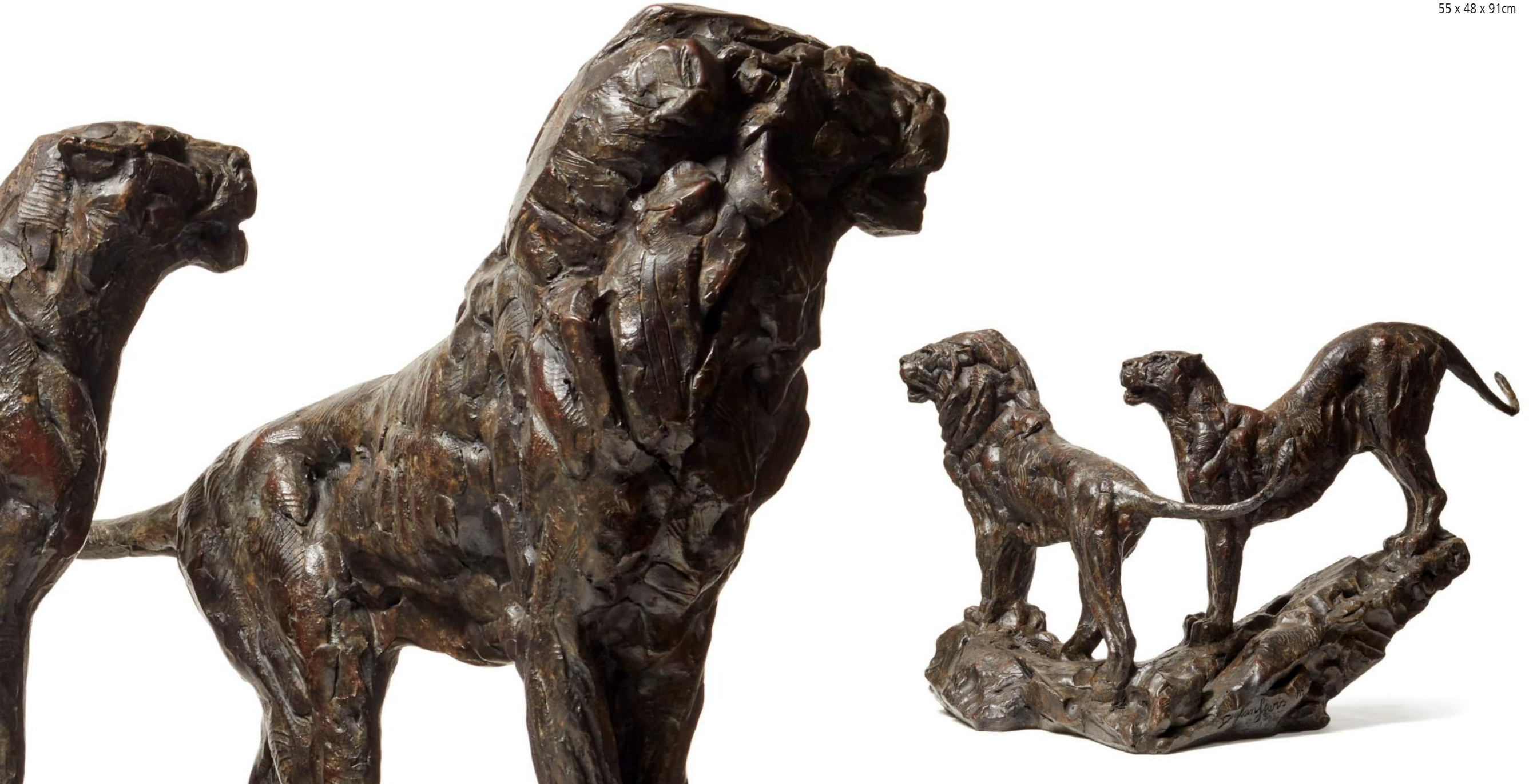
LEFT DETAIL AND BELOW LION AND LIONESS PAIR MAQUETTE I (S381) BRONZE, EDITION OF 15 55 x 48 x 91cm