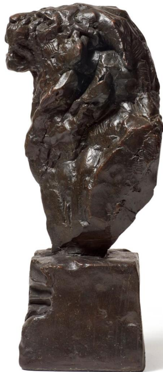
LEFT DETAIL AND RIGHT LION HEAD III MAQUETTE (S384) BRONZE, EDITION OF 15 44 x 15,5 x 20 cm