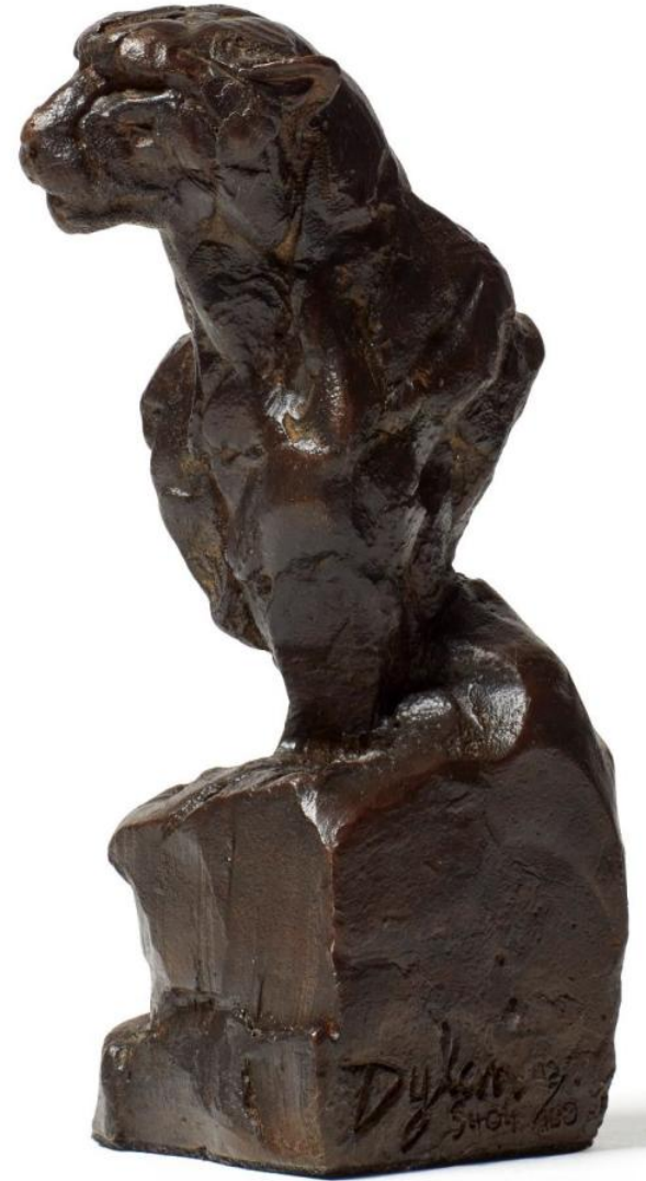
CHEETAH BUST MINIATURE (S404) BRONZE, EDITION OF 100 15 x 6 x 4,5cm