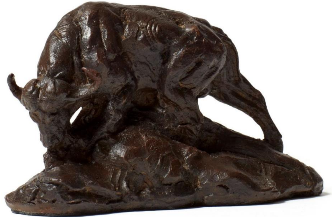
CHARGING BUFFALO MINIATURE (S405) BRONZE, EDITION OF 100 11 x 6 x 17 cm