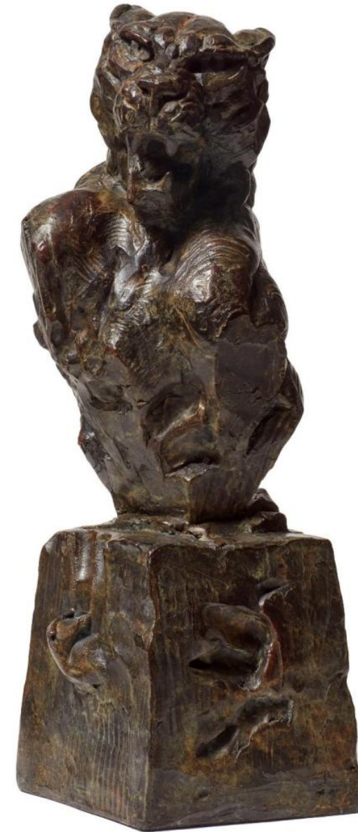
LEFT DETAIL AND BELOW FIGHTING LEOPARD BUST I (S387) BRONZE, EDITION OF 15 47 x 26 x 21 cm