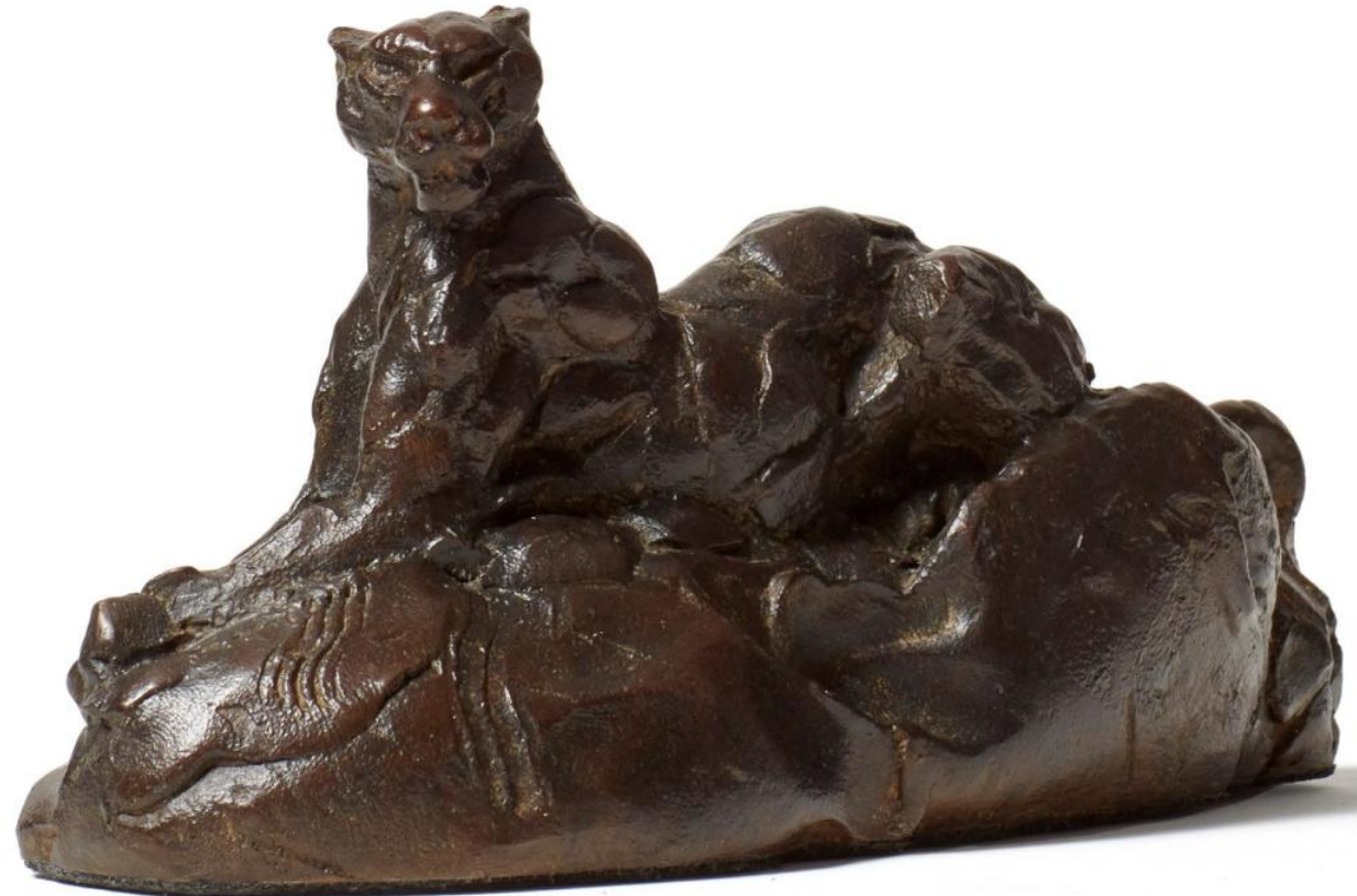
SURVEYING LEOPARD II MINIATURE (S408) BRONZE, EDITION OF 100 10 x 6 x 20 cm