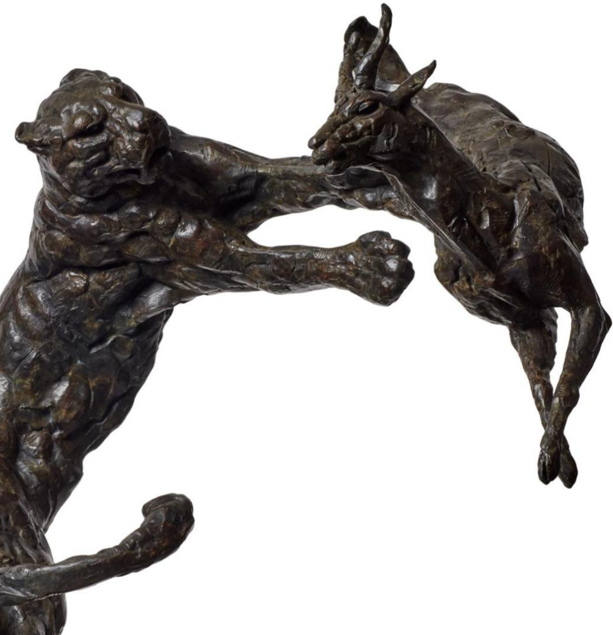
LEFT DETAIL AND BELOW LEOPARD CHASING BUSHBUCK MAQUETTE I (S379) BRONZE, EDITION OF 15 114 x 70 x 100 cm