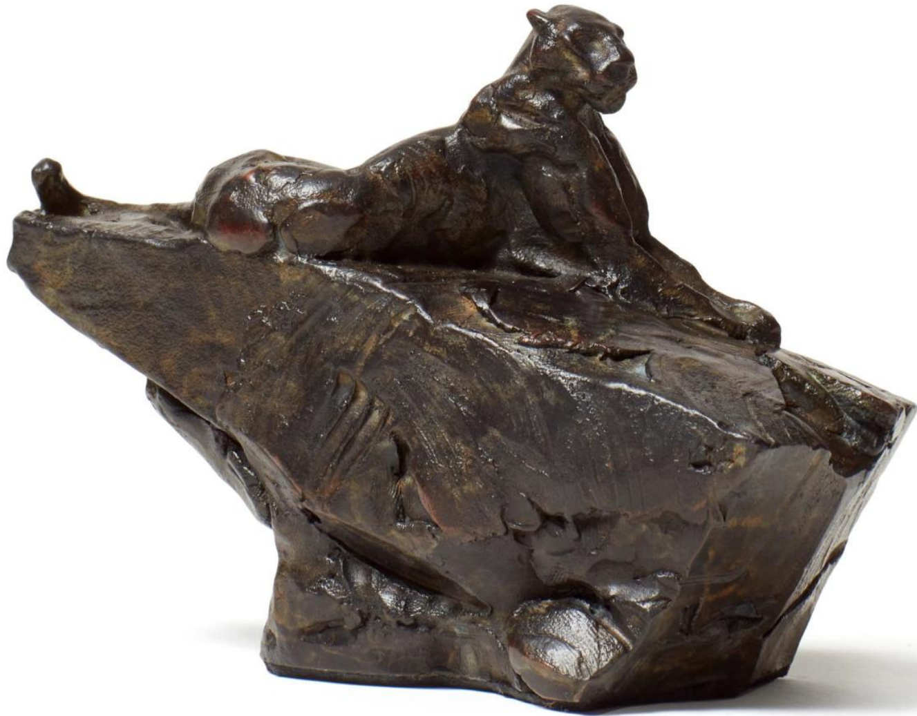
ELEVATED LEOPARD I MINIATURE (S401) BRONZE, EDITION OF 100 10 x 7 x 15 cm