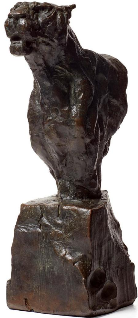
LEFT DETAIL AND RIGHT LIONESS BUST III MAQUETTE (S385) BRONZE, EDITION OF 15 42 x 14 x 22,5 cm