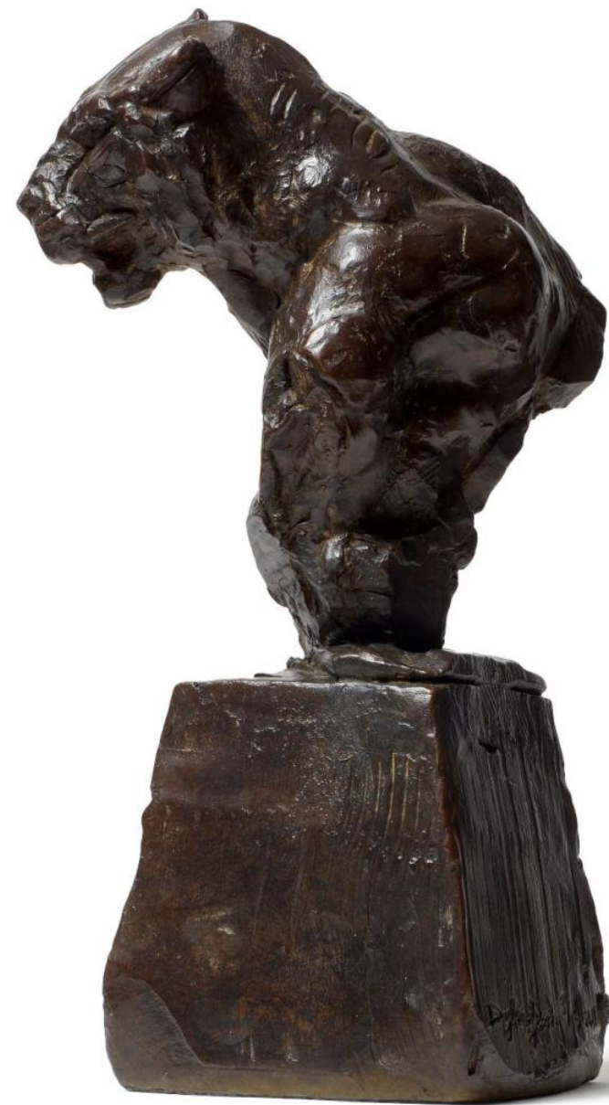
LEFT DETAIL AND RIGHT FIGHTING LEOPARD BUST II (S411) BRONZE, EDITION OF 15 39 x 16 x 19 cm