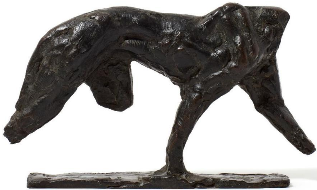
STRIDING FRAGMENT I MINIATURE (S377) BRONZE, EDITION OF 100 14 x 5 x 23.5 cm