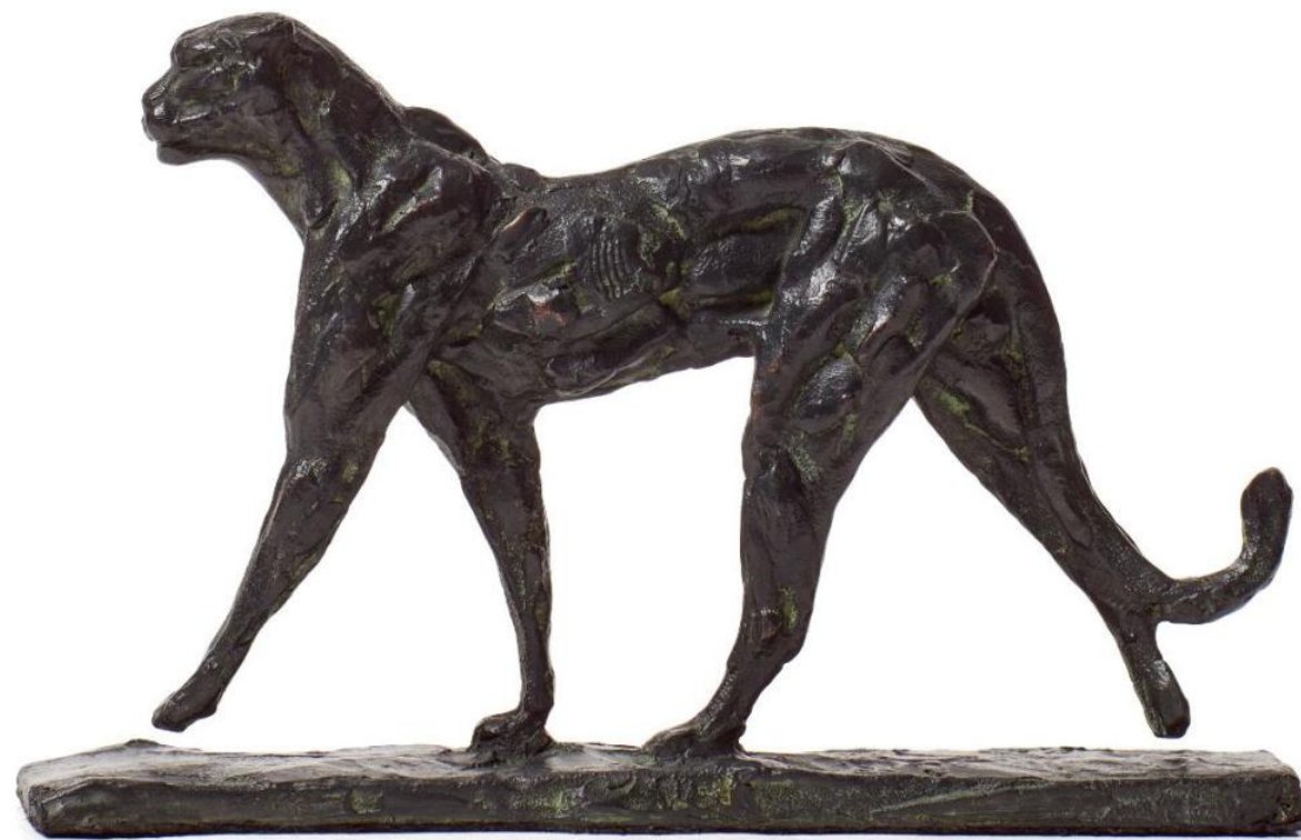
WALKING CHEETAH III MINIATURE (S380) BRONZE, EDITION OF 100 13,5 x 4,5 x 20,5 cm