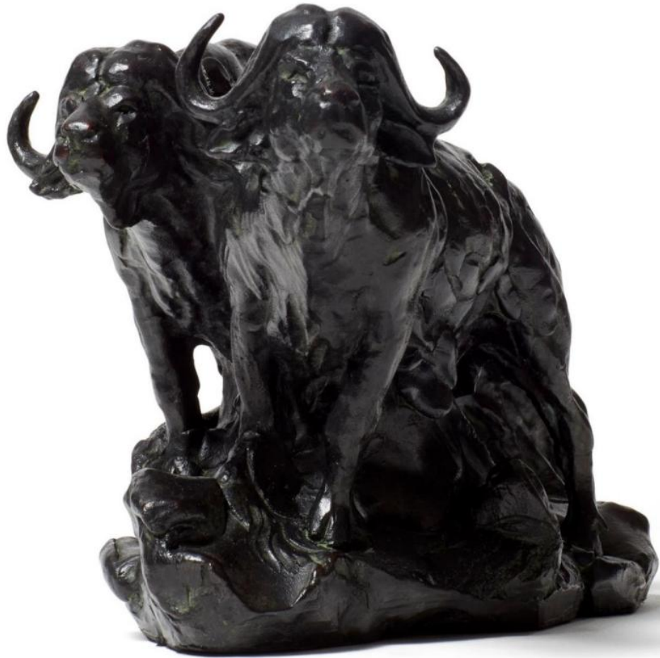
BUFFALO BULL PAIR MINIATURE (S398) BRONZE, EDITION OF 100 15,5 x 14 x 24 cm