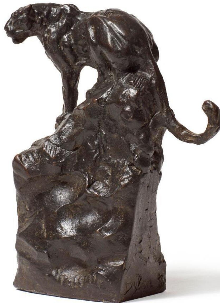
ELEVATED LEOPARD II MINIATURE (S389) BRONZE, EDITION OF 100 17 x 6 x 14 cm