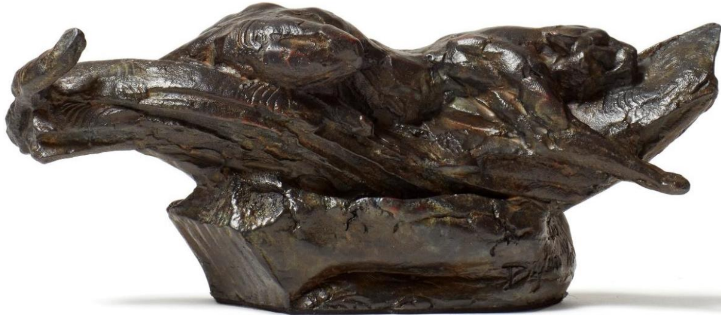
SLEEPING LEOPARD MINIATURE (S410) BRONZE, EDITION OF 100 9,5 x 8 x 22 cm