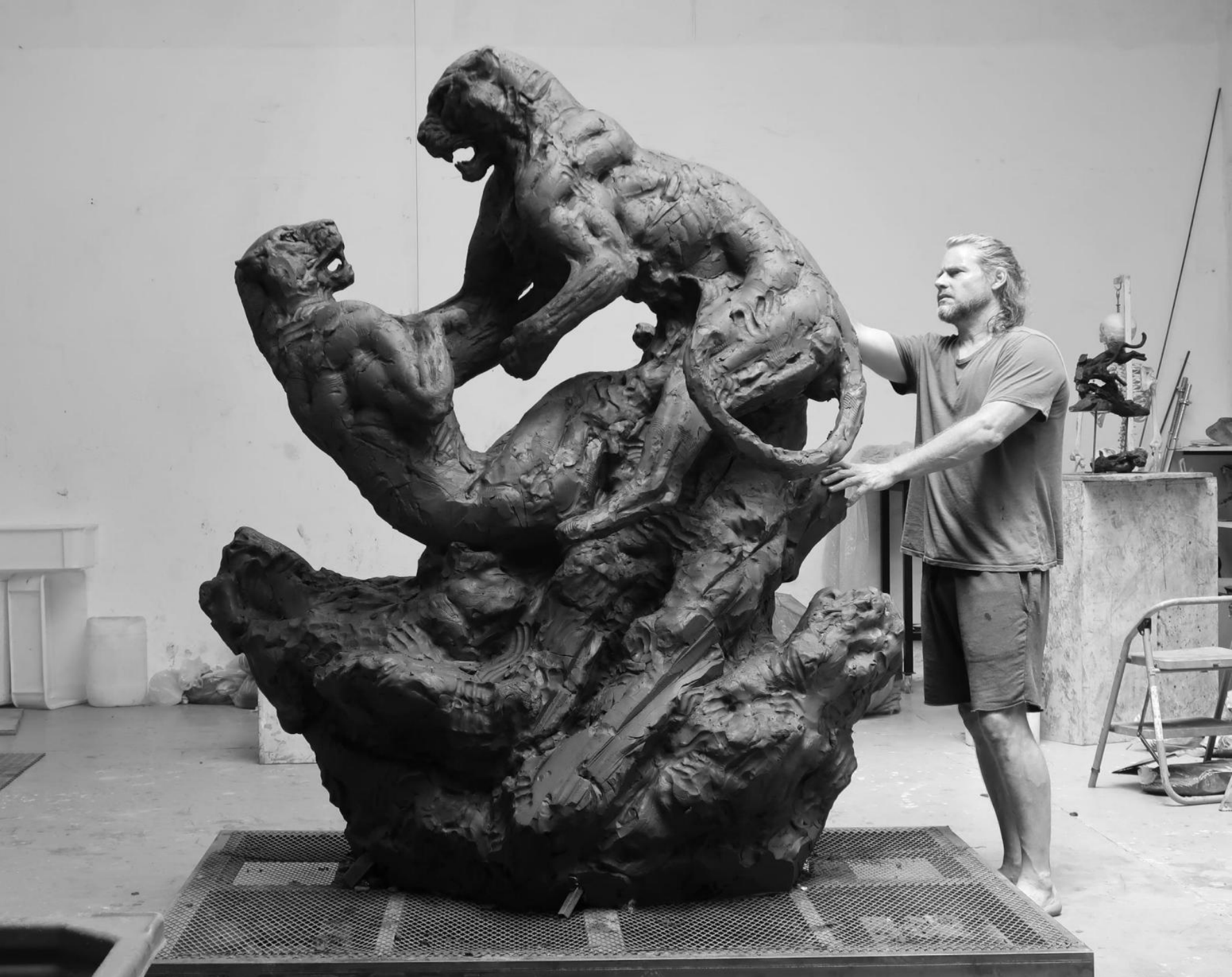
PREVIOUS PAGE DETAIL AND LEFT IMAGE OF SCULPTURE IN CLAY - STILL TO BE CAST FIGHTING LEOPARD PAIR III (S390) BRONZE, EDITION OF 12 208 x 120 x 176 cm