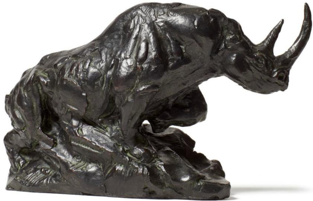
CHARGING BLACK RHINO MINIATURE (S400) BRONZE, EDITION OF 100 13 x 10 x 23 cm