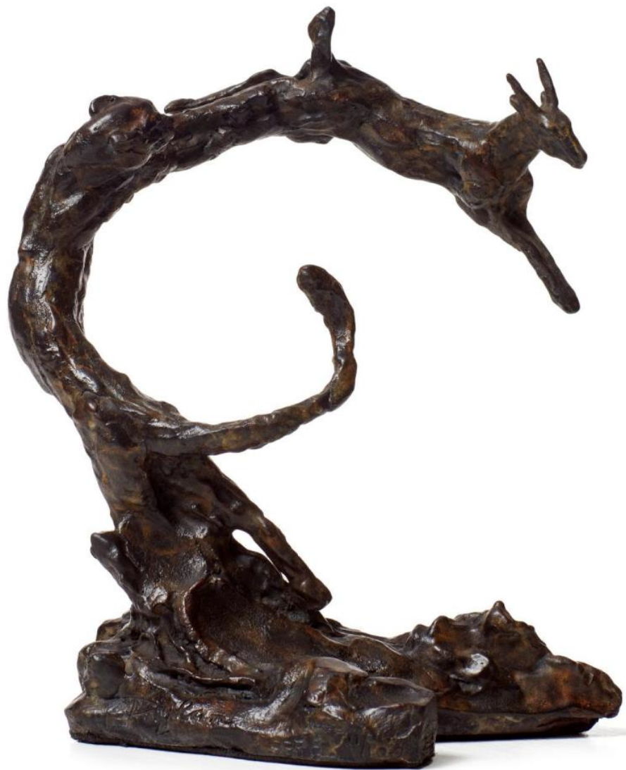
CHEETAH CHASING BUCK MINIATURE (S378) BRONZE, EDITION OF 100 21 x 15,5 x 17 cm