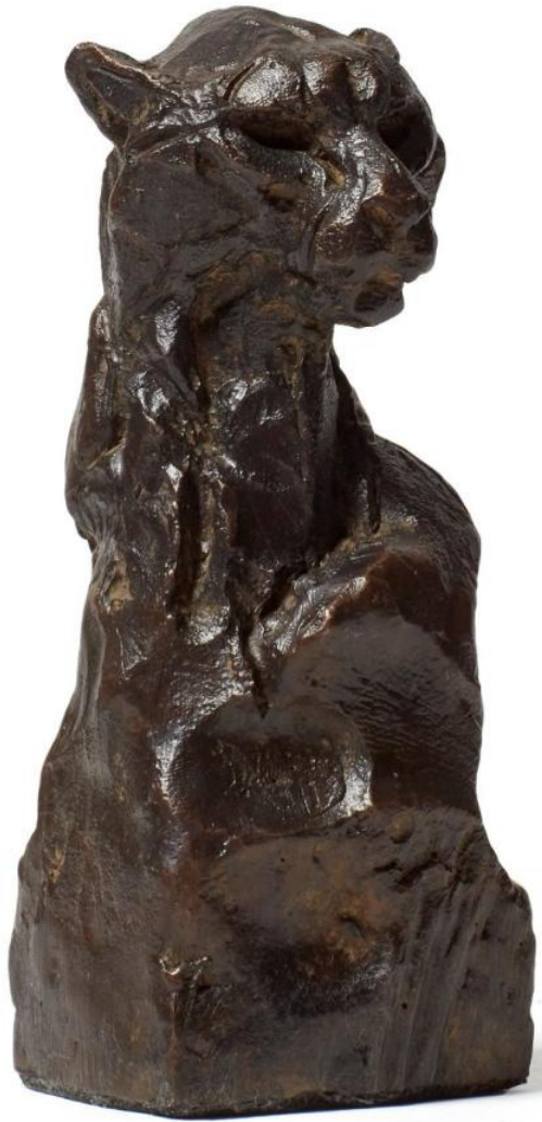
CHEETAH HEAD II MINIATURE (S402) BRONZE, EDITION OF 100 13 x 5 x 4,5 cm