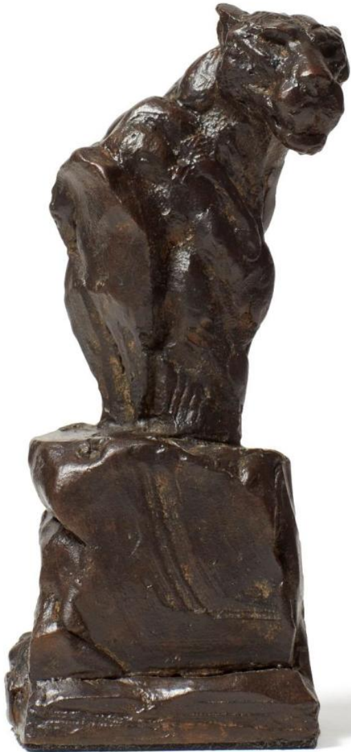
SITTING LEOPARD BUST MINIATURE (S406) BRONZE, EDITION OF 100 16 x 6 x 7 cm