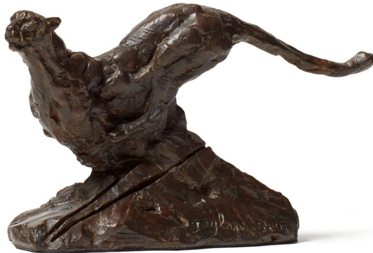
RUNNING CHEETAH III MINIATURE (S409) BRONZE, EDITION OF 100 13 x 7 x 23,5 cm