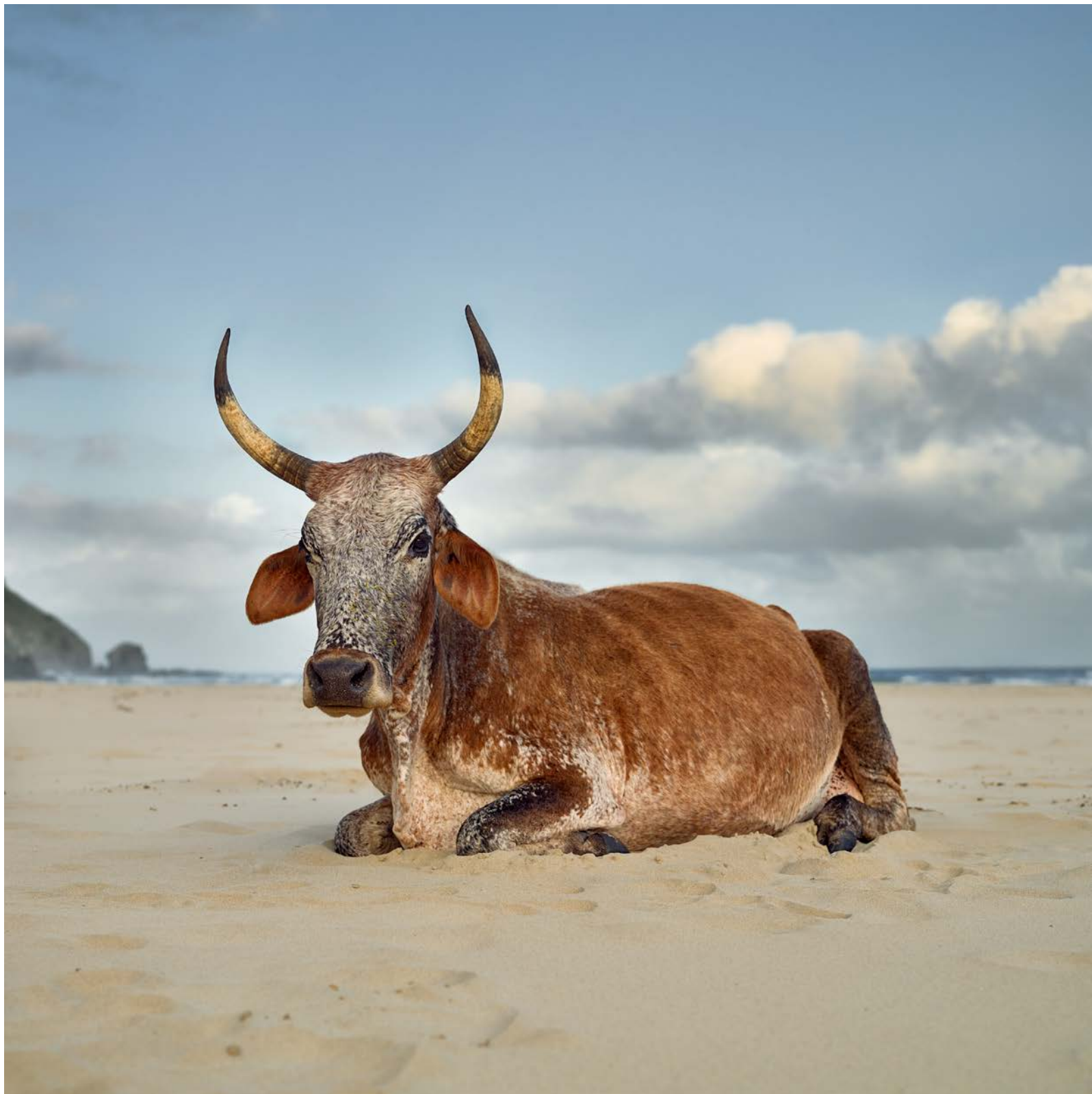
Xhosa Nguni cow sitting on the shore. Mpande, Eastern Cape, South Africa, 10 January 2019