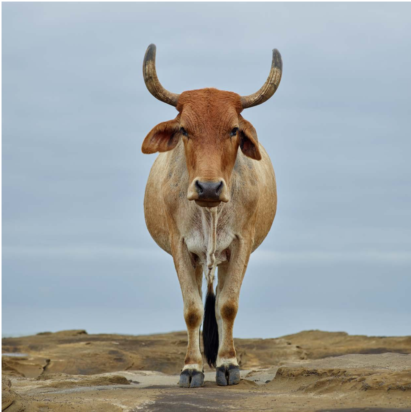
Xhosa bull on the shore. Kiwane, Eastern Cape, South Africa, 14 April 2018