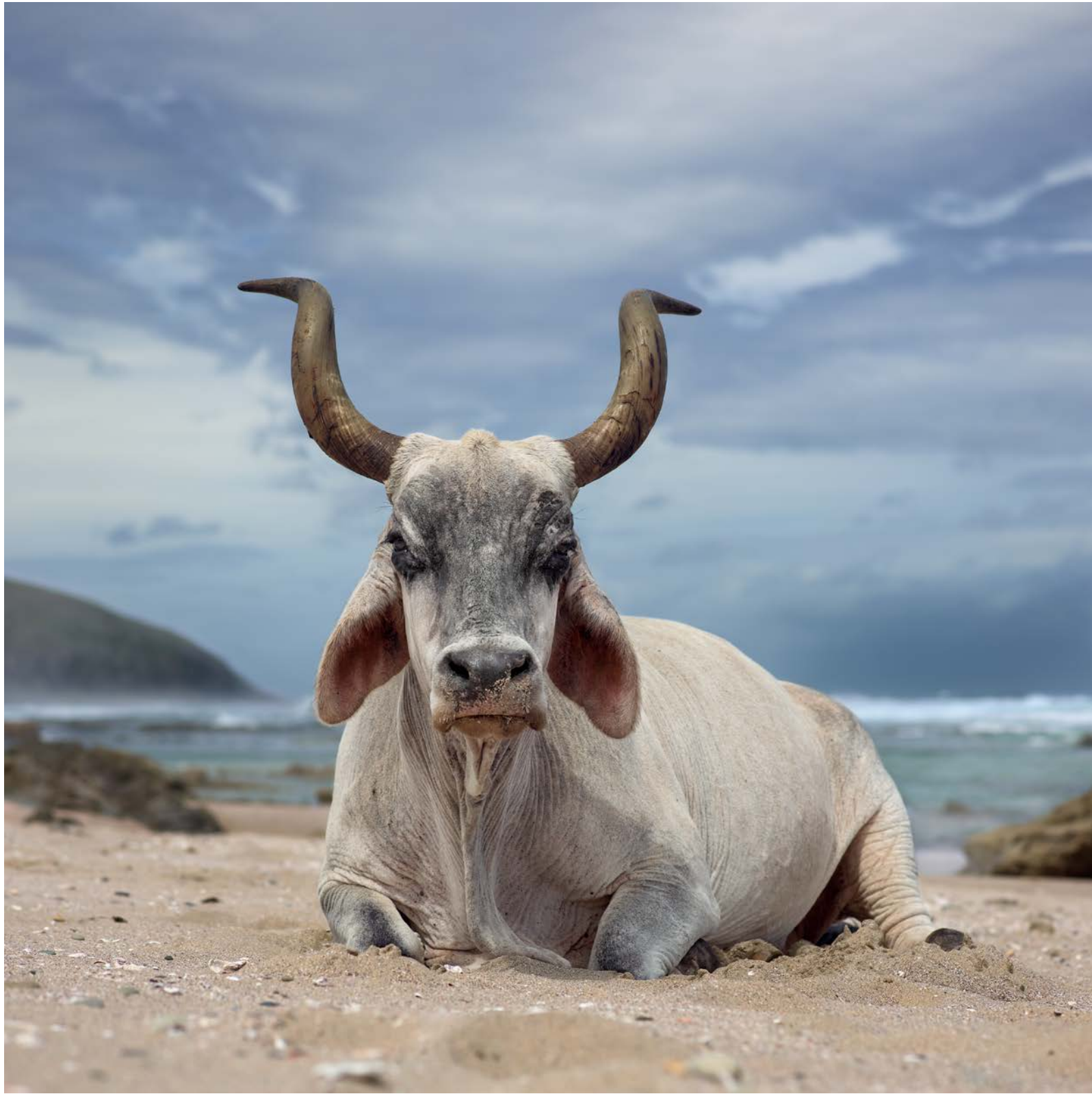
Xhosa Ox sitting on the shore. Hluleka, Eastern Cape, South Africa, 4 December 2019