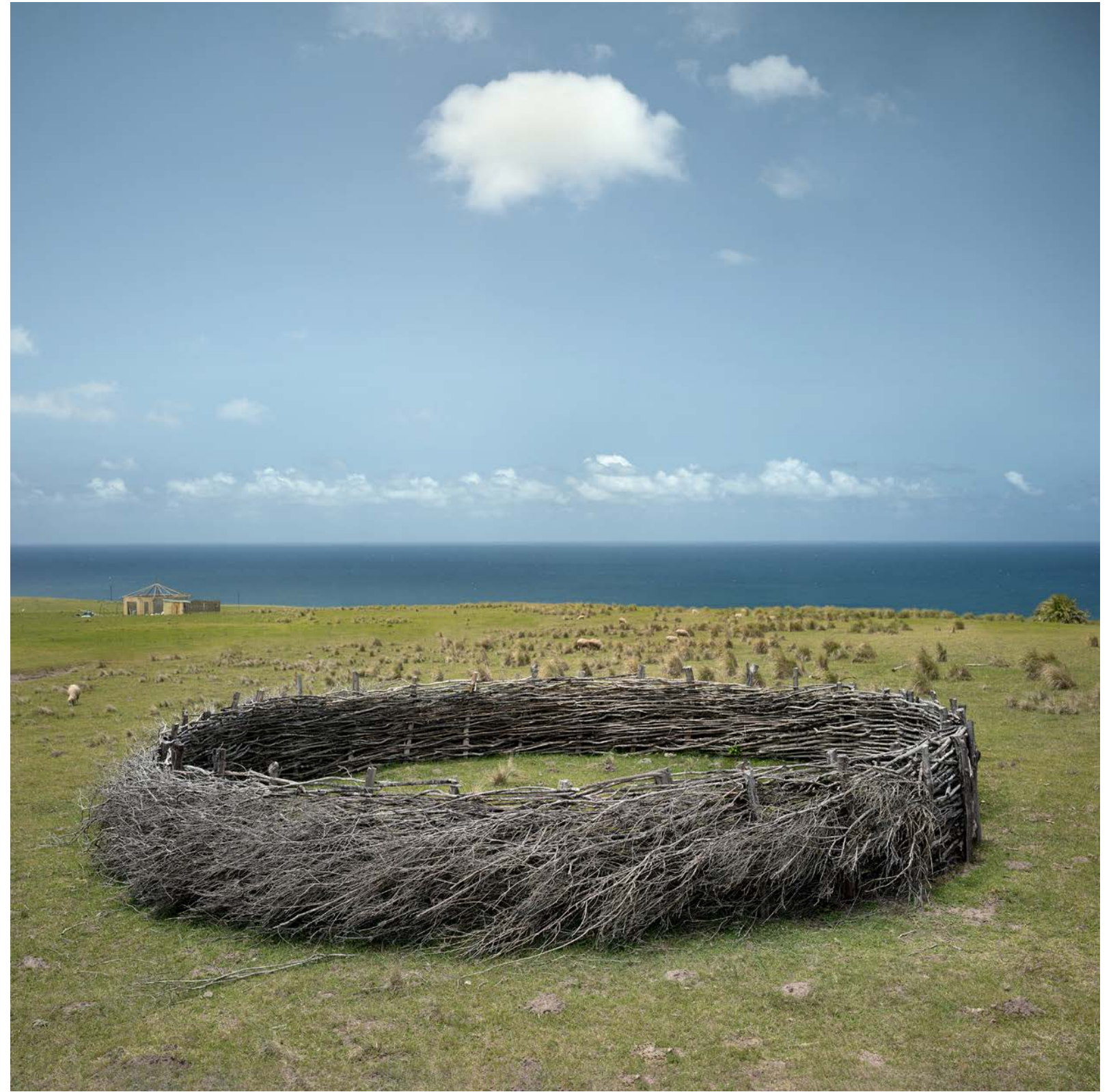
Xhosa Kraal. Ncata, Eastern Cape, South Africa, 12 December 2019