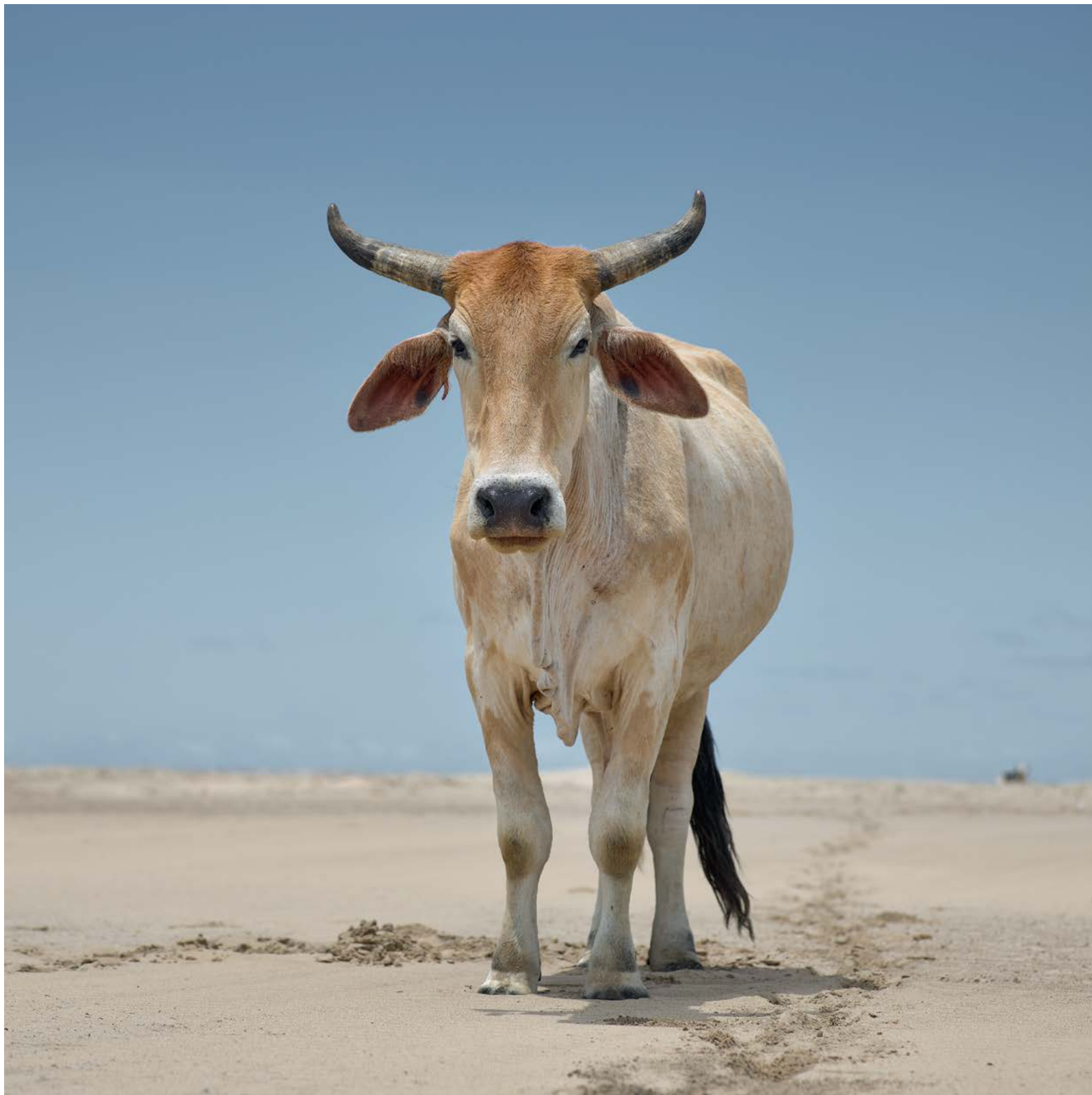
Xhosa Ox on the shore. Umthata River Mouth, Eastern Cape, South Africa, 5 December 2019