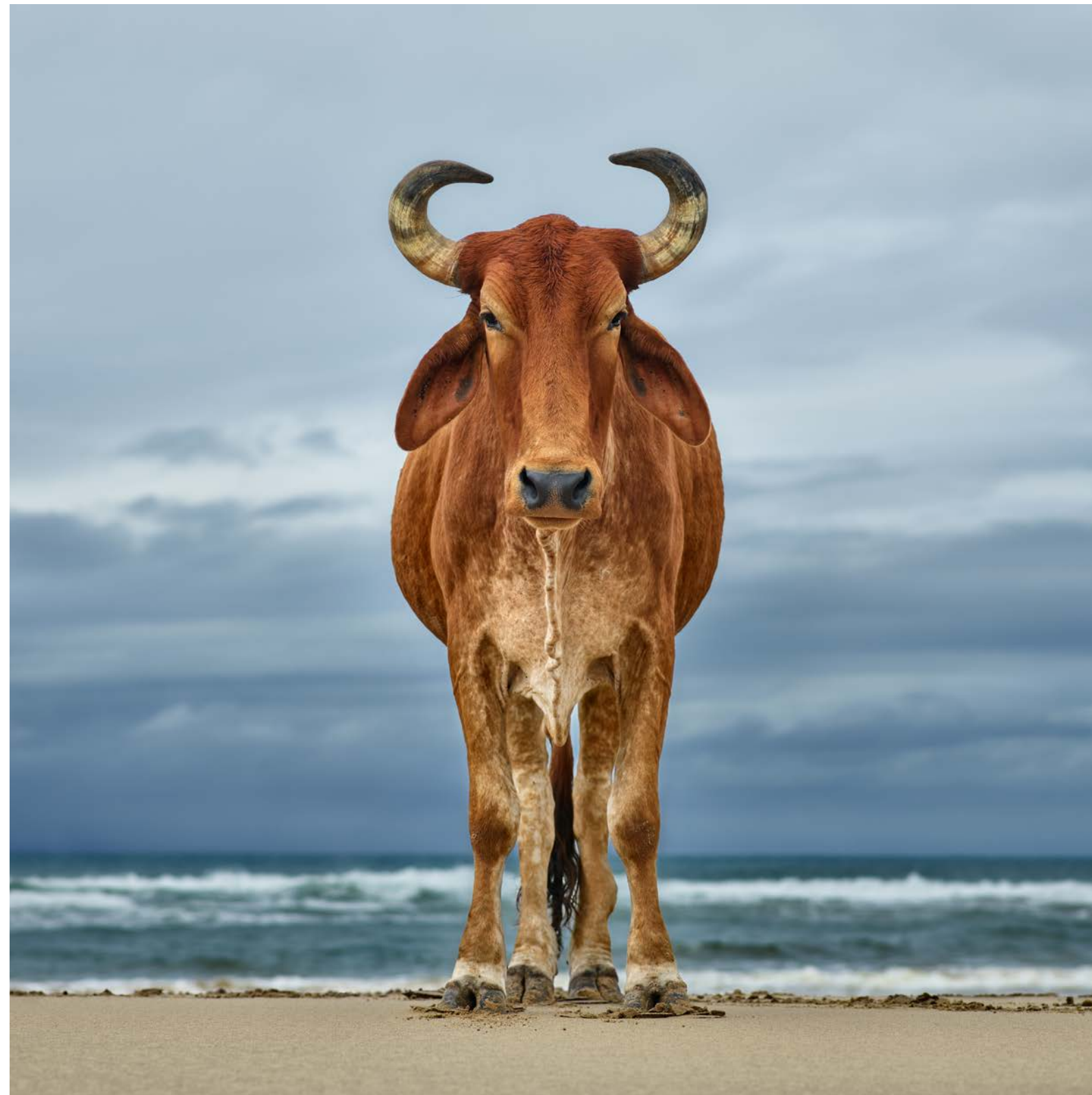
Xhosa bull on the shore. Kiwane, Eastern Cape, South Africa, 12 April 2018