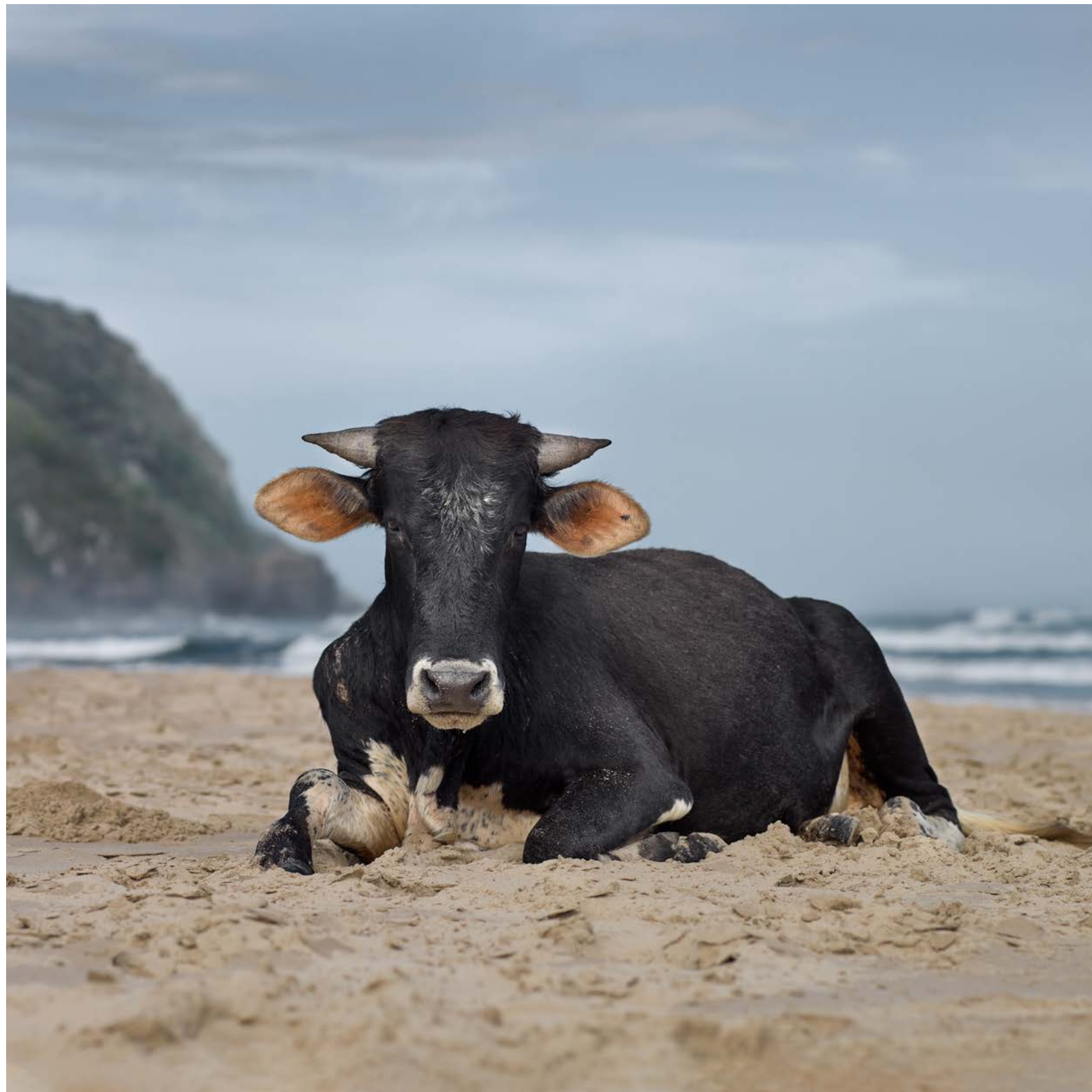
Xhosa Heifer sitting on the shore. Mpande, Eastern Cape, South Africa, 14 January 2019