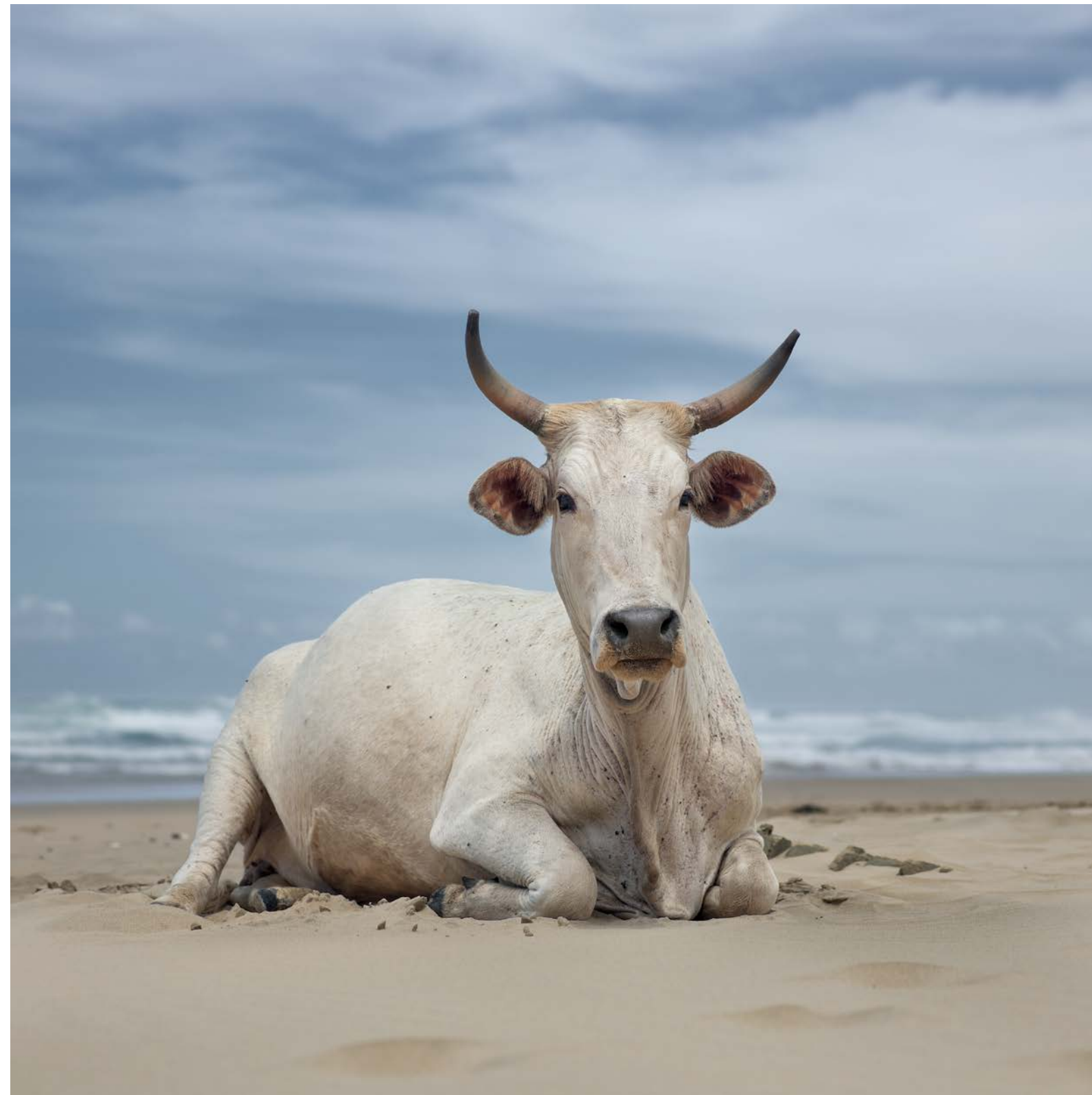
Xhosa cow sitting on the shore. Noxova, Eastern Cape, South Africa, 5 December 2019