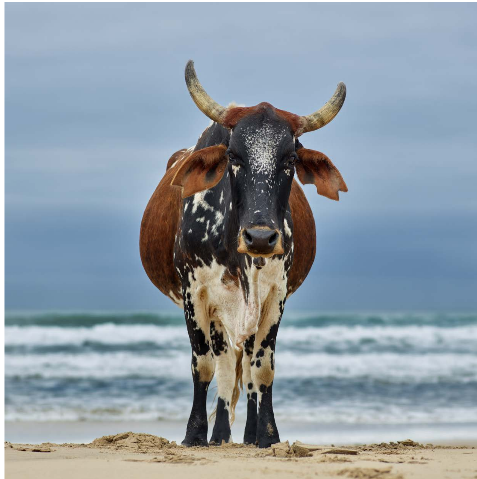
Xhosa cow on the shore. Qoloha, Eastern Cape, South Africa, 14 April 2018