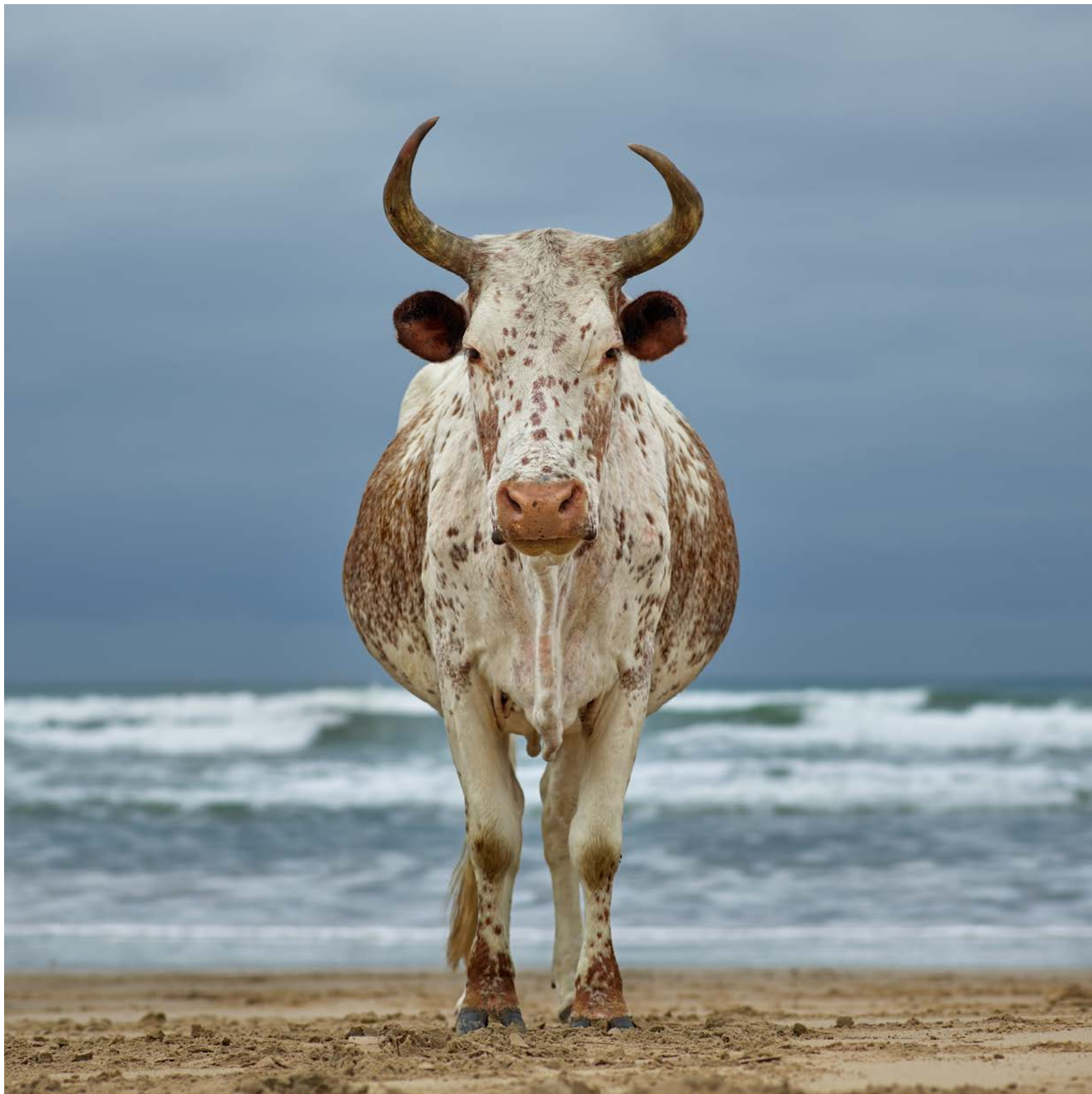
Xhosa Nguni cow on the shore. Kiwane, Eastern Cape, South Africa, 5 April 2018