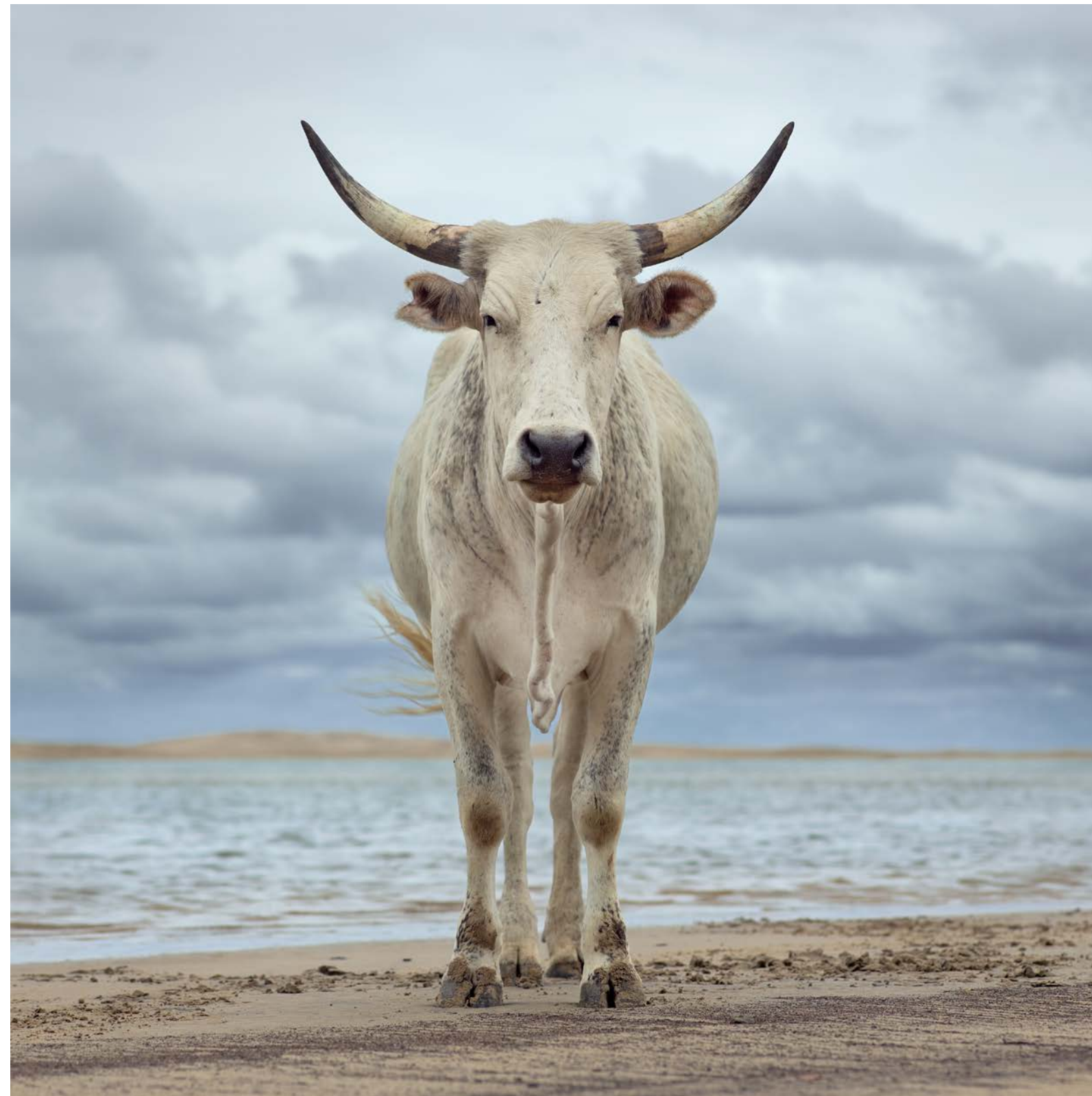
Xhosa cow on the shore. Kei River Mouth, Eastern Cape, South Africa, 9 December 2019