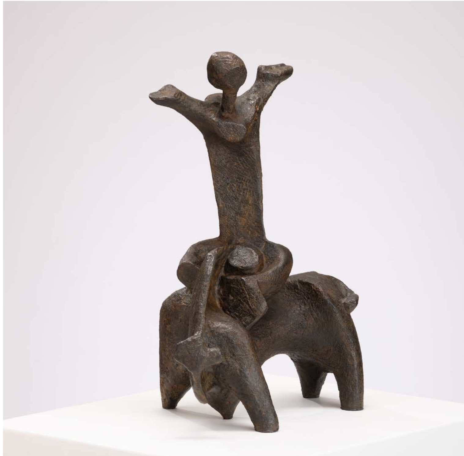
SPEELMAN MAHLANGU Riding the Bull I (Maquette) bronze Edition of 8 44 x 32.5 x 20 cm