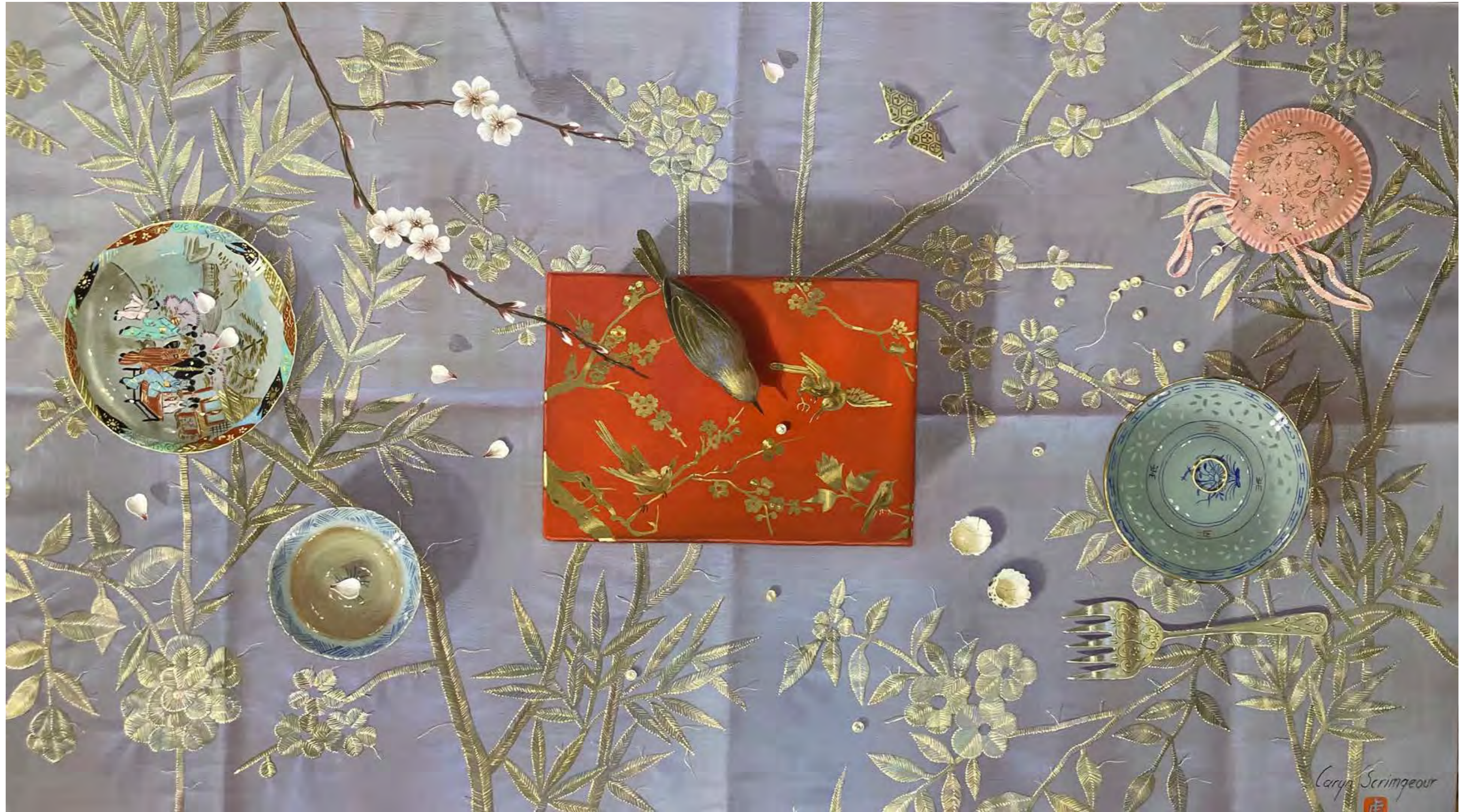
Compromise oil on linen 40 x 70 cm 15 5/8 x 27 1/2 in