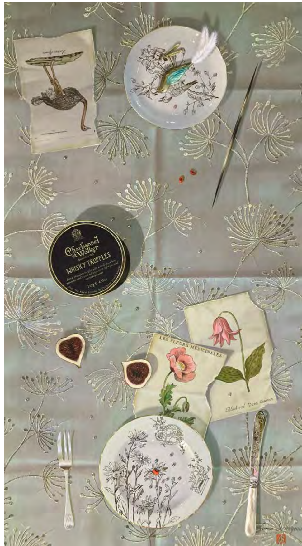
Sleight of hand oil on linen 70 x 40 cm 27 1/2 x 15 5/8 in