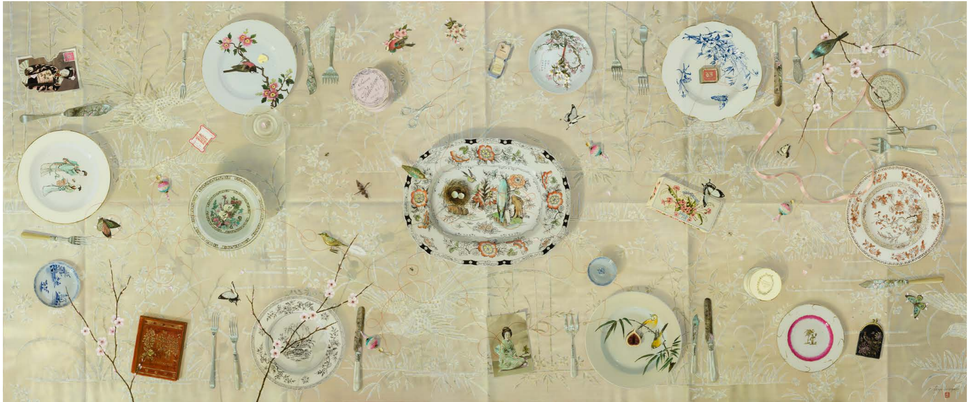
Keepsake oil on linen 100 x 240 cm 39 1/4 x 94 3/8 in