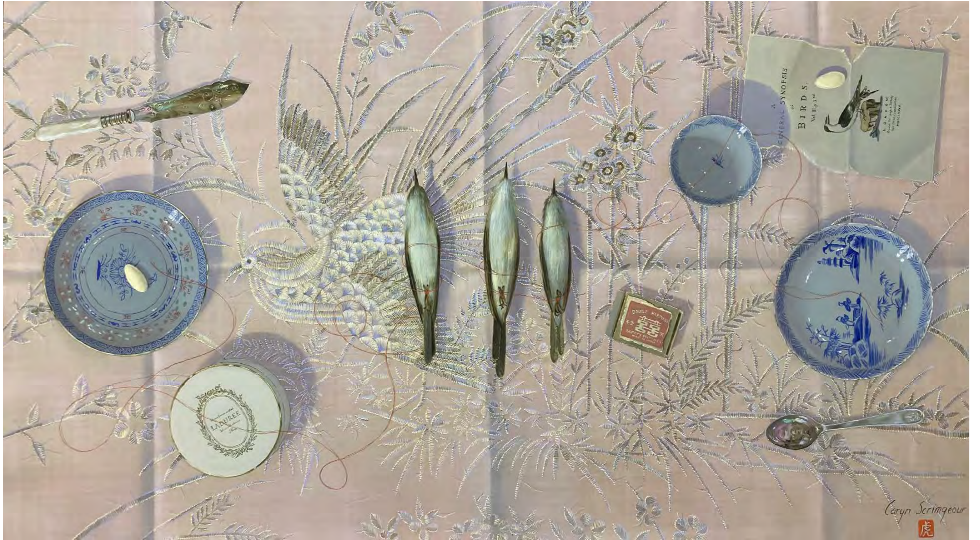
Loose ends oil on linen 40 x 70 cm 15 5/8 x 27 1/2 in