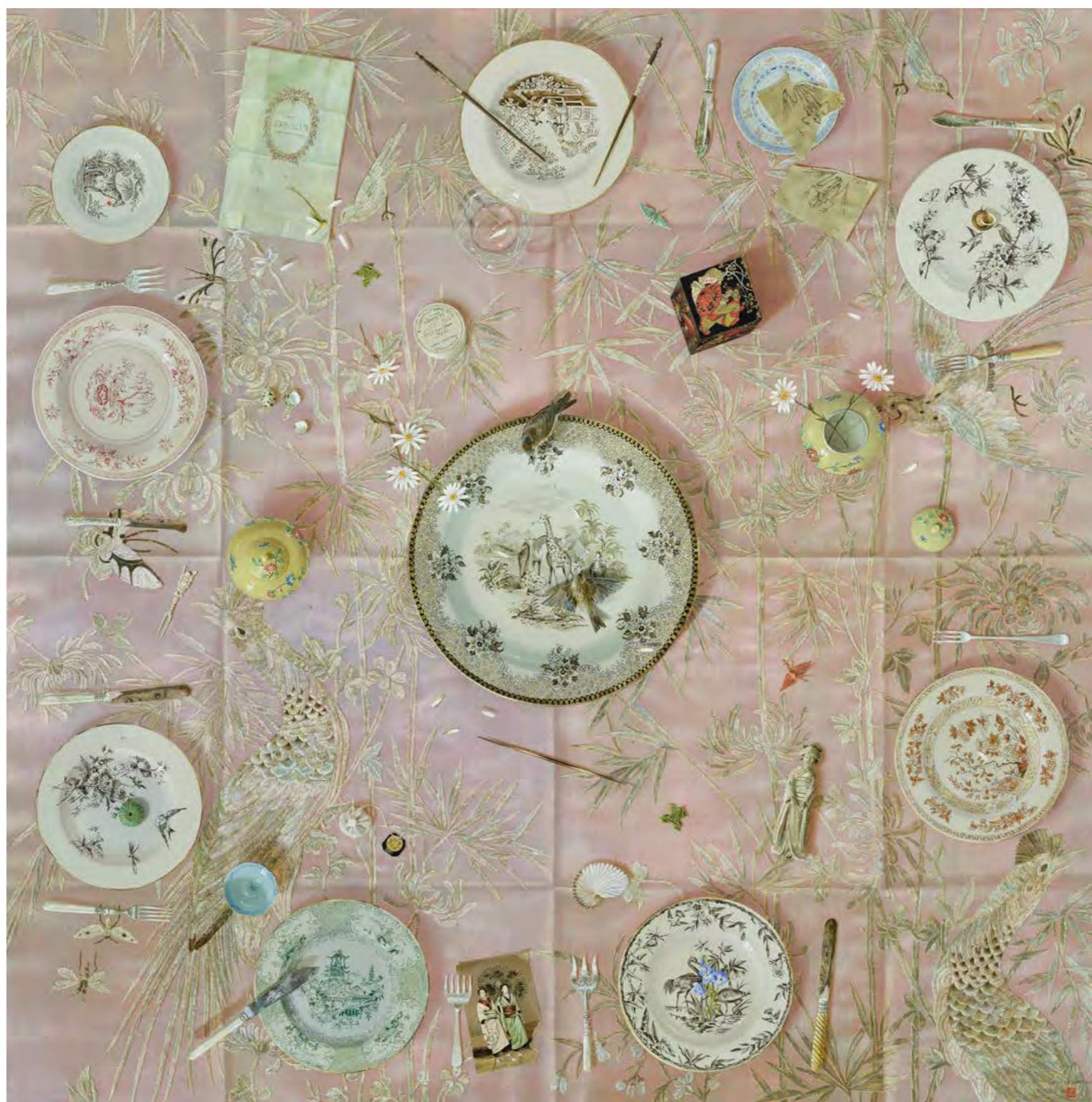
Daisies pied and violets blue oil on linen 150 x 150 cm 59 x 59 in