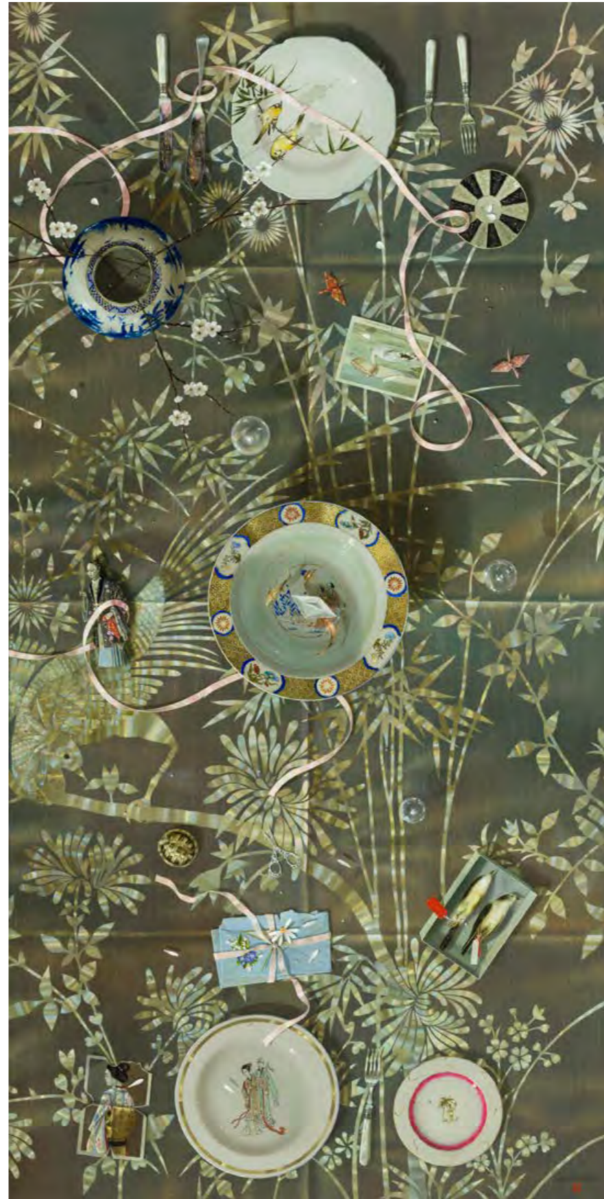
Ties that bind I & II (diptych) oil on linen 180 x 180 cm 70 3/4 x 70 3/4 in