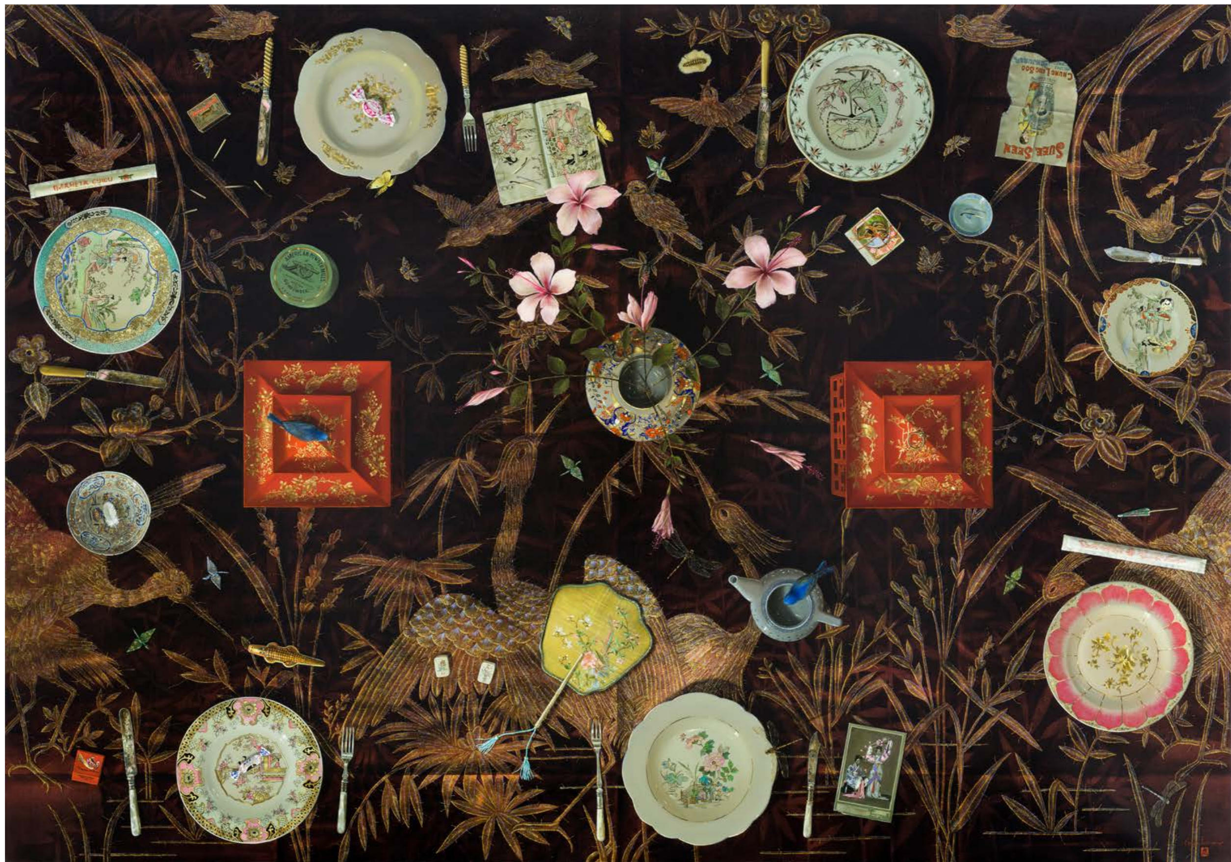
Paper tigers oil on linen 140 x 200 cm 55 x 78 5/8 in