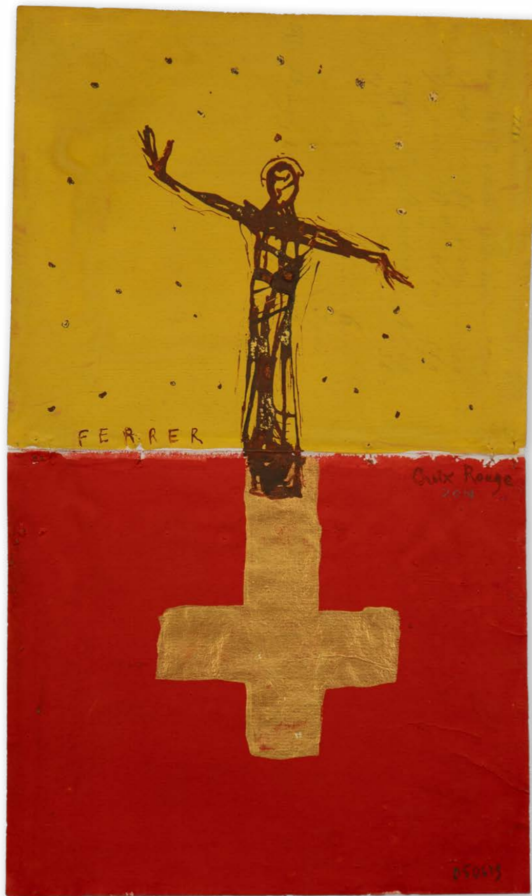
Croix Rouge ink and gold leaf on antique paper 29 x 17 cm 11 3 / 8 x 6 5 / 8 in.