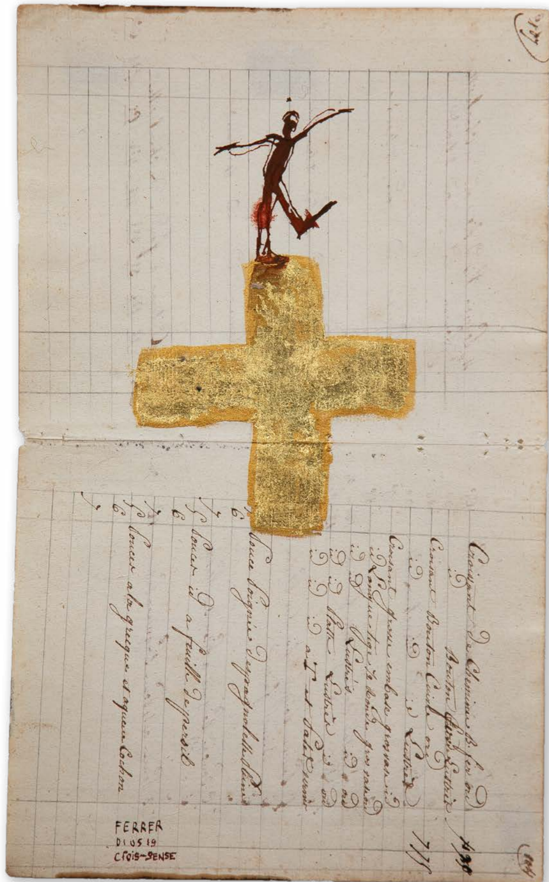
Crois-Sense ink and gold leaf on antique paper 28 x 17 cm 11 x 6 5/8 in.