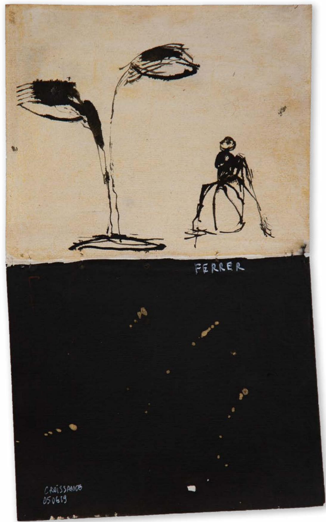
Croissance ink on antique paper 28 x 17 cm 11 x 6 5/8 in.