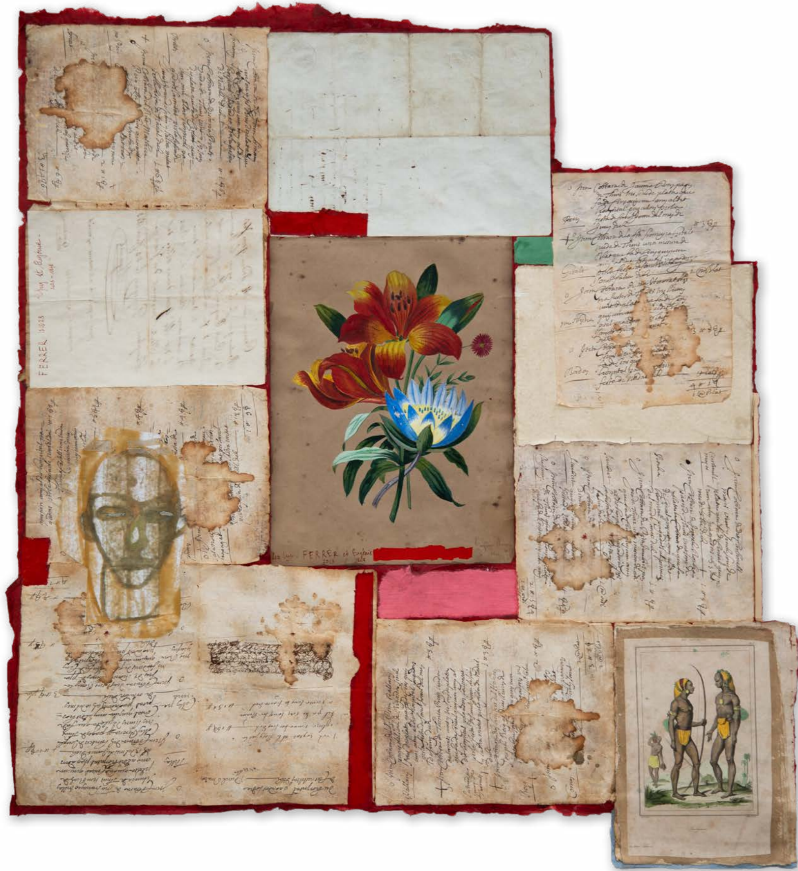
Les Lys collage and ink on antique paper 71 x 65 cm 27 7/8 x 25 1/2 in.