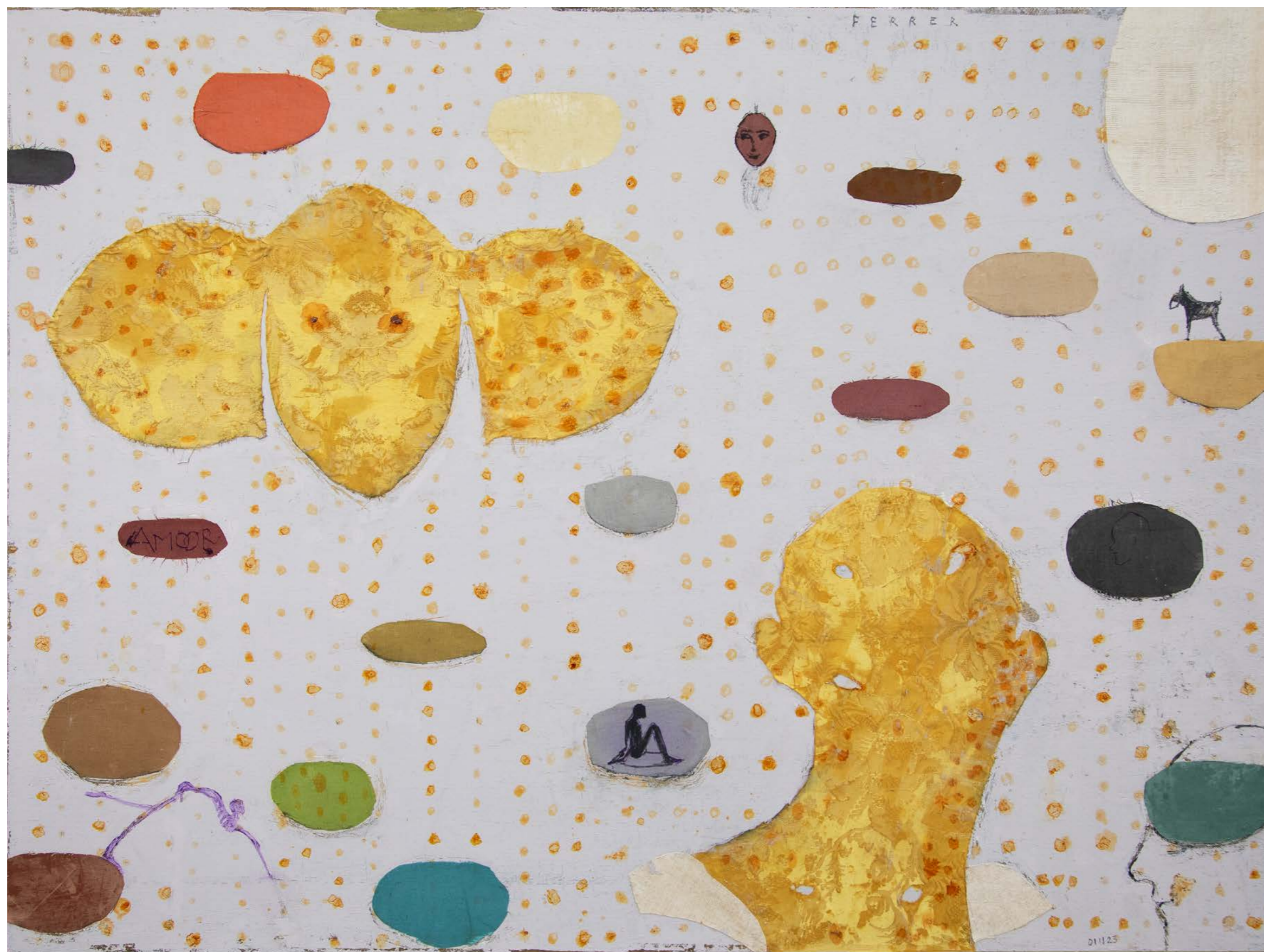
Jeu D'Or mixed media on canvas 97 x 130 cm 38 1/8 x 51 1/8 in.