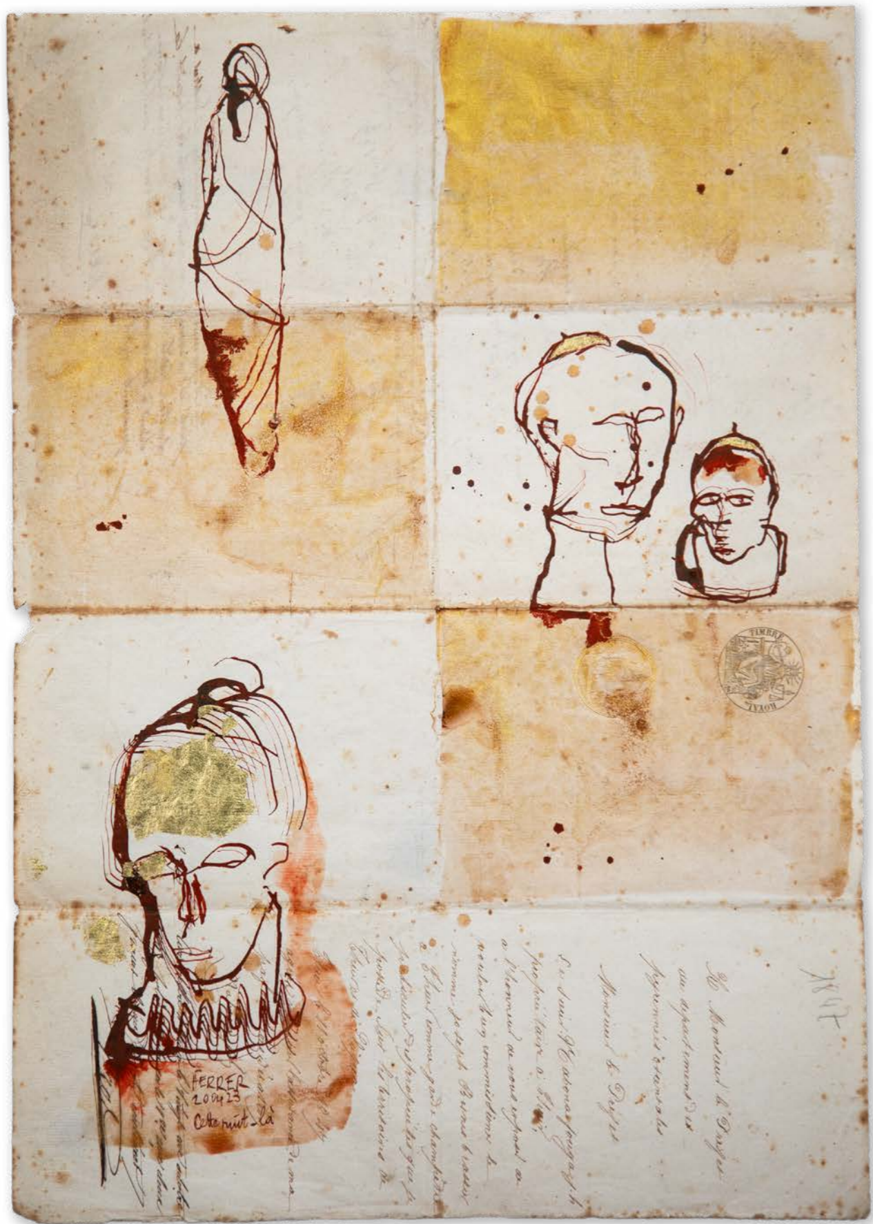
Cette Nuit-La ink and gold leaf on antique paper 42 x 30 cm 16 1/2 x 11 3/4 in.