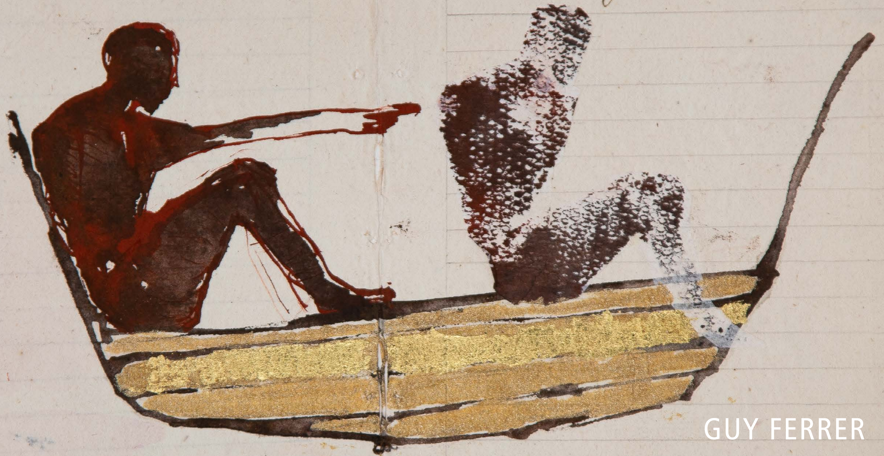
GUY FERRER Assemblages

Linee D'Allemagne de toutes especes Sage