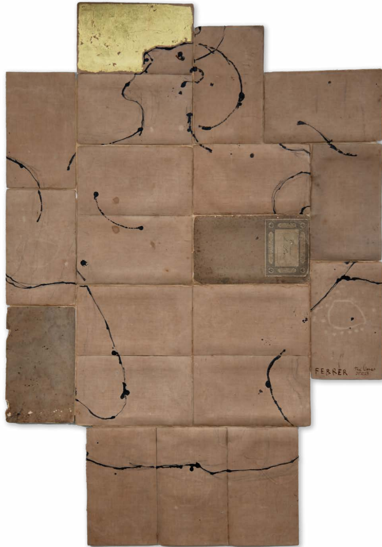
The Upper gutta and gold leaf on antique paper 93 x 65 cm 36 1/2 x 25 1/2 in.