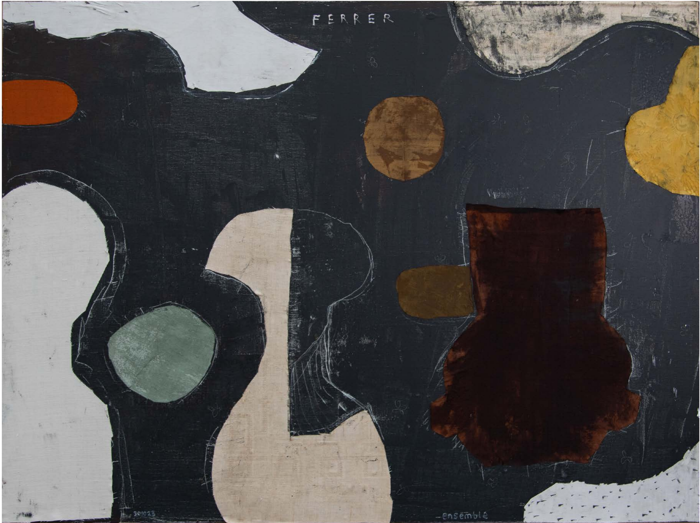
Ensemble mixed media on canvas 97 x 130 cm 38 1/8 x 51 1/8 in.