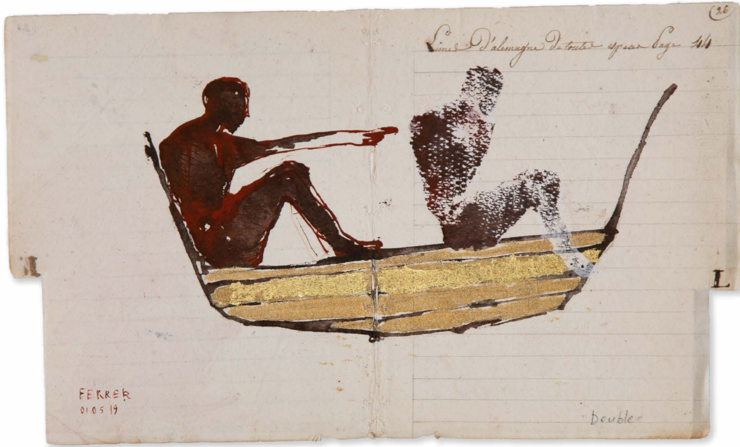
Double ink, collage and gold leaf on antique paper 17 x 29 cm 6 5/8 x 11 3/8 in.