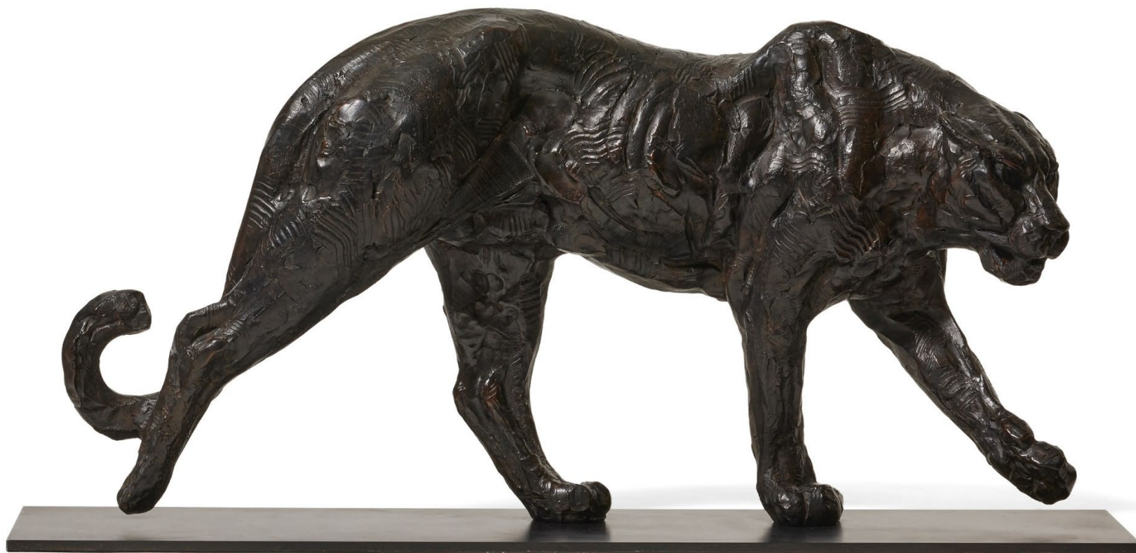
S494 Walking Leopard VII Maquette