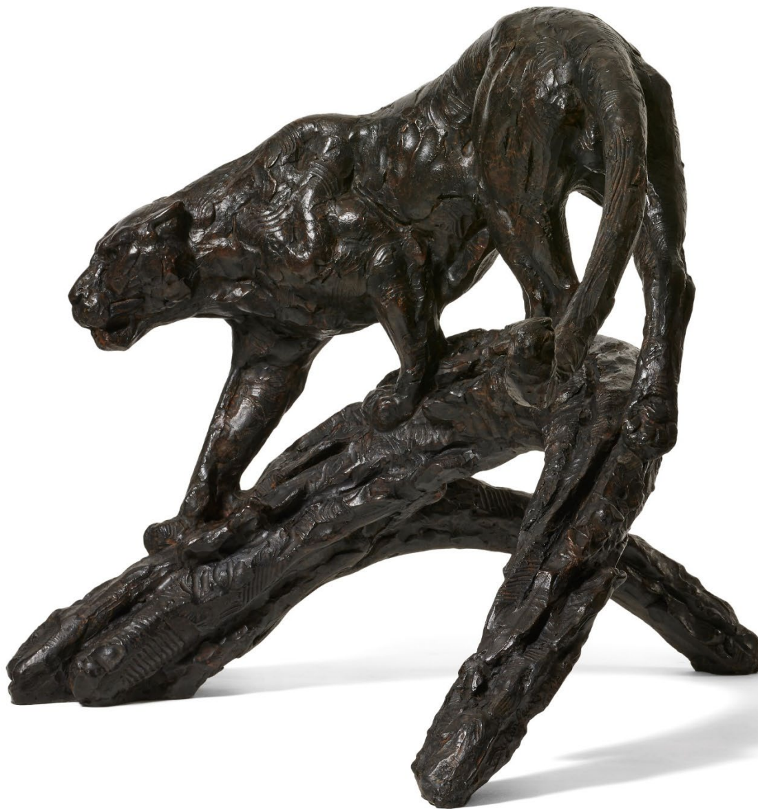
S491 Leopard on Branch Maquette