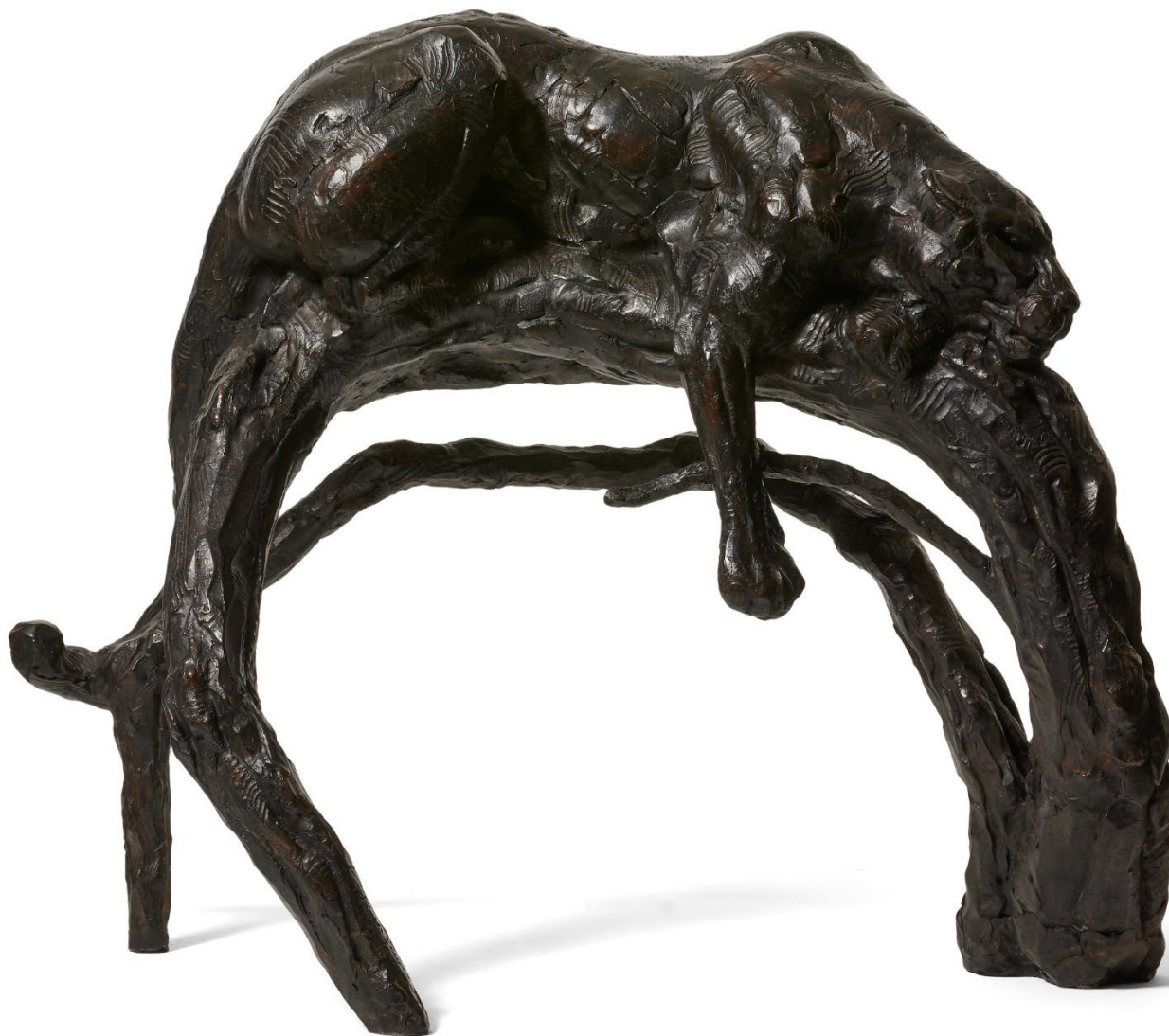
S492 Sleeping Leopard Maquette II Edition of 12 bronze 66 x 82 x 46 cm 26 x 32 1/4 x 18 in