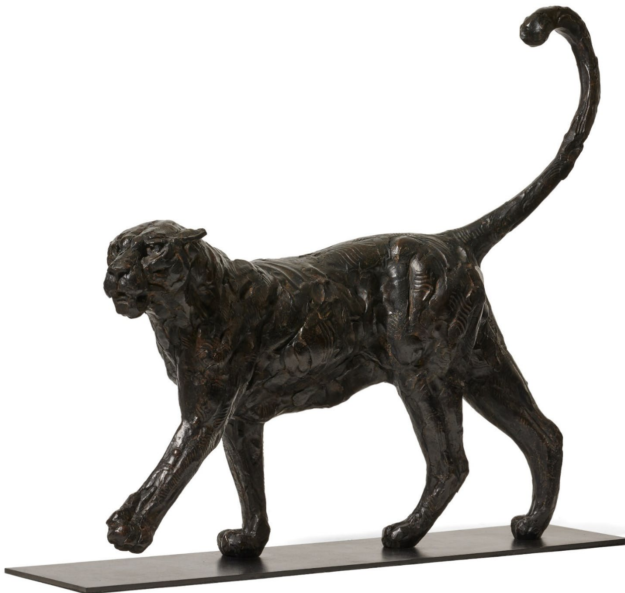
S489 Walking Leopard VI Maquette