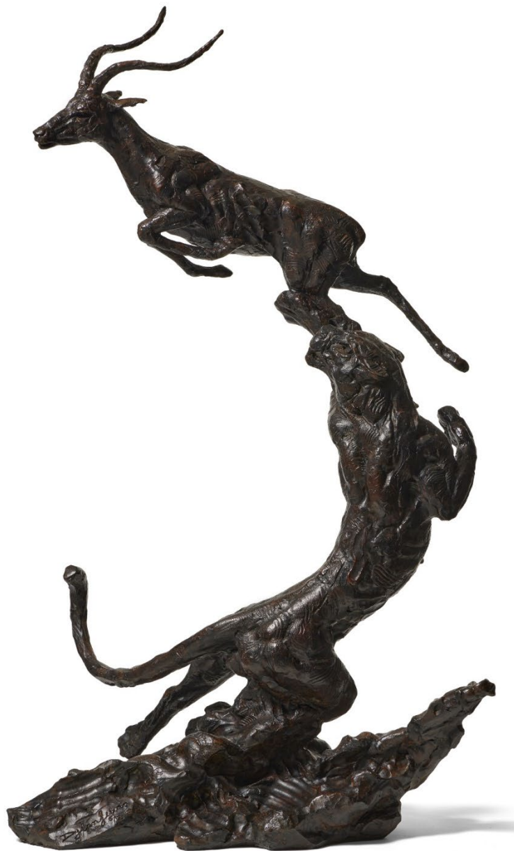
S490 Leopard Chasing Impala Maquette