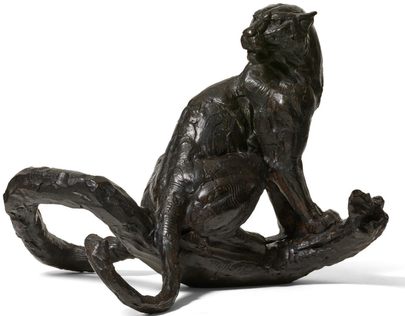
S495 Sitting Leopard Maquette IV